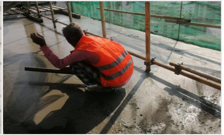
L-15-Toilet Floor CC with NCF on 28-01-24