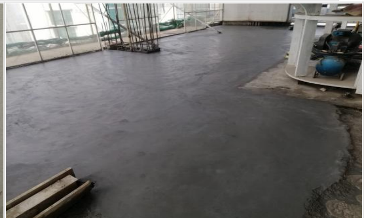
L-14-Floor CC with NCF on 26-01-24