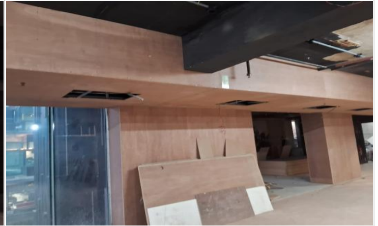
L-11-Outside Design Plaster on 22-01-24