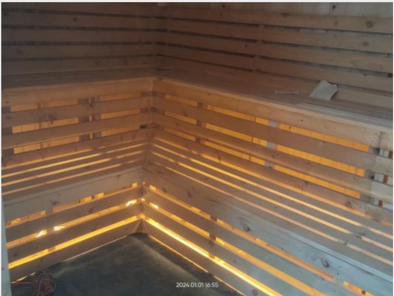
L-11-Steam-Suana-Wooden Wall-Lighting on 01-01-24