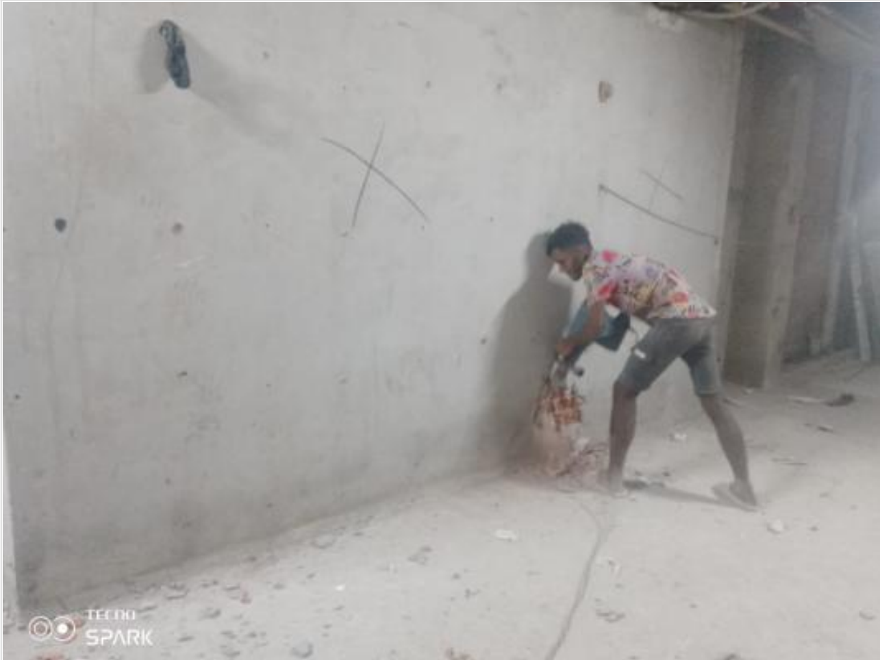
L-14-East-South Wall dismantling on 17-10-23