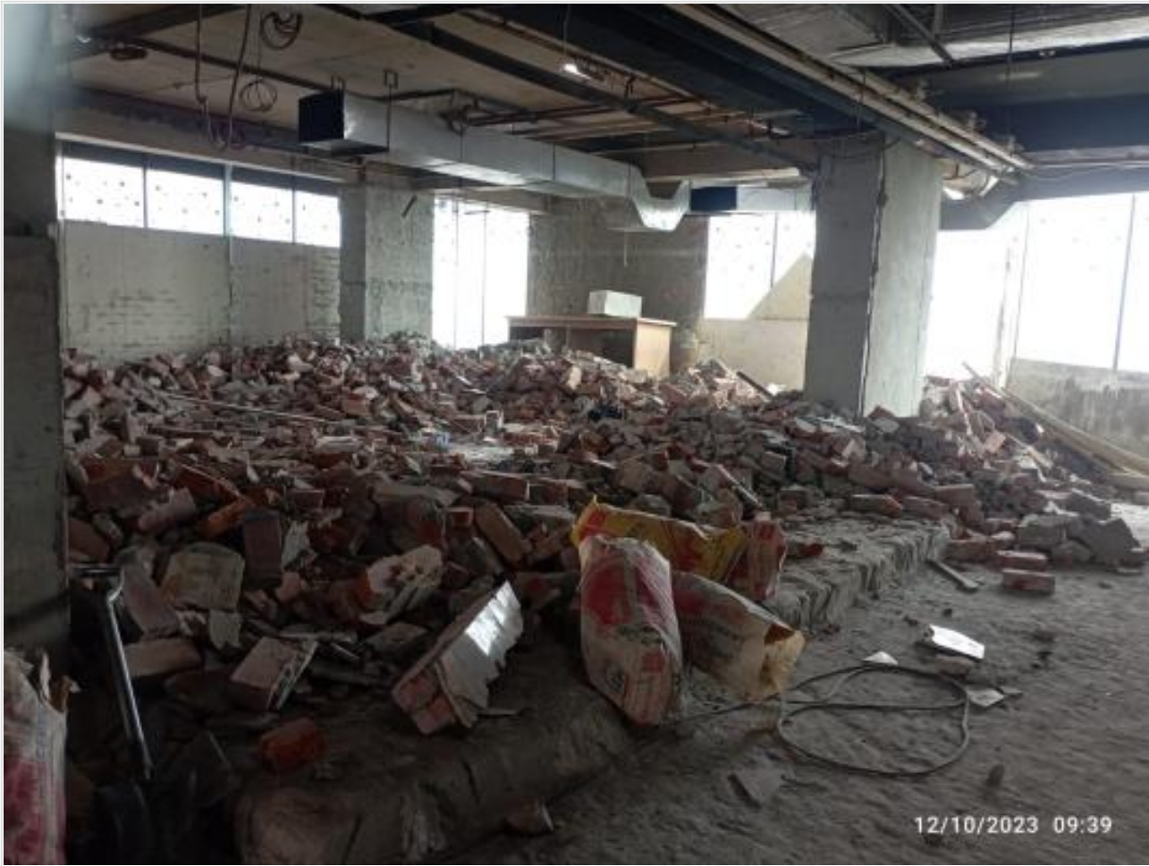
L-14-Old Kitchen wall dismantling on 11-10-23