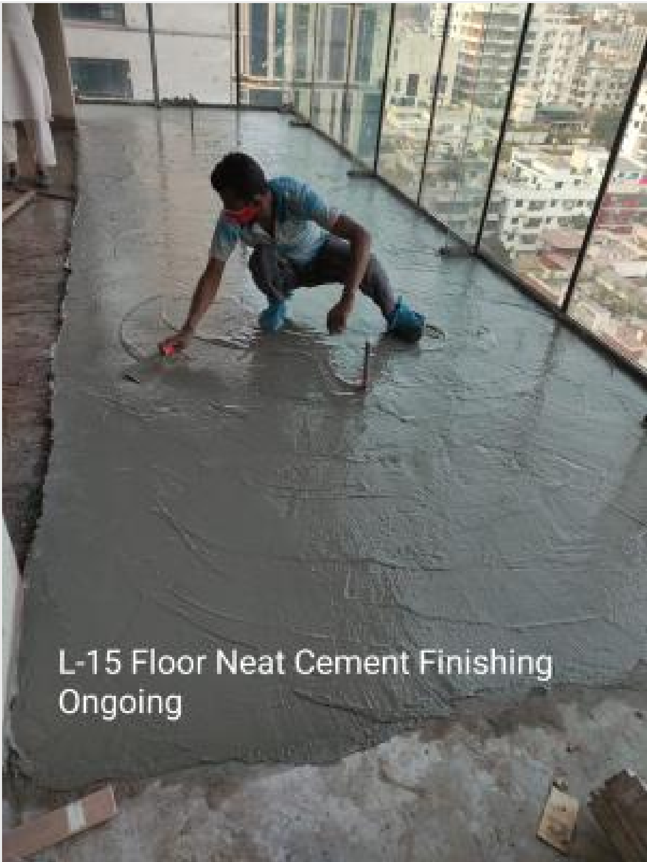
L-15-Floor Neat Cement Finishing on 12-02-23