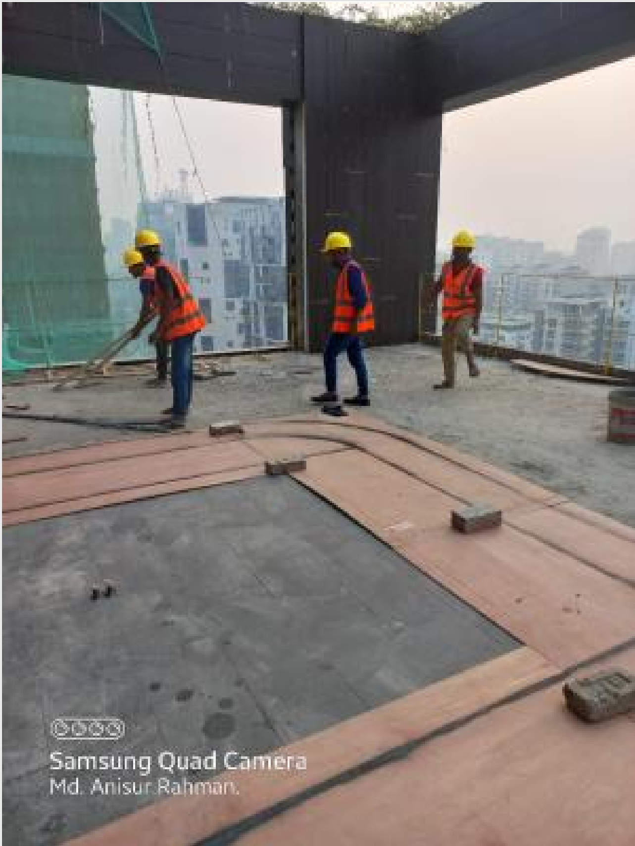
Carpentry Mock-up on 22-12-22