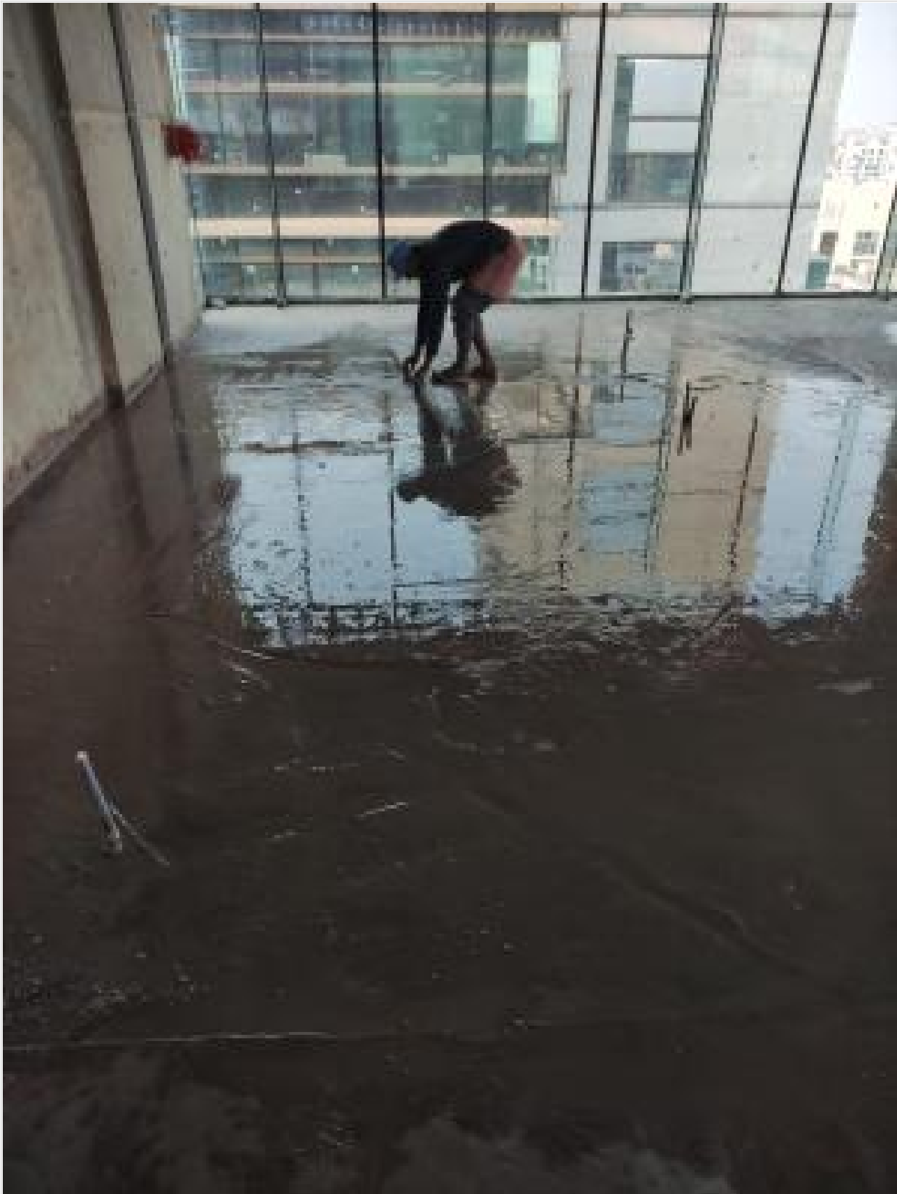
L-15-Floor Neat Cement Finishing on 12-02-23