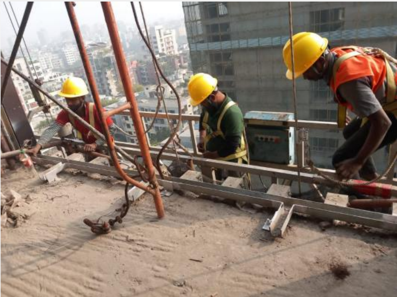
Glass Work on 31-12-22