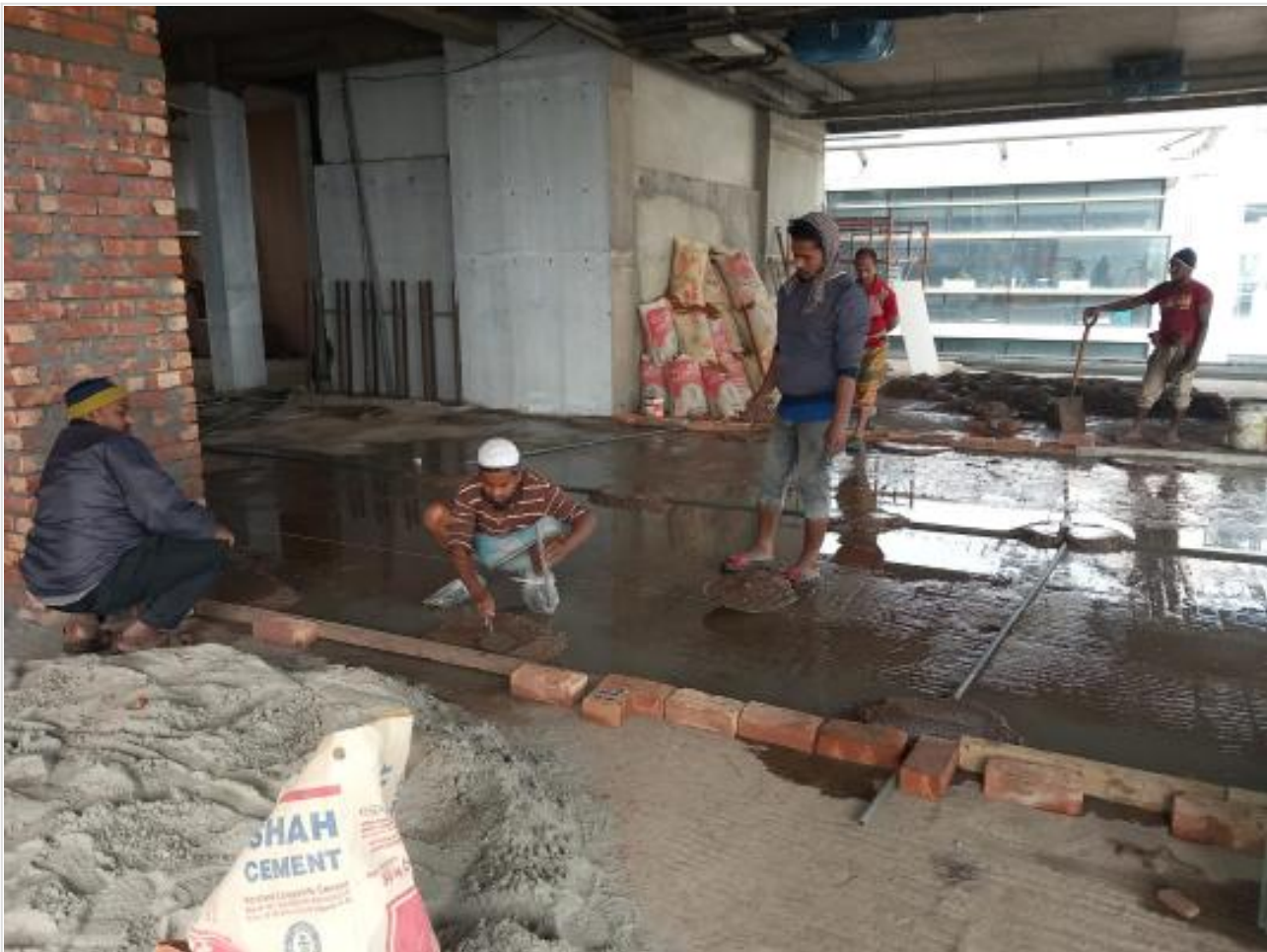
Floor Finishing-NCF on 03-01-23