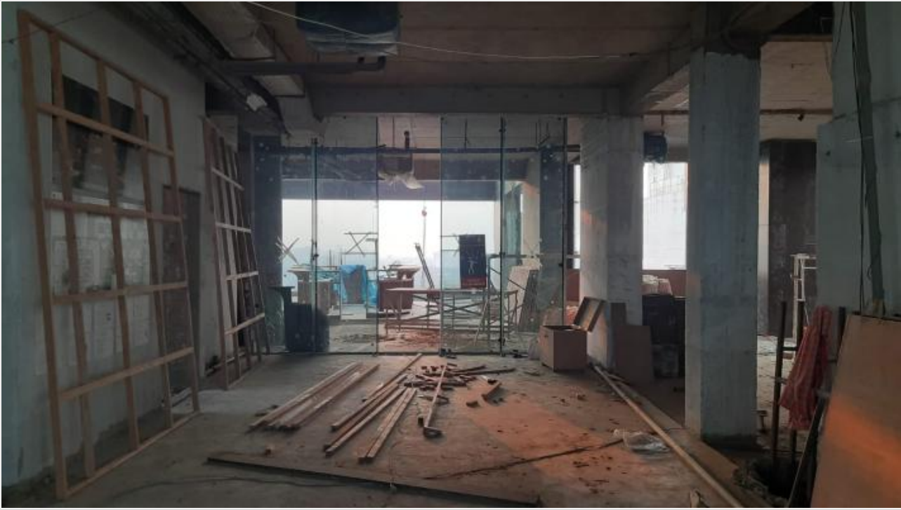
Wall Paneling on 08-02-23