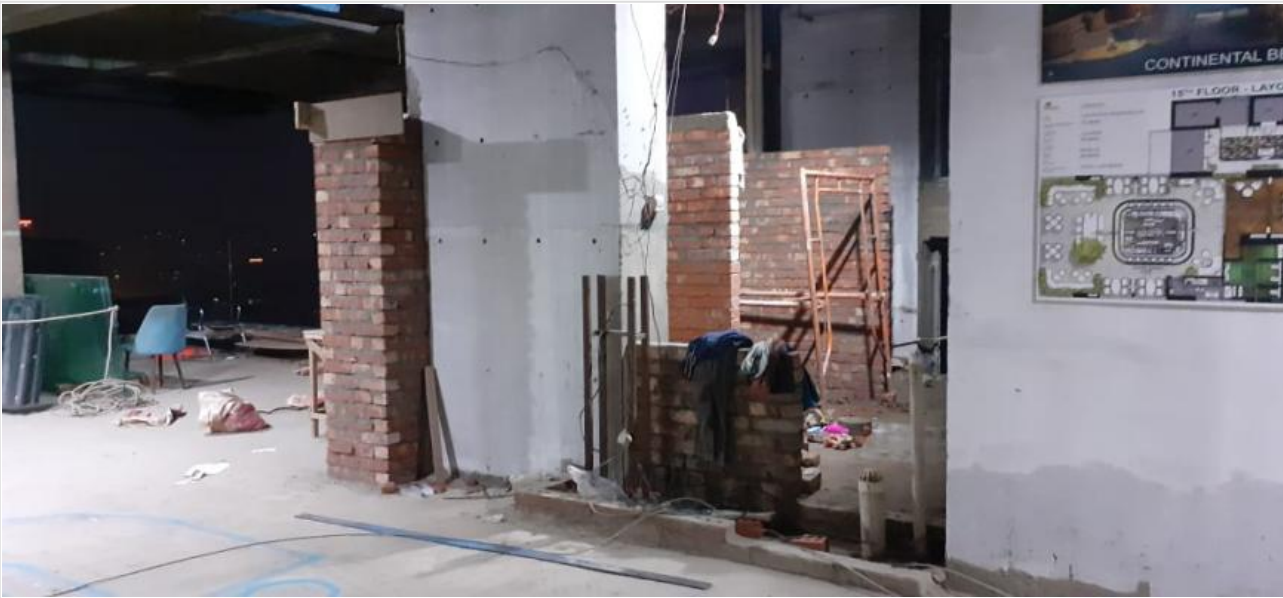
Wash Room Brick work on 31-12-22