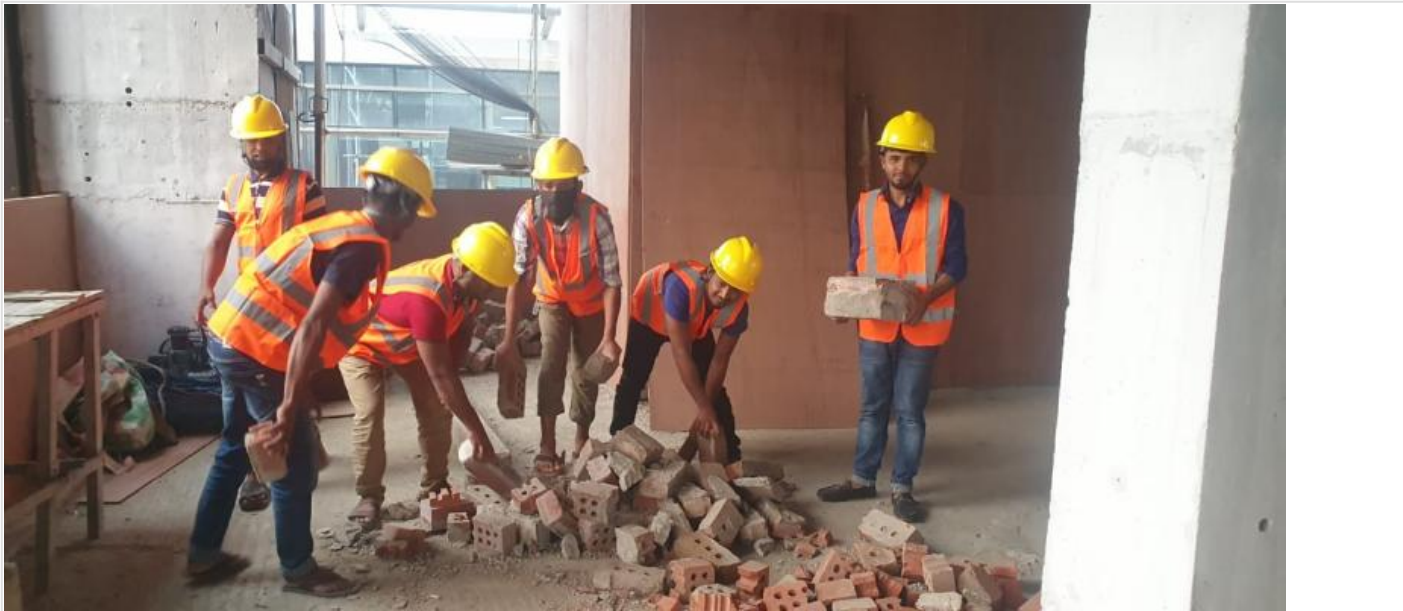
Brick work demolition on 22-12-22