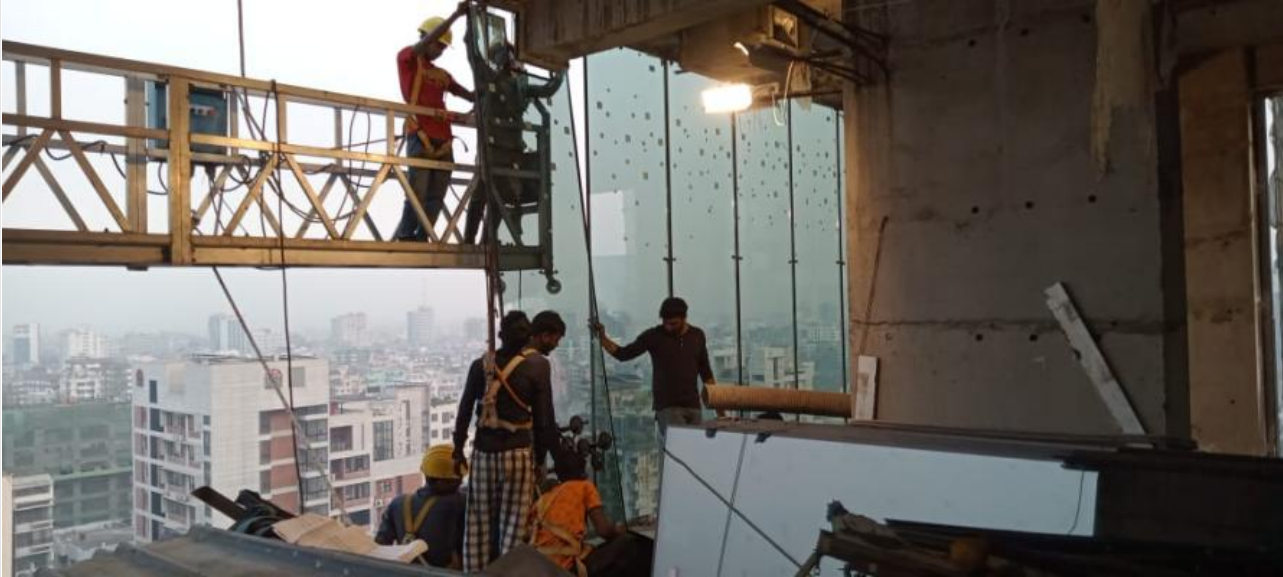
Fixing Glass on 09-01-23