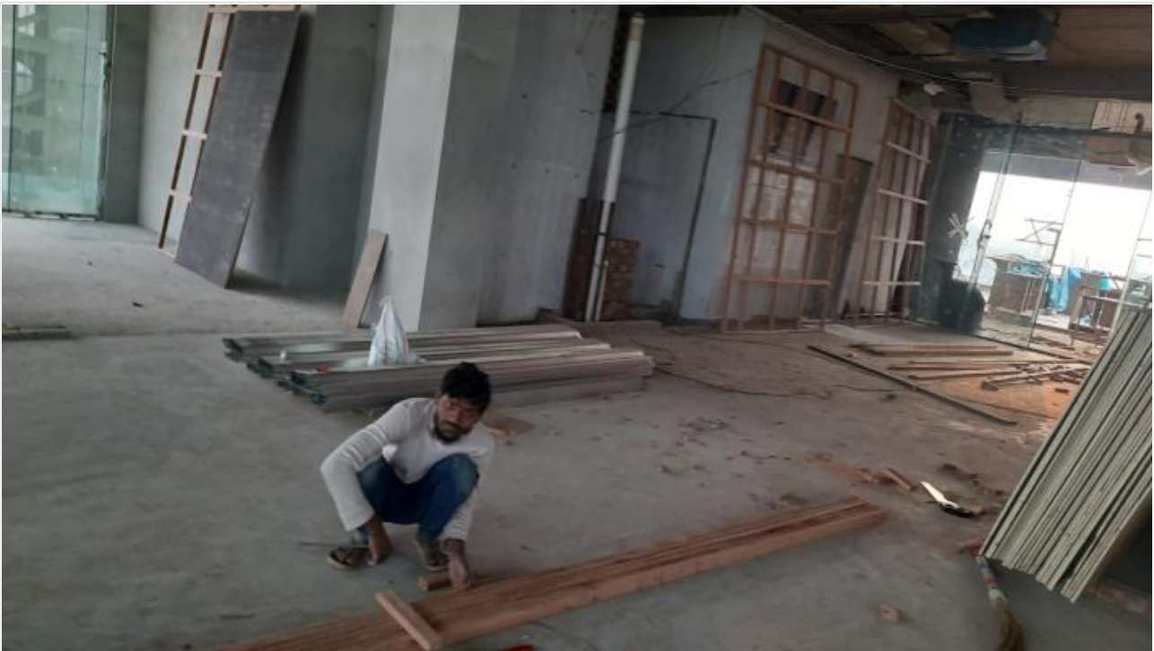
Wall Paneling on 08-02-23