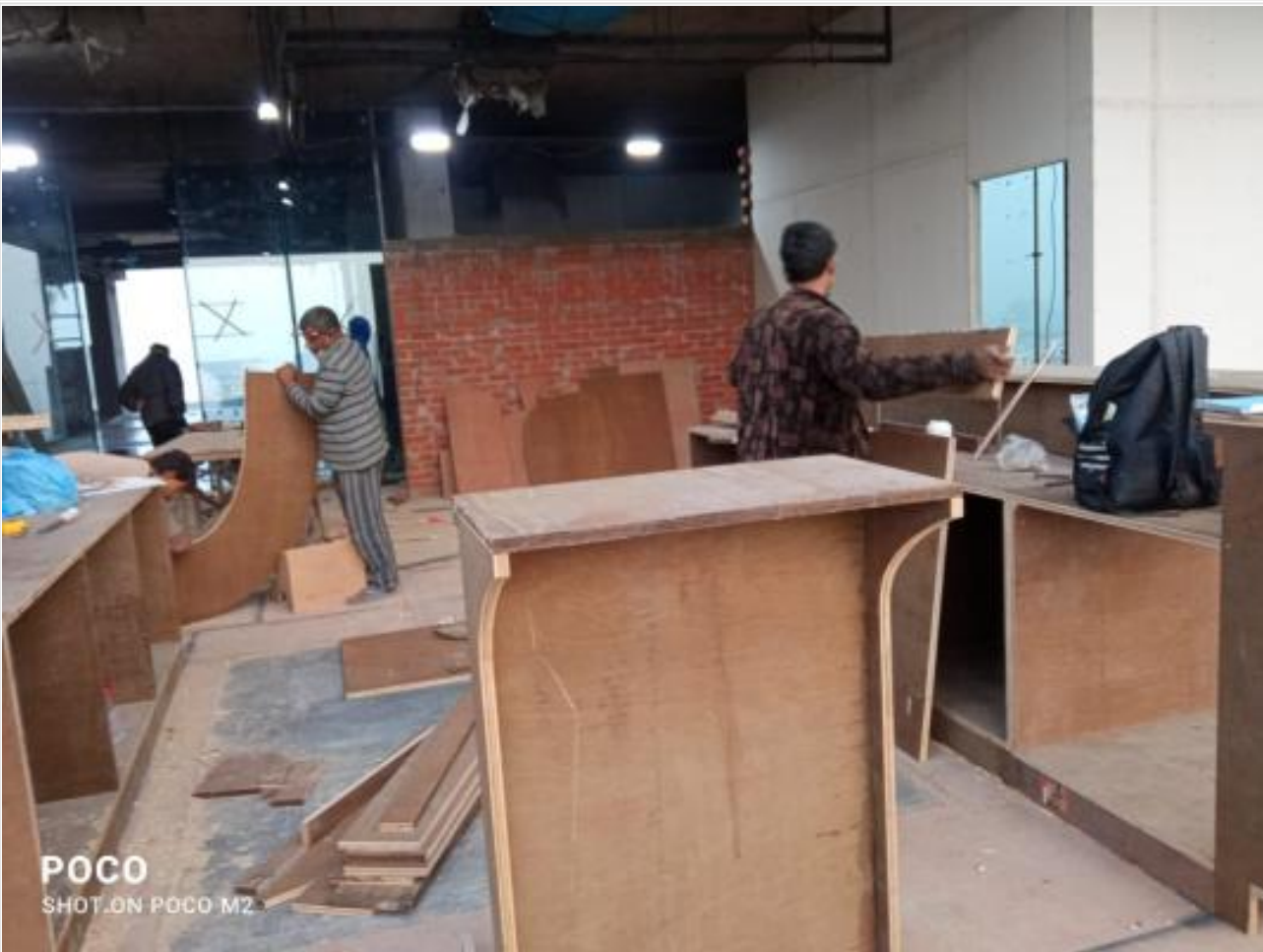
Interior works on 03-01-23