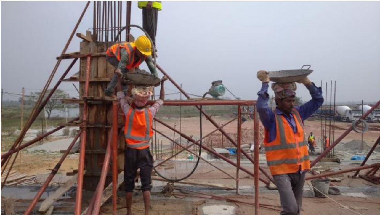
Column Concreting on 03-05-21