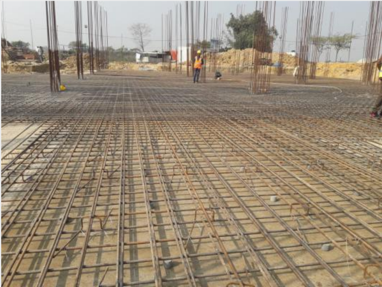
Mat Re-bar Work on 29-12-20