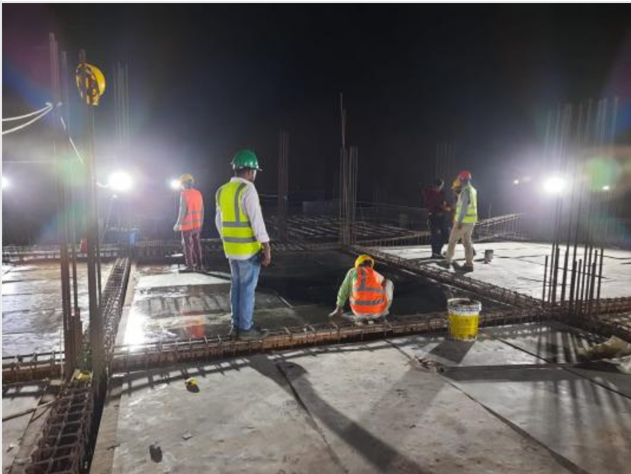
GF Slab Shuttering at Night Shift on 10-03-21