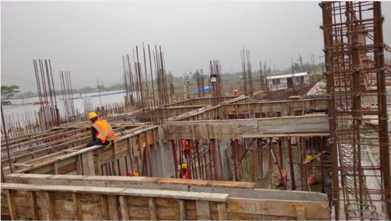
Ground Floor Slab Shuttering on 10-04-21