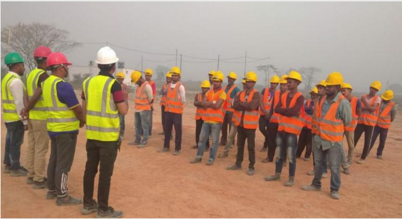
Toolbox Meeting on 25-02-21