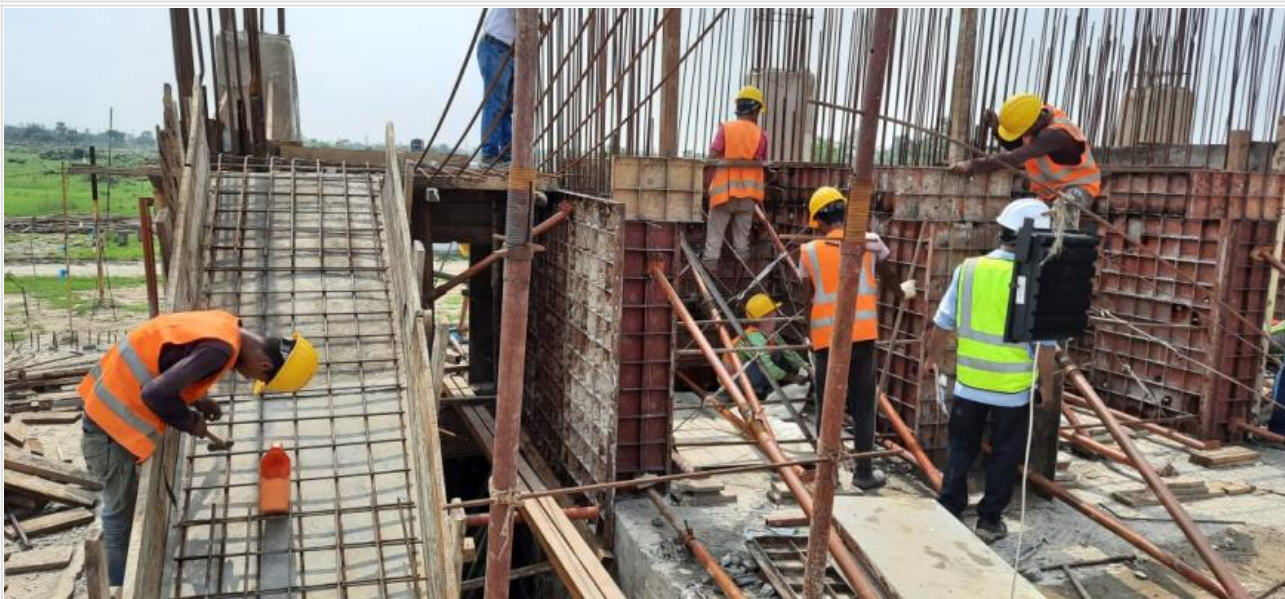
Ground Floor Stair Re-bar work on 09-06-21