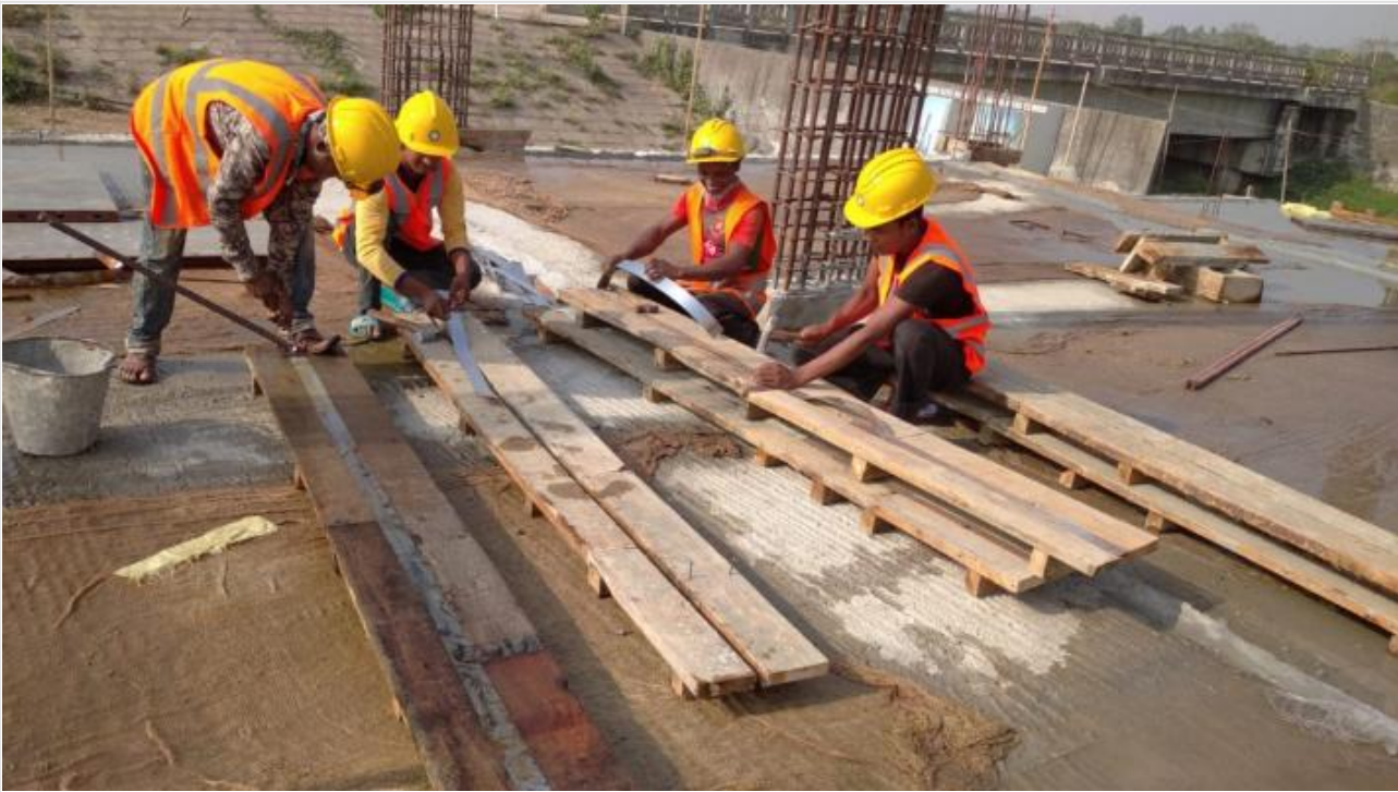
Beam Shutter Making on 01-04-21