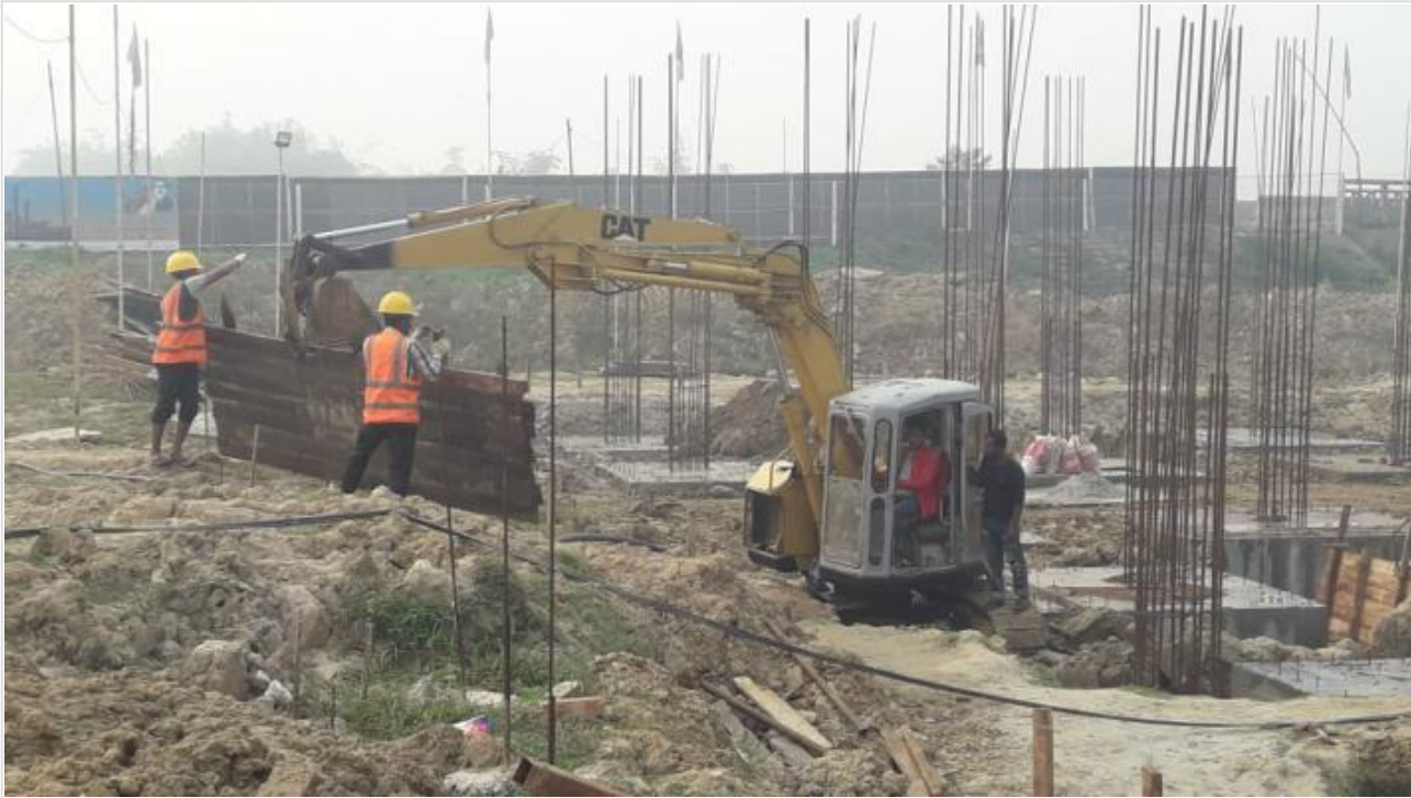
Pile Cap Re-bar Shuttering Work on 05-12-20