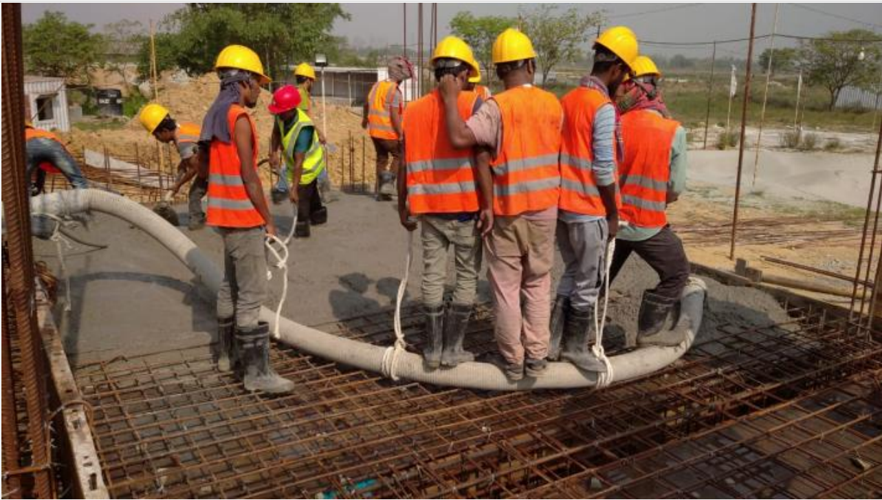
Ground Floor Slab Concreting on 25-04-21