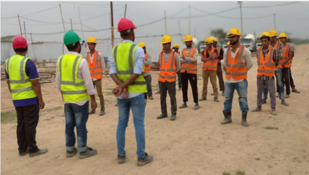
Toolbox Meeting on 28-04-21