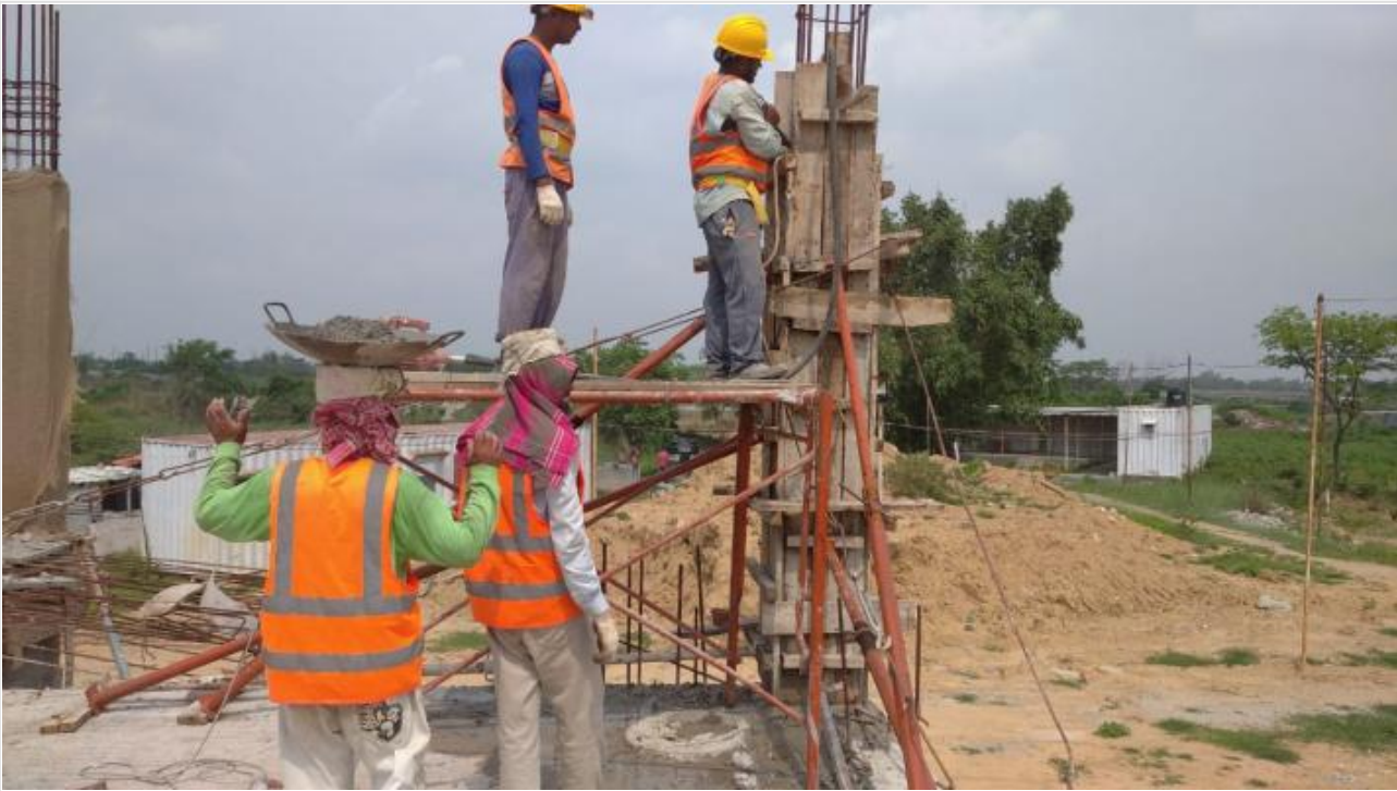
Ground Floor-Column Concreting on 30-05-21