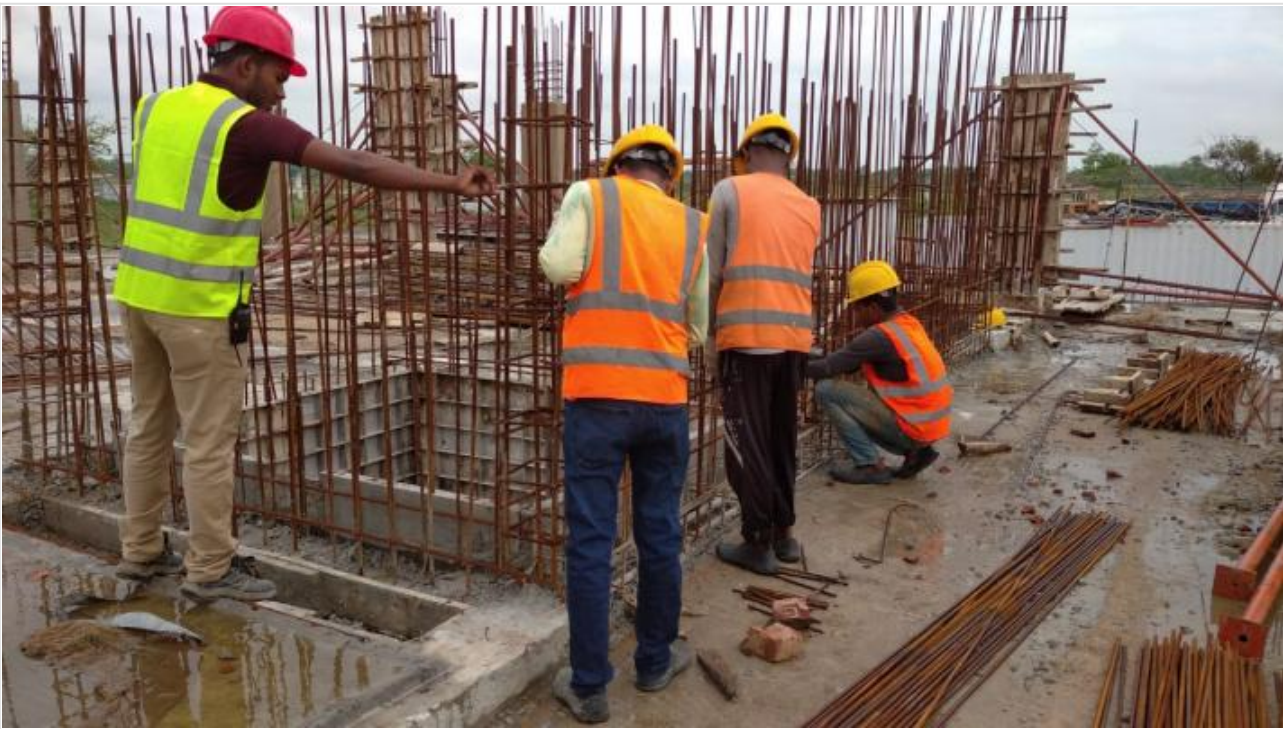
Ground Floor-Lift Core-Re-bar Work on 25-05-21