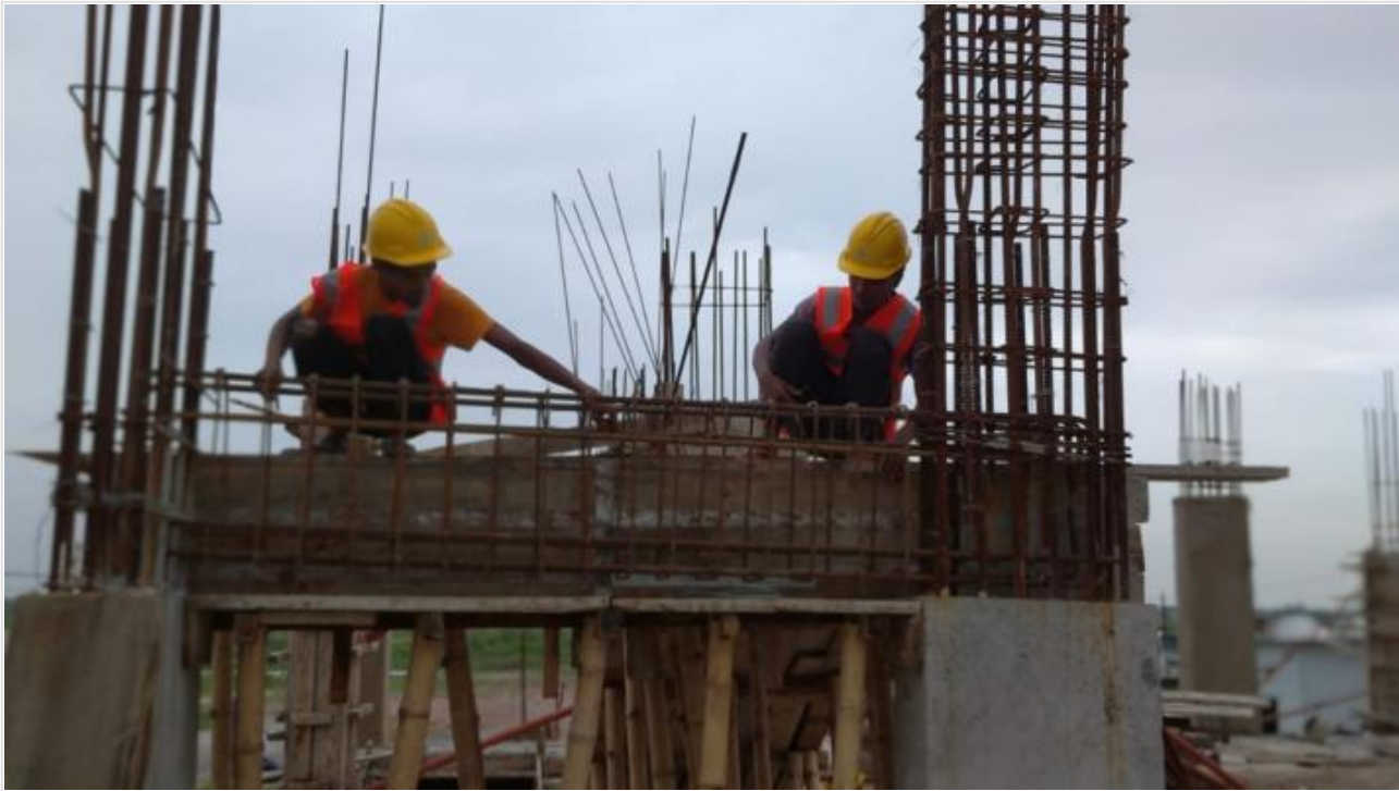
Ground Floor-Roof Beam Shuttering on 26-05-21