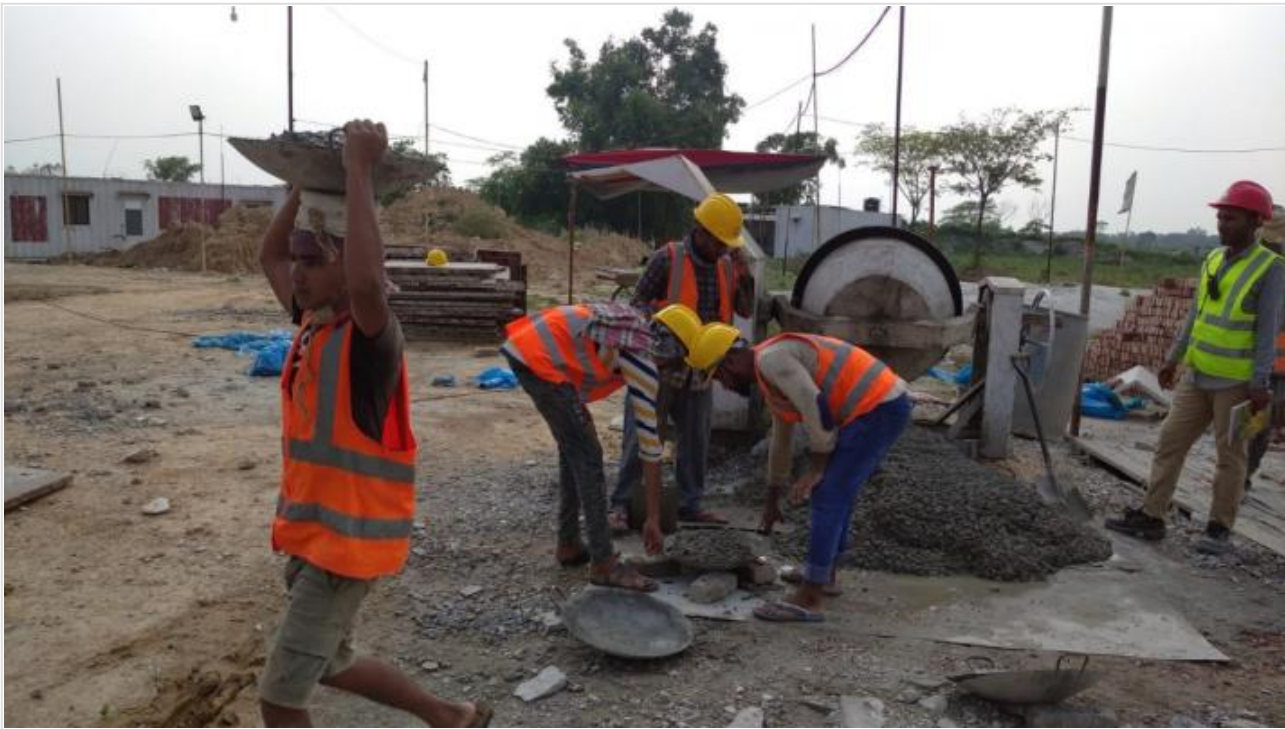
Ground Floor-Column Concreting on 23-05-21