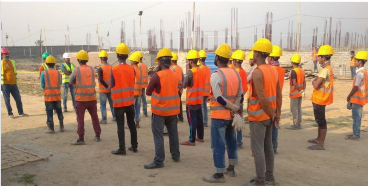
Tool Box Meeting on 04-03-21