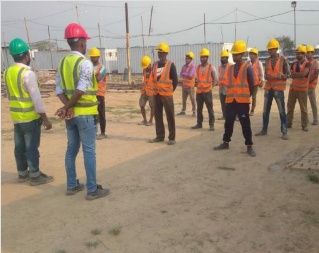
Tool Box Meeting on 12-05-21