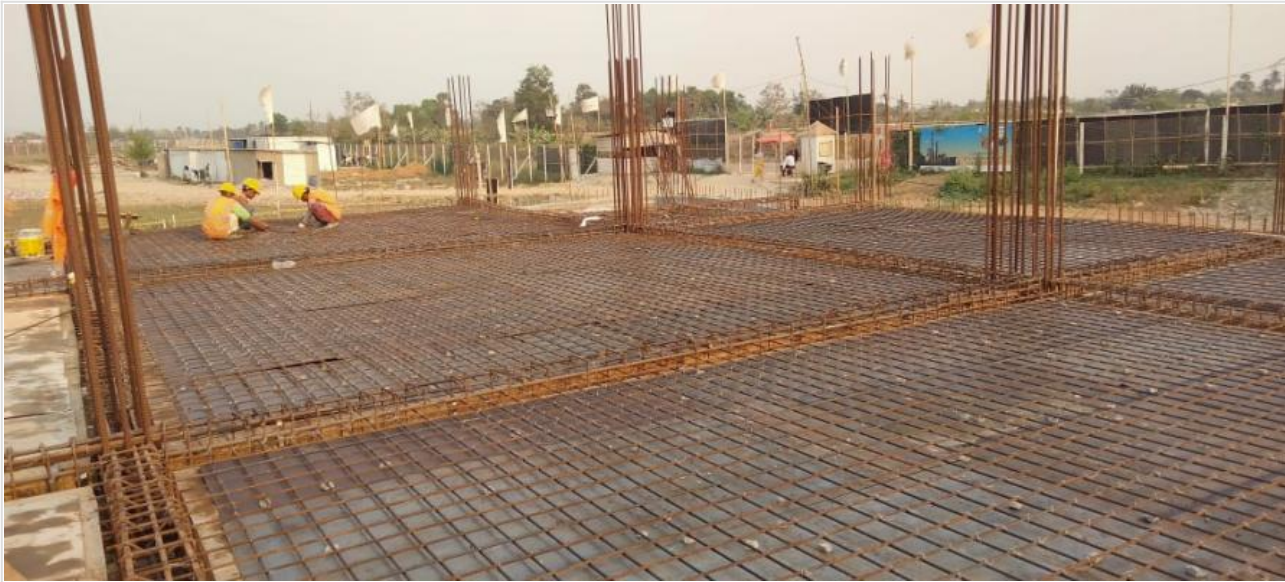
Ground Floor Slab Re-bar Work on 10-03-21