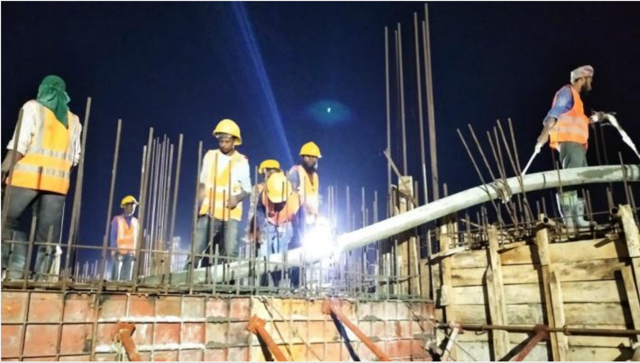
Water Reservoir Wall Concreting on 05-04-21