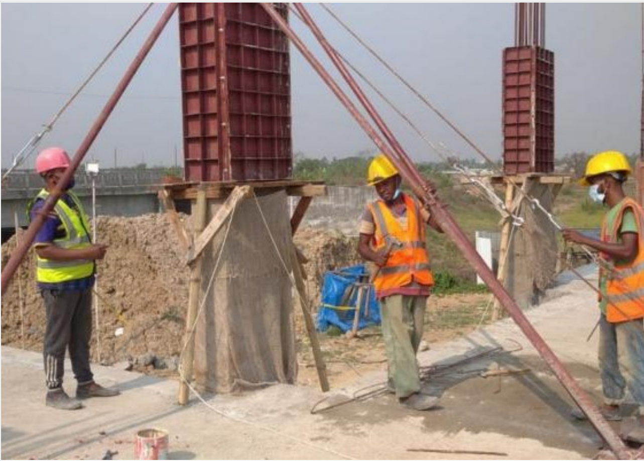
Column Shuttering on 09-05-21