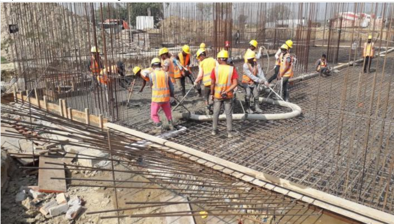
Mat Concreting on 05-01-21