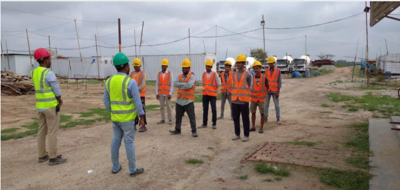
Tool Box Meeting on 20-05-21