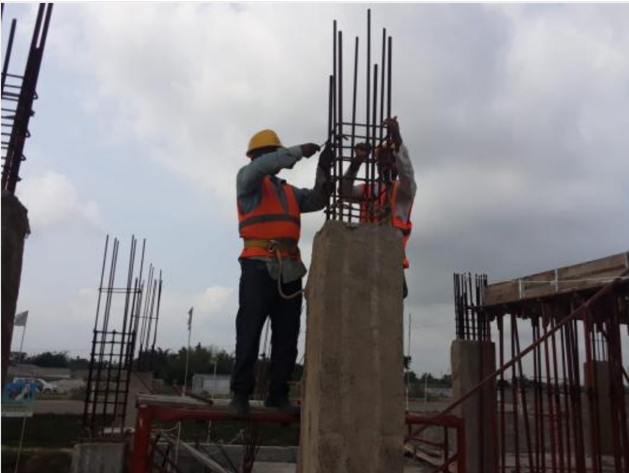
Ground Floor Re-bar Work on 20-05-21

Project closed 13-19 May due to Eid-ul Fitre Vacation