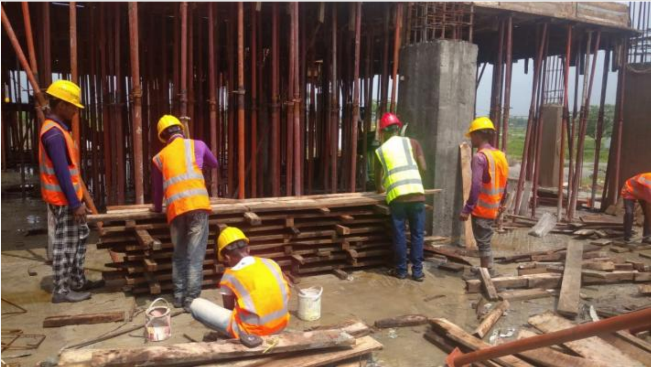
1st floor Slab Shuttering on 15-06-21