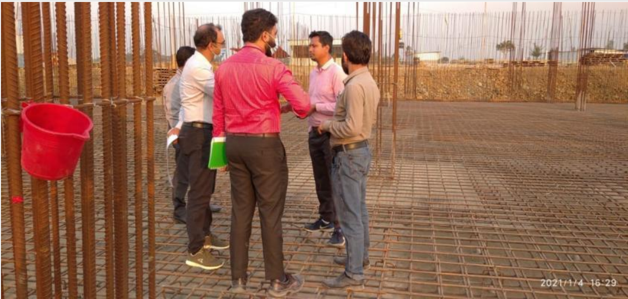
Inspection before Mat Concreting on 05-01-21