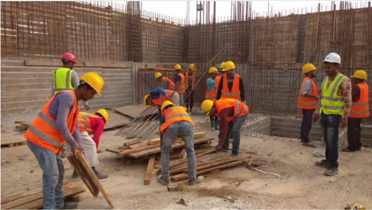
Retaining Wall Shuttering on 18-02-21