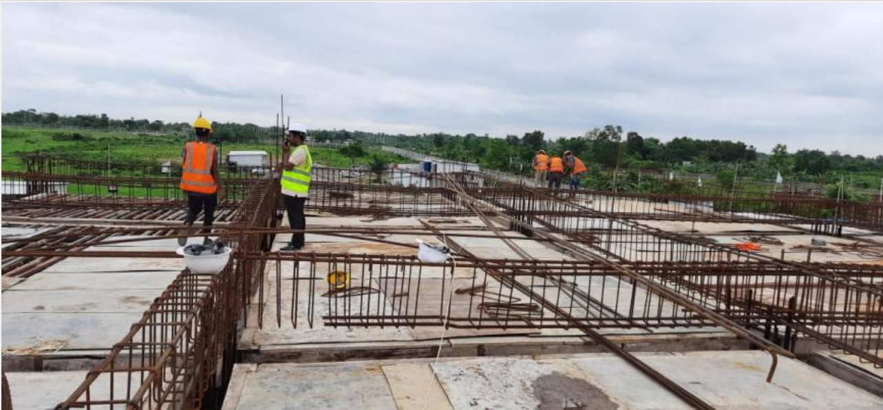
1st floor Slab Shuttering on 12-06-21