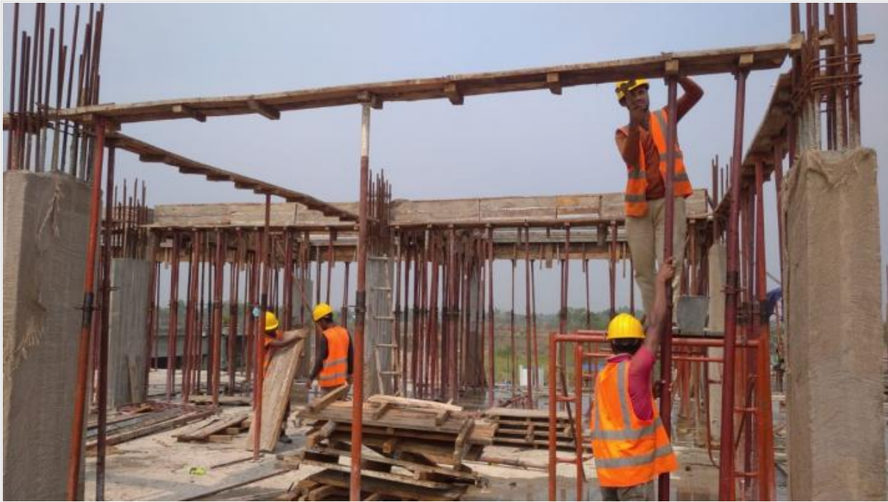
Beam Shuttering on 03-05-21