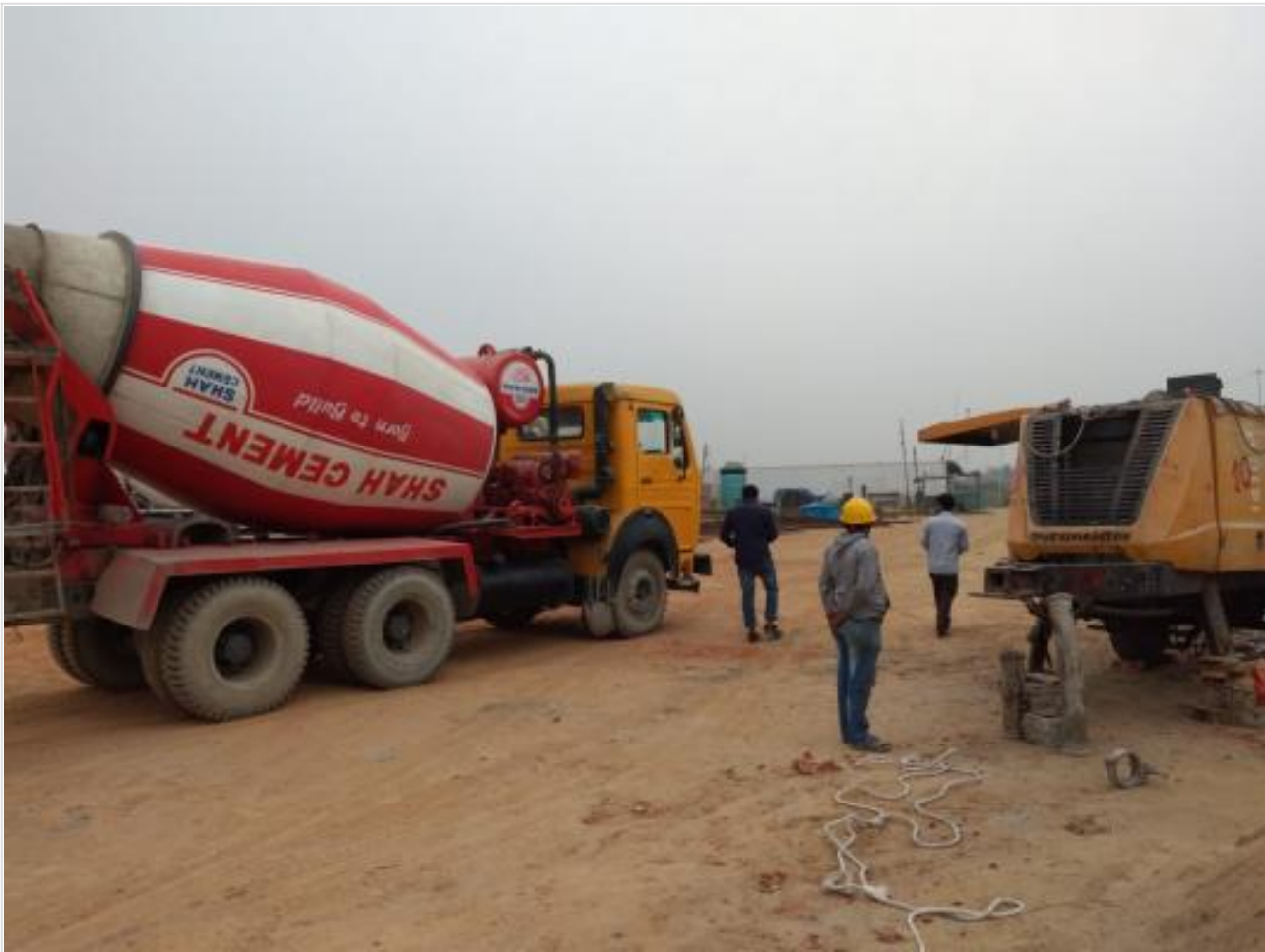
Retaining Wall Concreting on 20-02-21