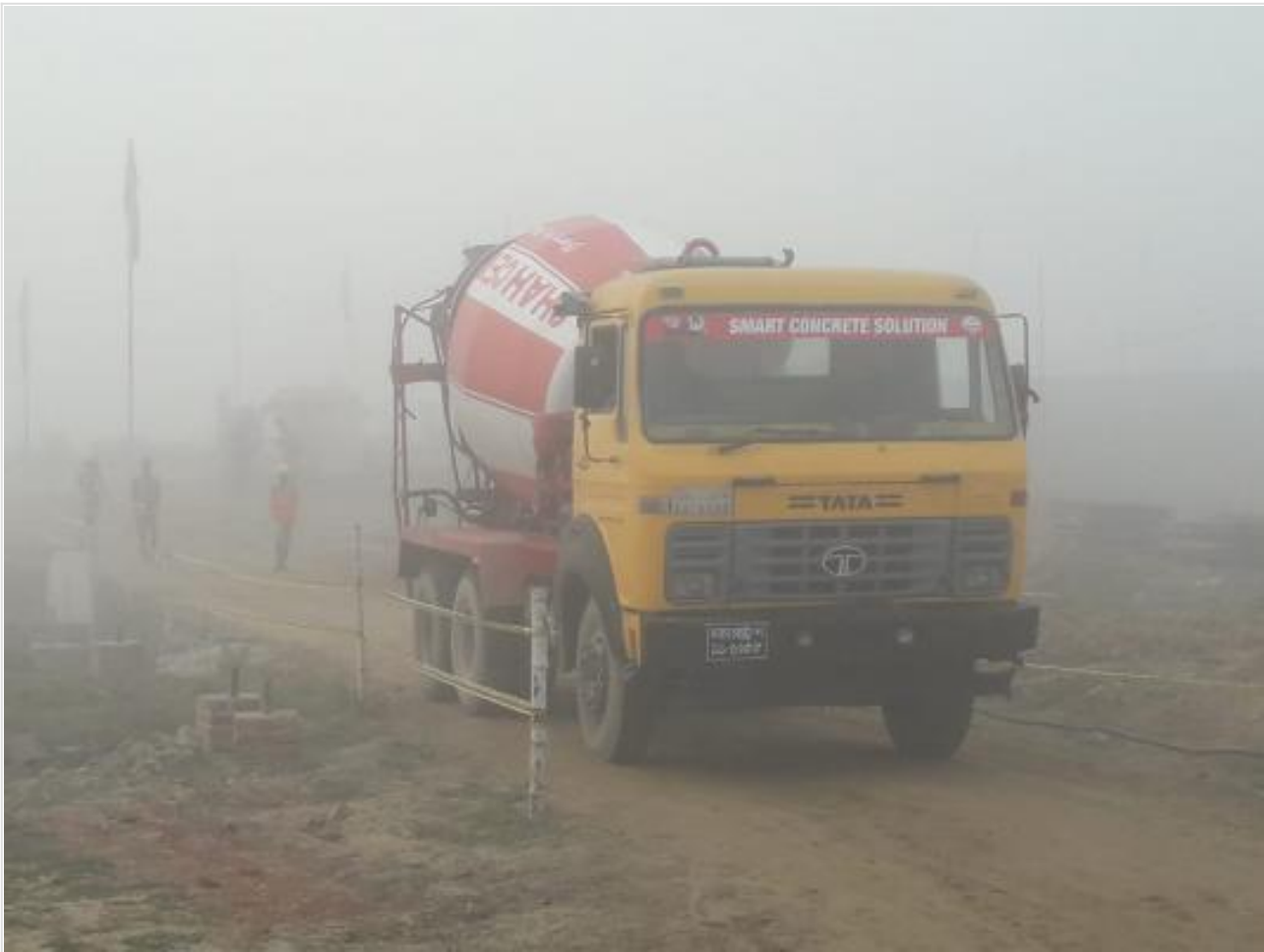
Pile Cap Concreting on 06-12-20