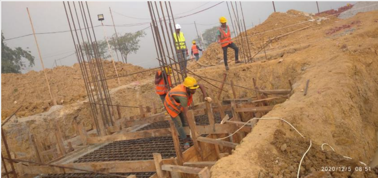
Pile Cap Re-bar Shuttering Work on 05-12-20