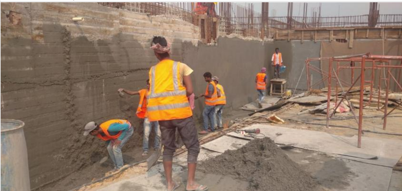
Basement West Wall Plastering on 07-03-21