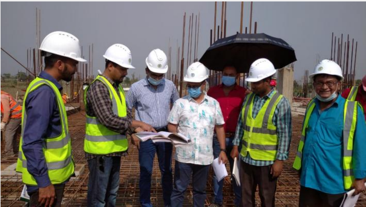
Inspection before GF Slab Concreting on 25-04-21