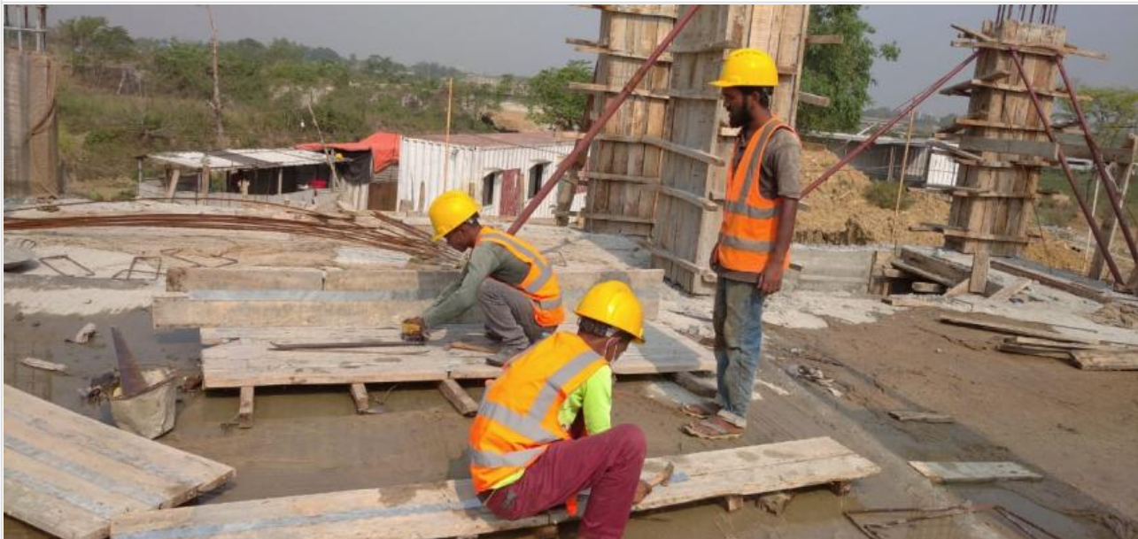
Ground Floor-Column Shuttering Work on 12-05-21