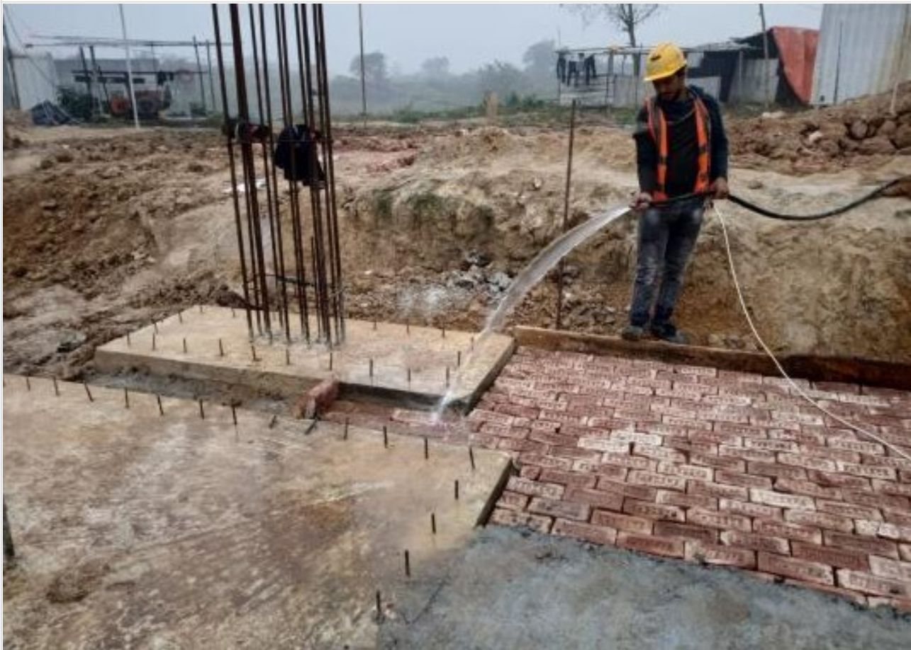
Footing Curing on 15-12-20