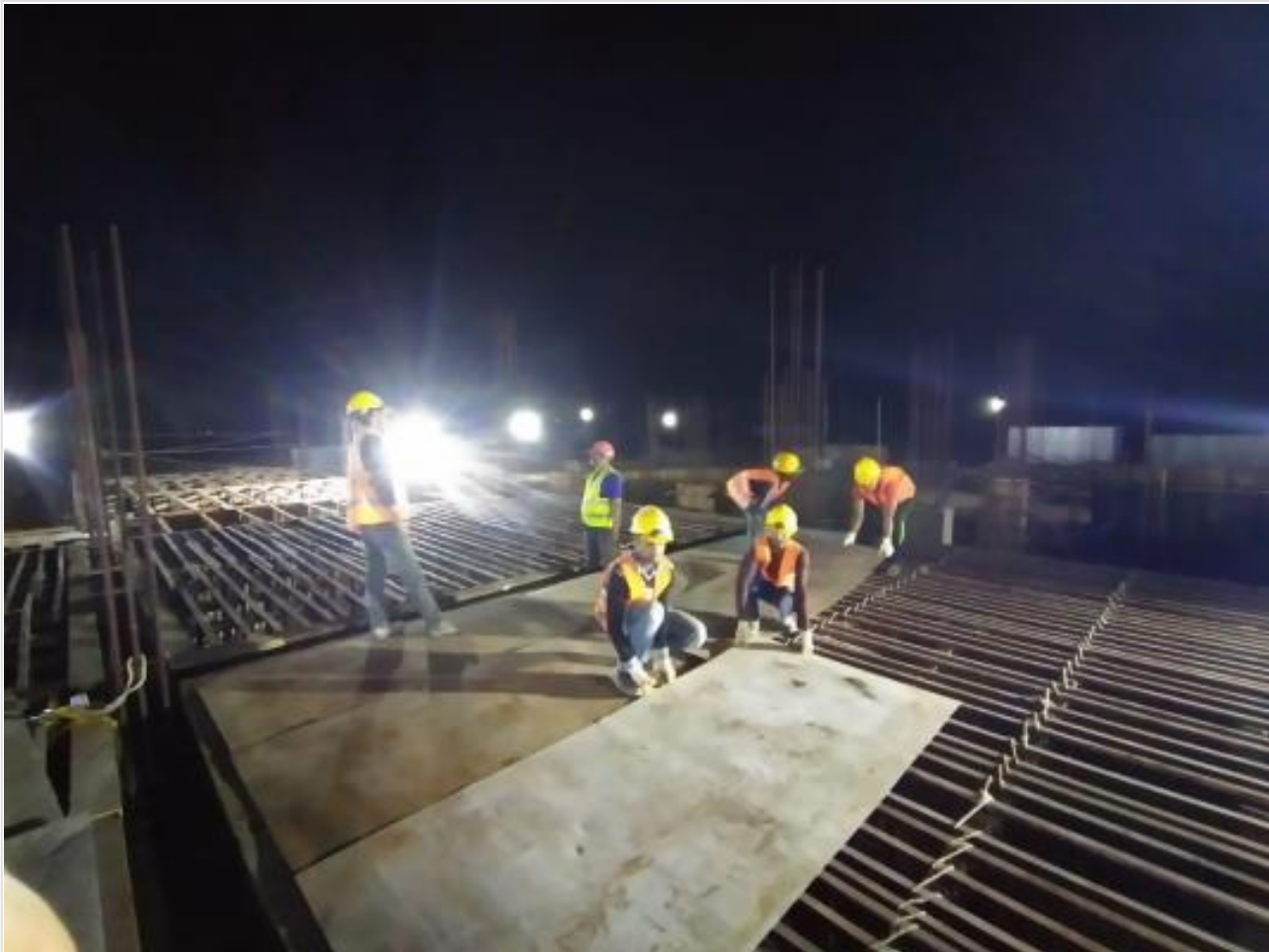
Night Shift Working on 04-03-21