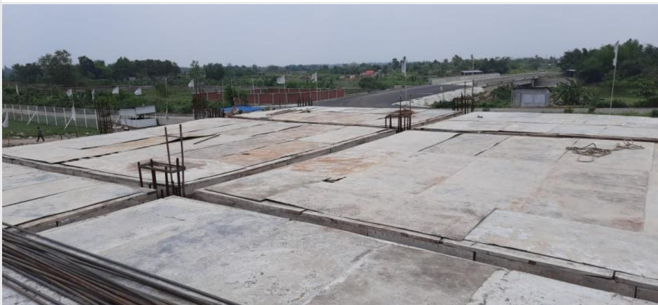
1st floor Slab Shuttering on 09-06-21