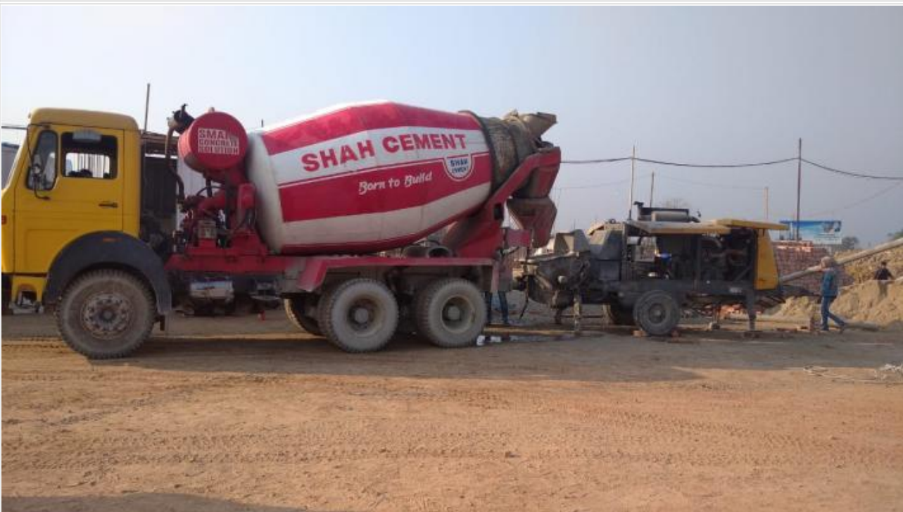
South Retaining wall 2nd Lift Concretin on 09-02-21