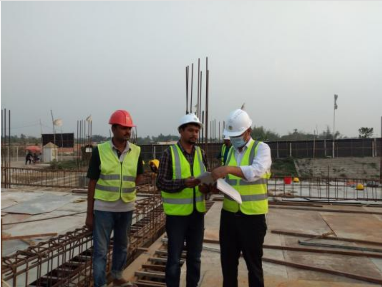
GF Slab Re-bar Inspection on 07-03-21