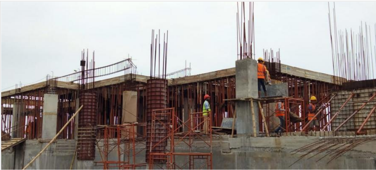
Ground Floor Construction on 07-06-21