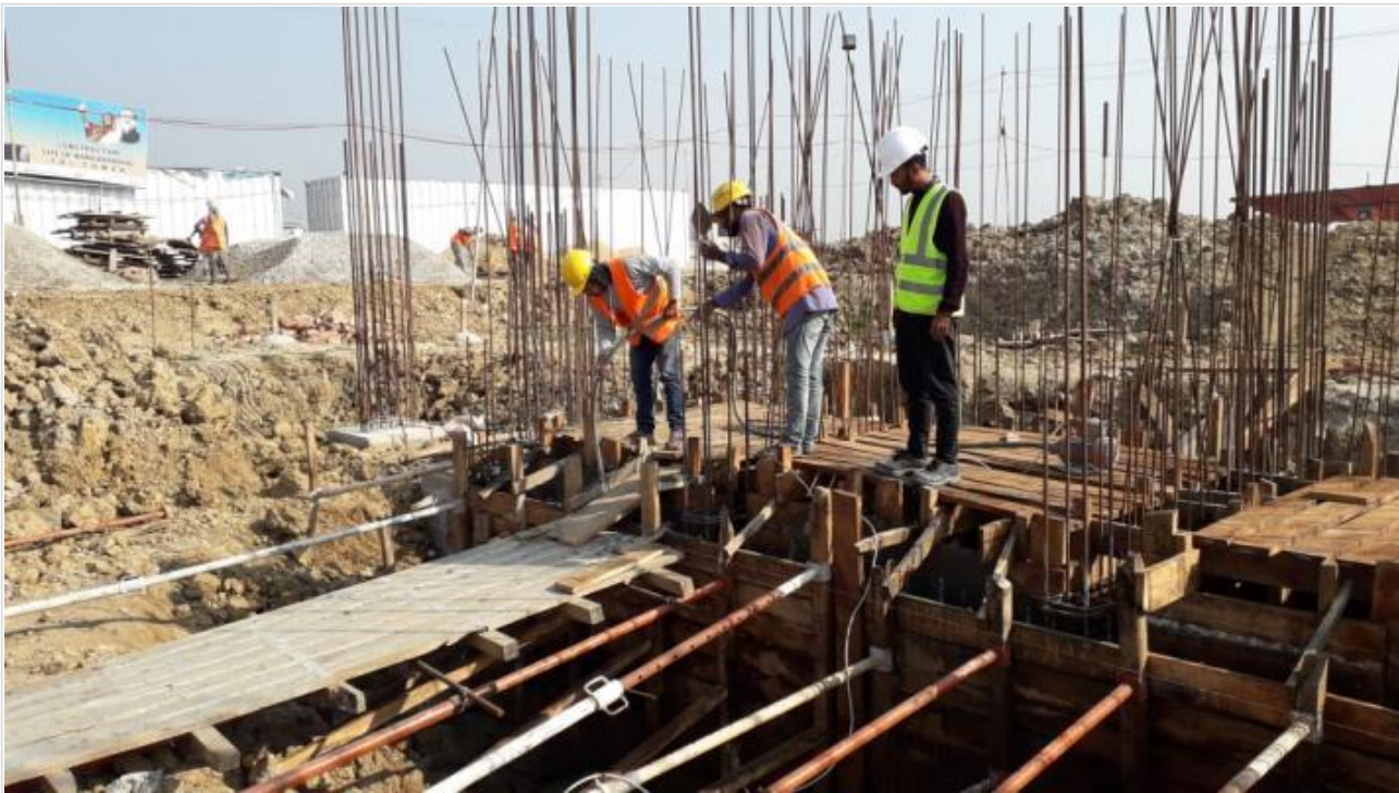
Lift Core Concreting on 19-12-20