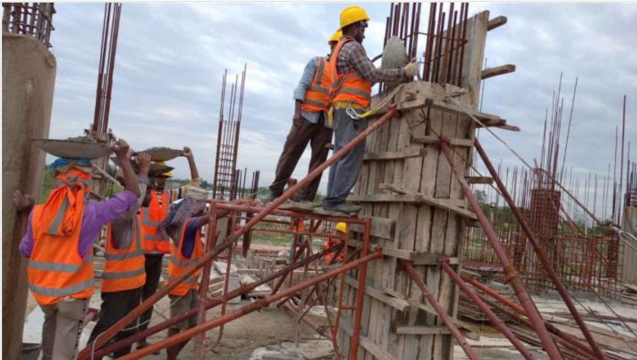
Ground Floor-Column Concreting on 25-05-21