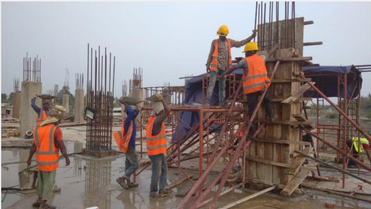
Column Re-bar Work on 04-05-21