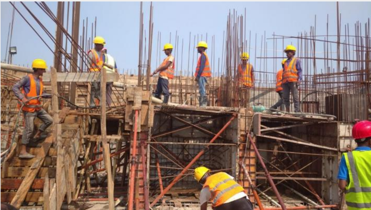
Lift Core Wall Concreting on 05-04-21