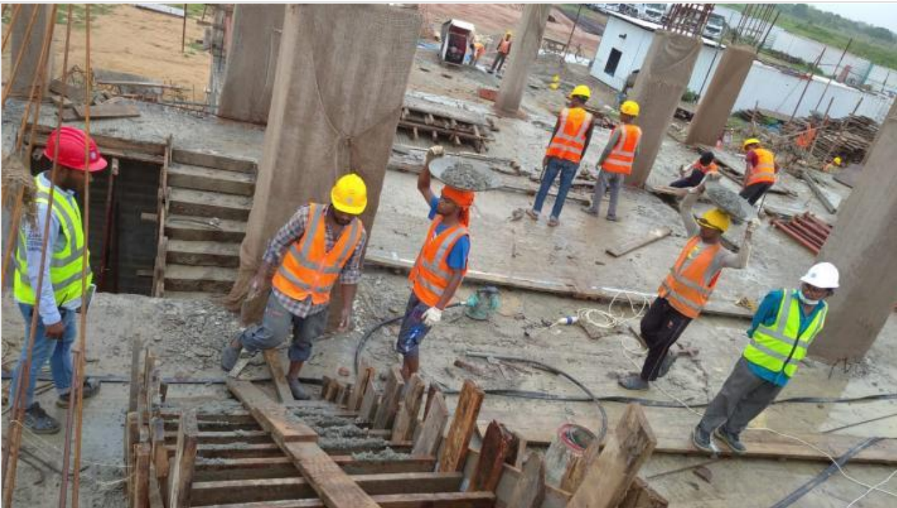
Ground Floor Stair Concreting on 31-05-21