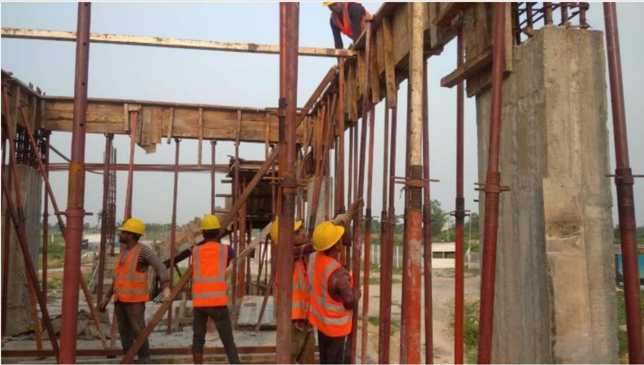
Ground Floor Roof Slab Shuttering on 31-05-21