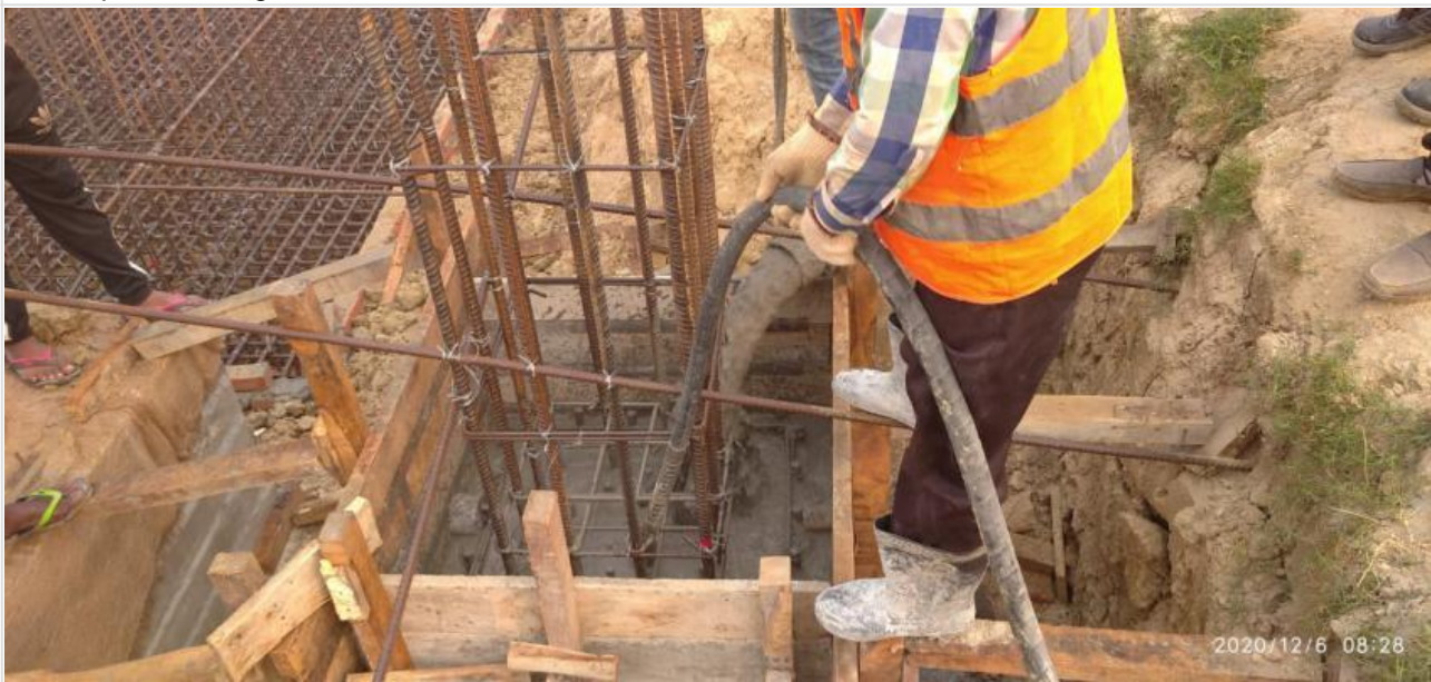
Pile Cap Concreting on 06-12-20