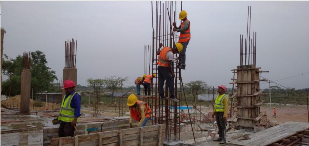
Column Re-bar Work on 08-05-21