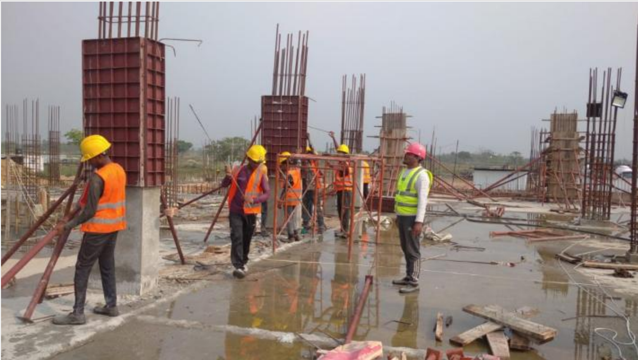
Column Shuttering on 10-04-21