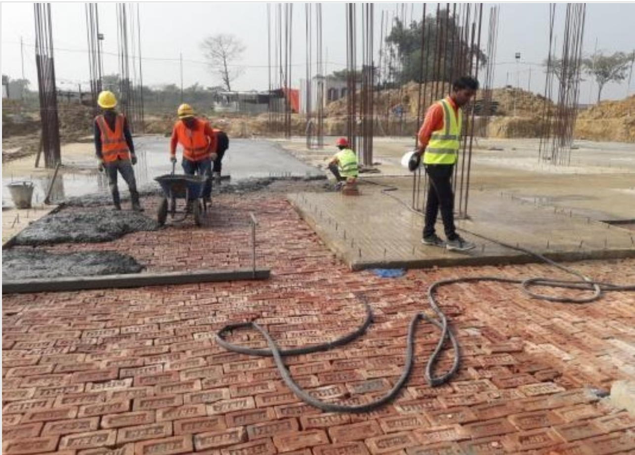
Mat CC Concreting on 15-12-20