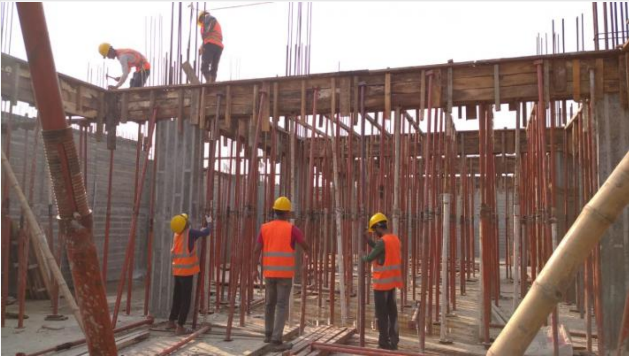
Ground Floor Slab Shuttering on 25-02-21