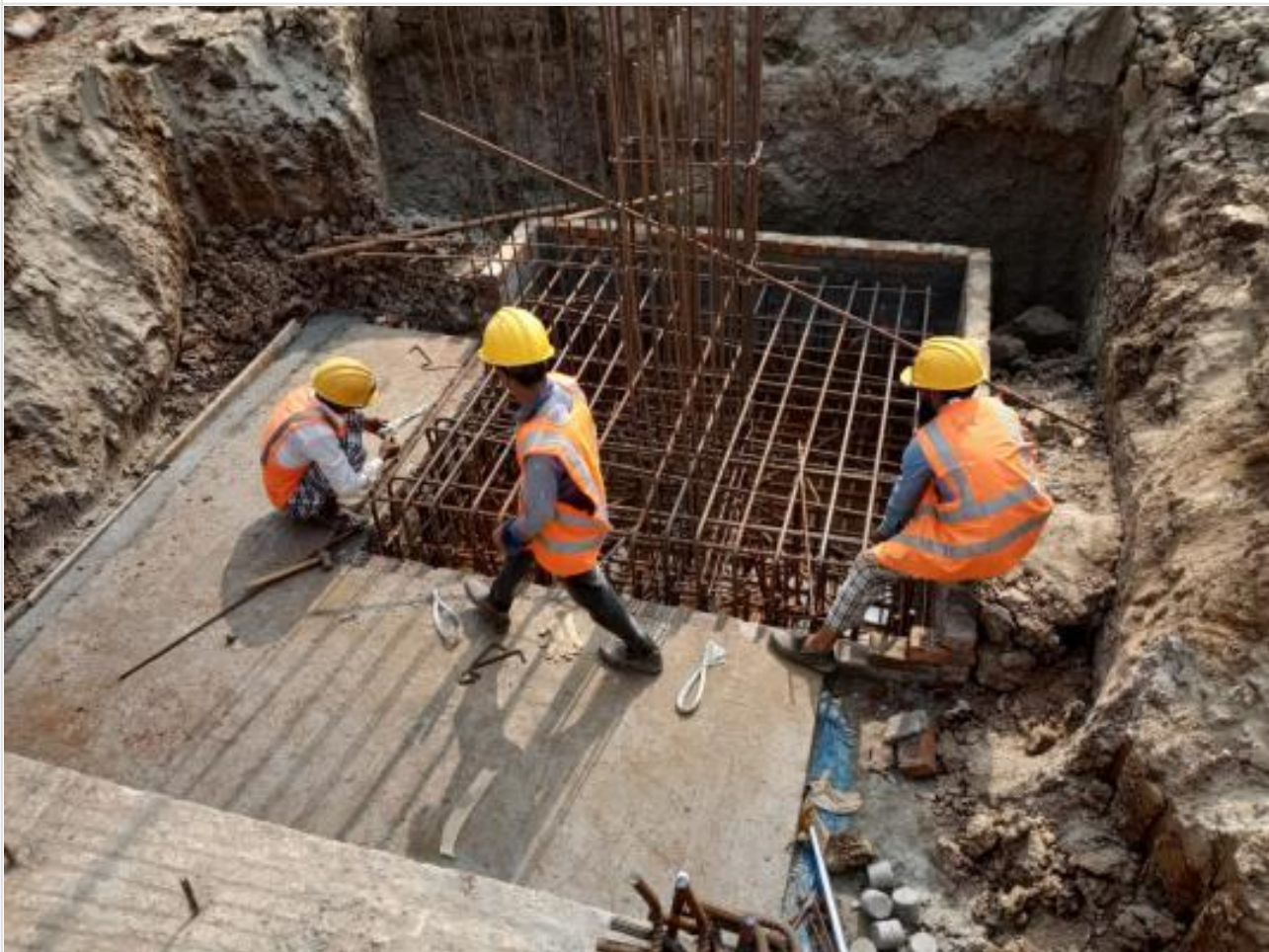
Footing Re-bar Placing on 19-12-20