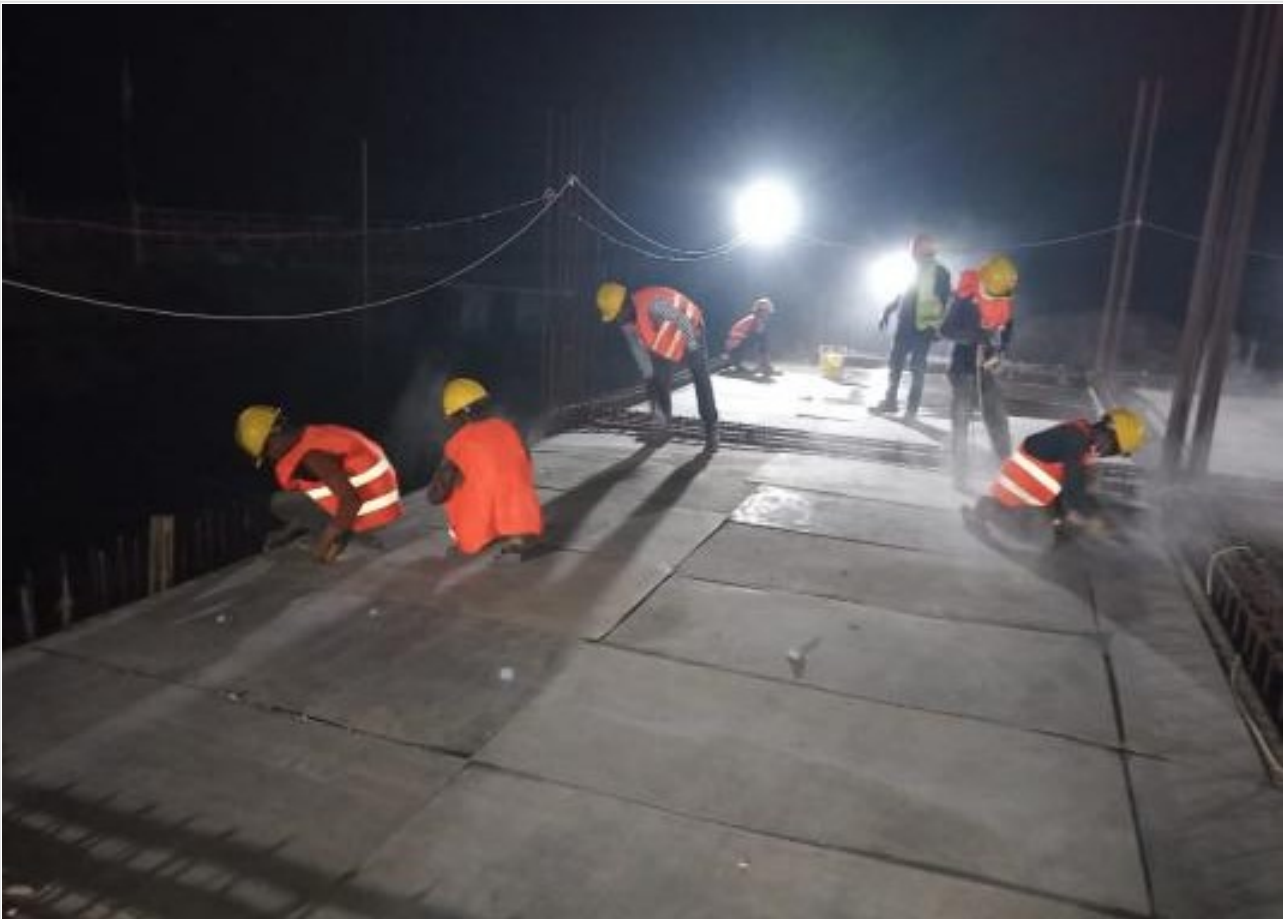
GF Slab Shuttering at Night Shift on 08-03-21