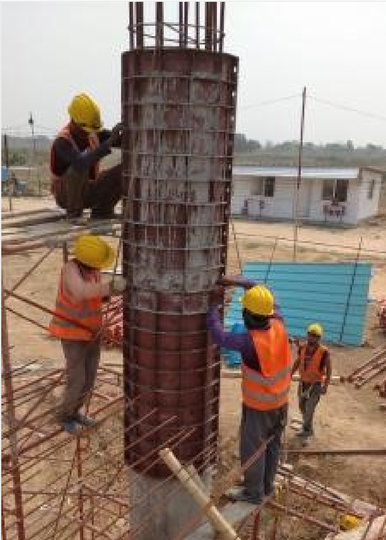
Column Shutteeing on 30-04-21