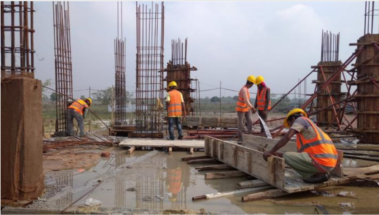
Column Shuttering Work on 04-05-21