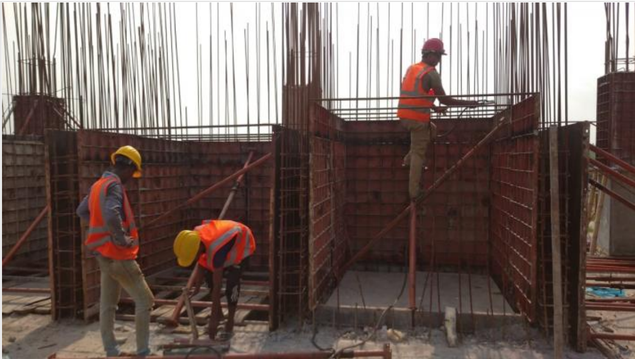
Ground Floor-Lift Wall Shuttering on 30-05-21