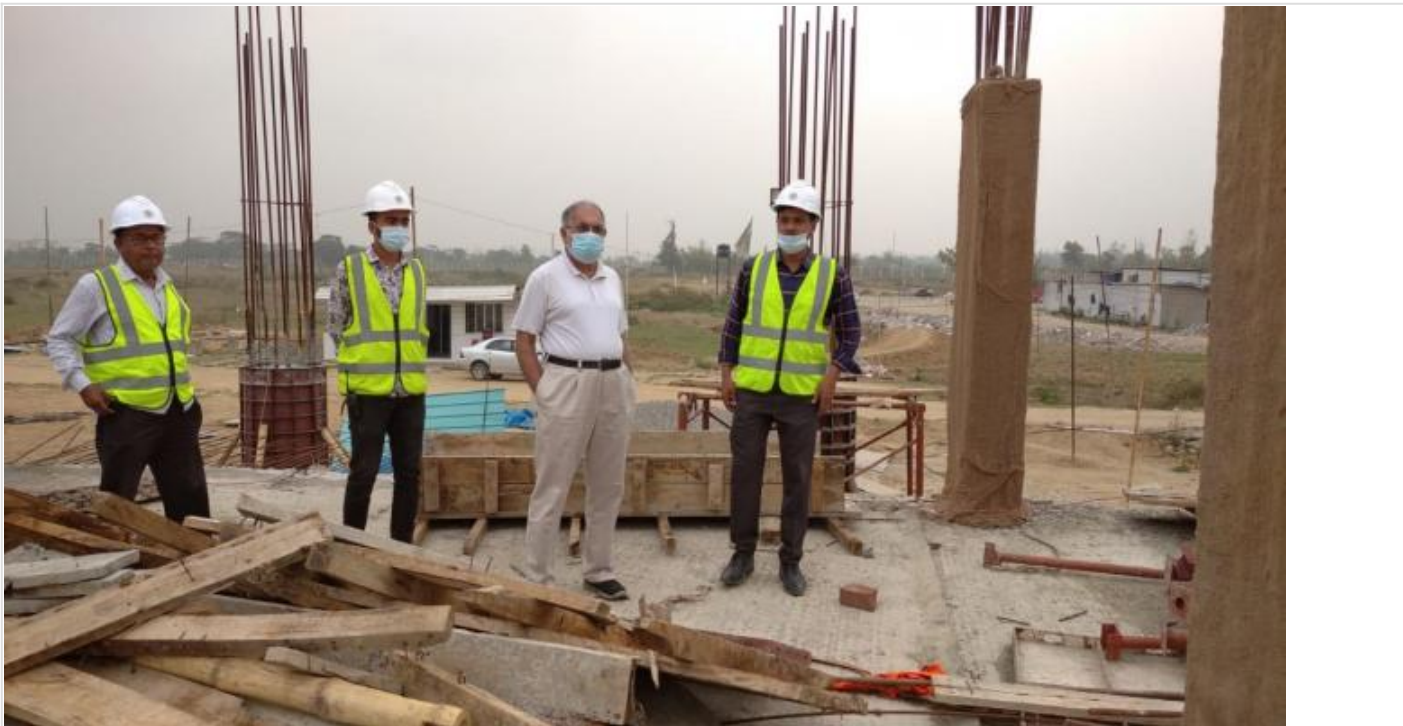
G.M. Construction Visit on 28-04-21