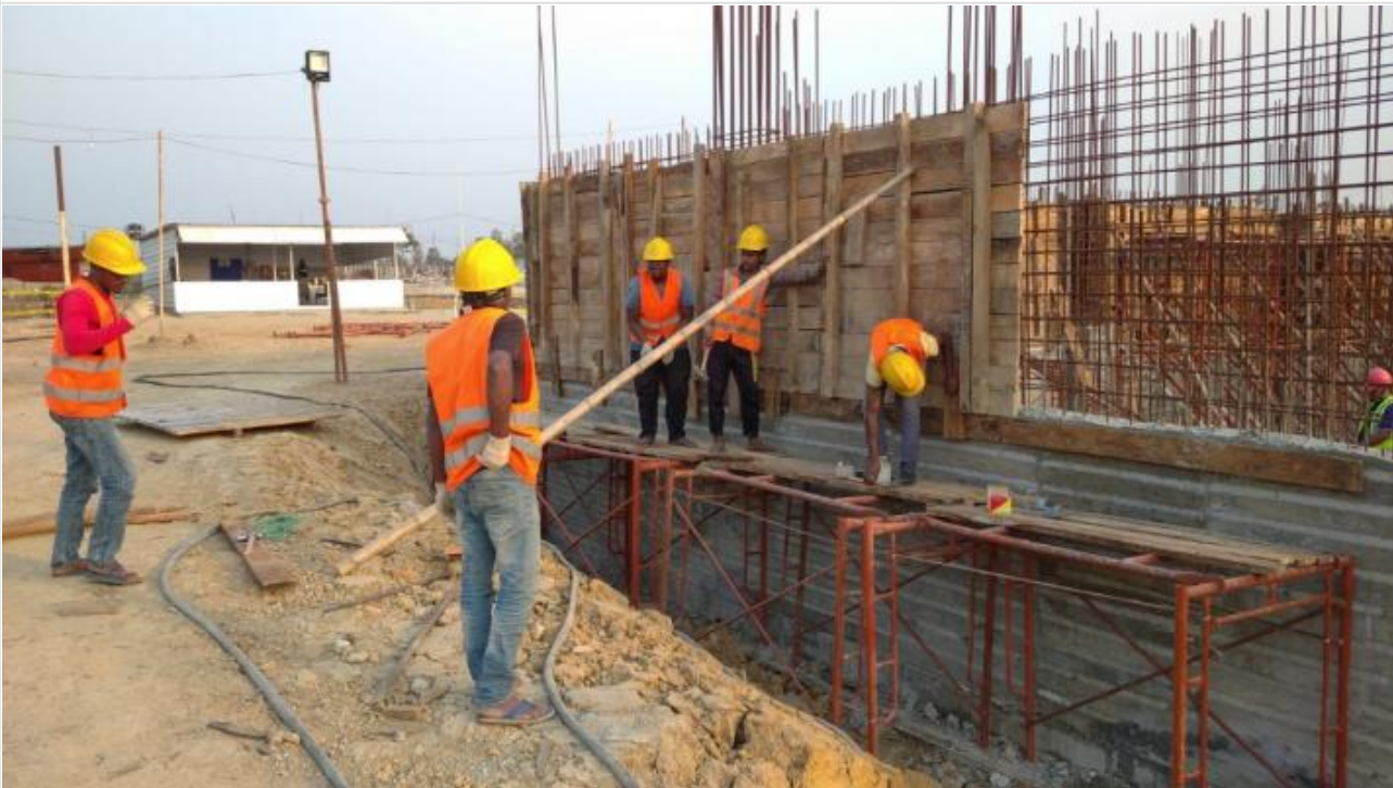
Retaining Wall Shuttering on 18-02-21