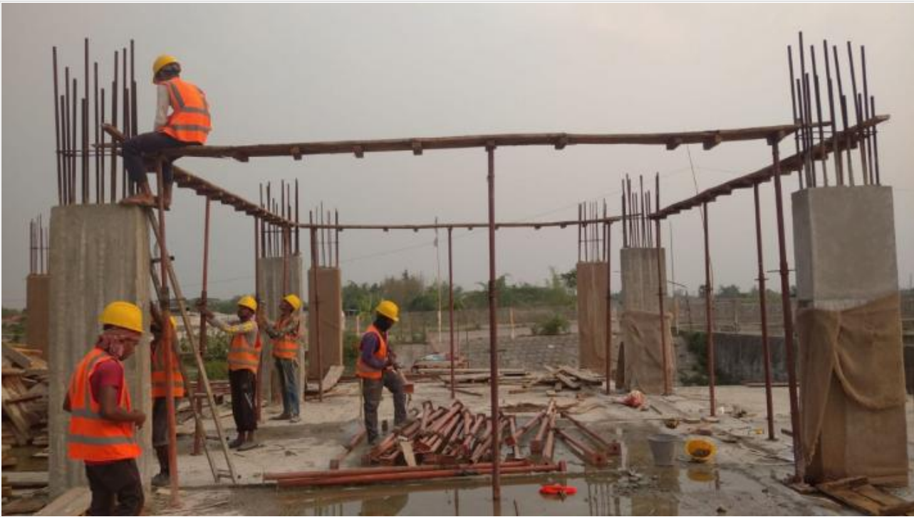
Beam Shuttering on 30-04-21