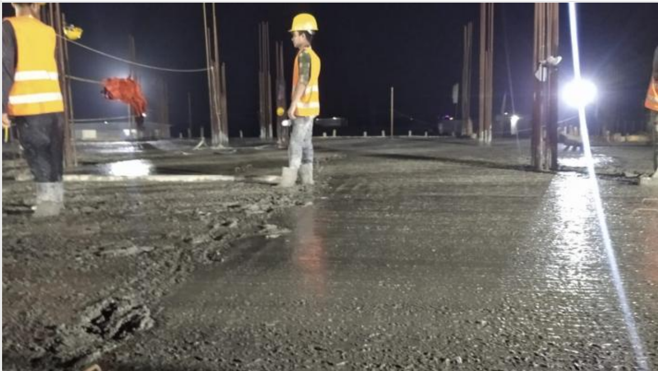
GF Slab Concreting complete at night on 15-03-21