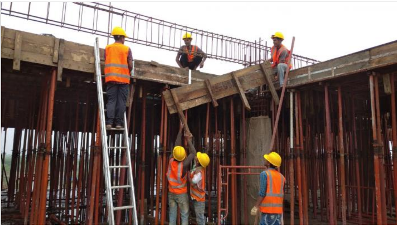
1st Floor Beam Shuttering on 06-06-21