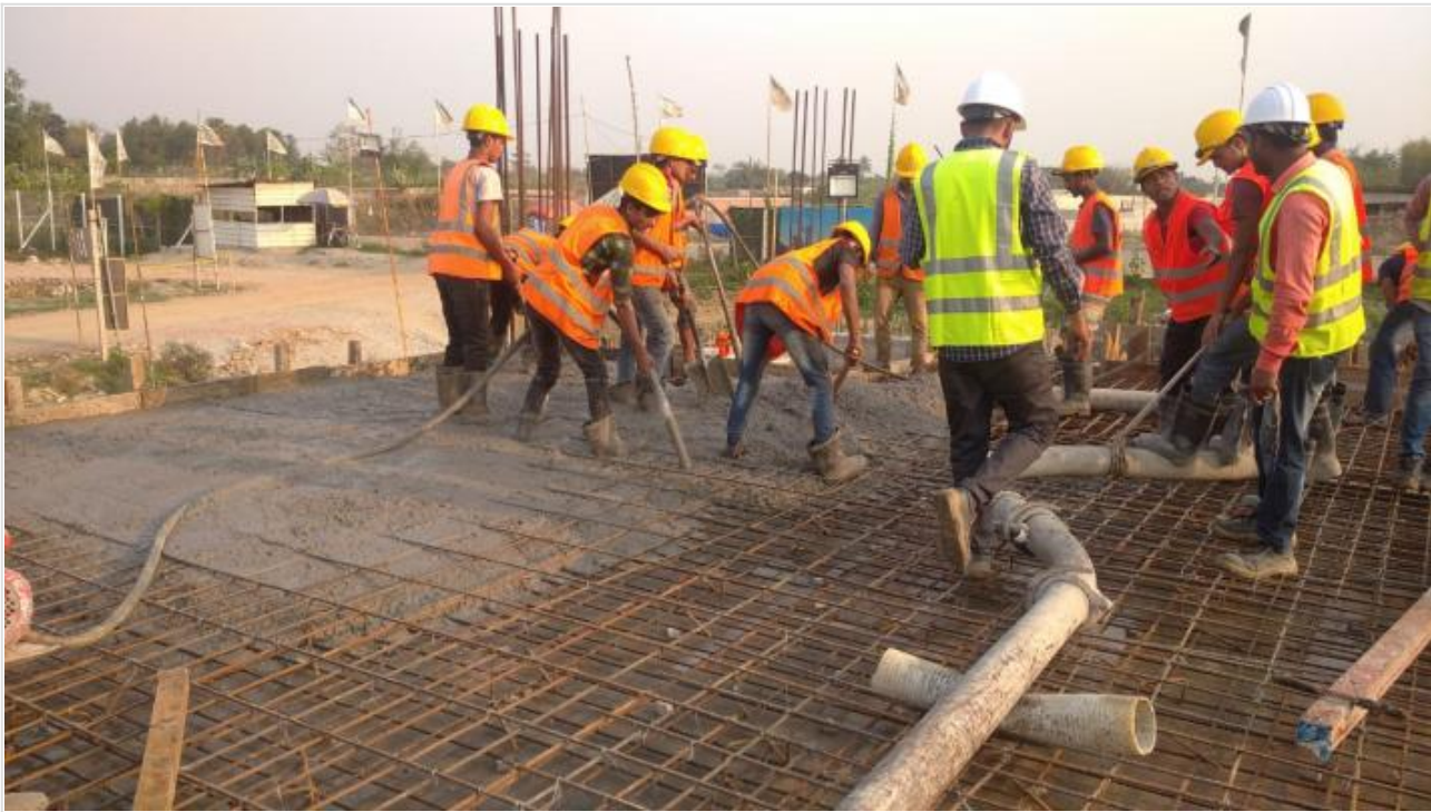
GF North-Slab 8000 sft Concreting on 15-03-21