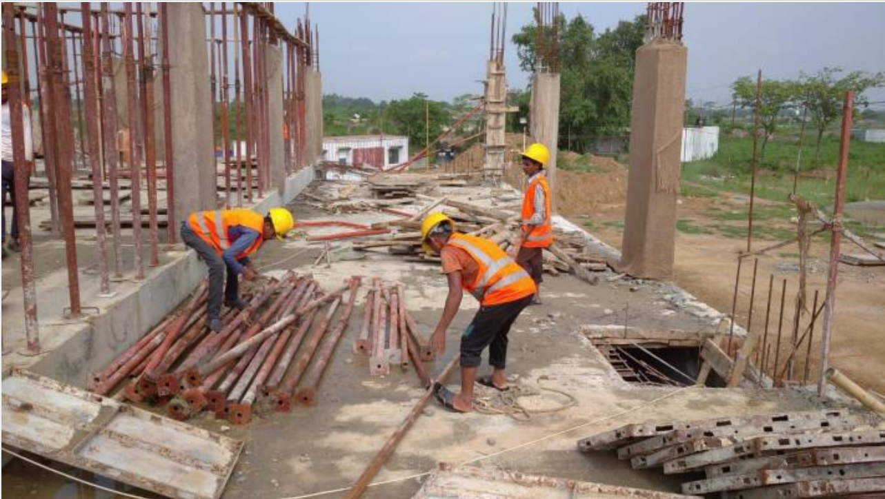
1st Floor Slab Shuttering on 03-06-21