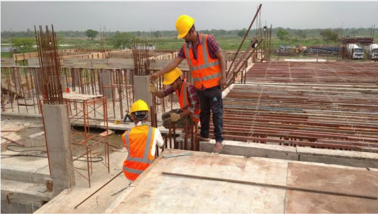
1st Floor Slab Shutter Levelling on 03-06-21