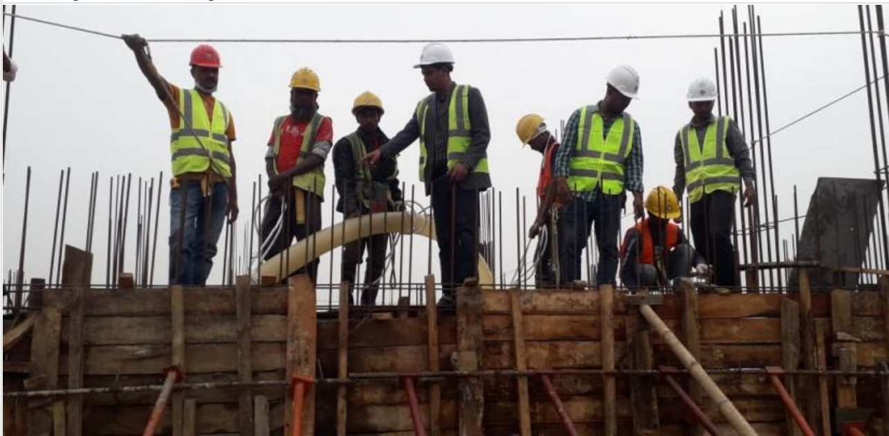
Retaining wall Concreting on 20-02-21