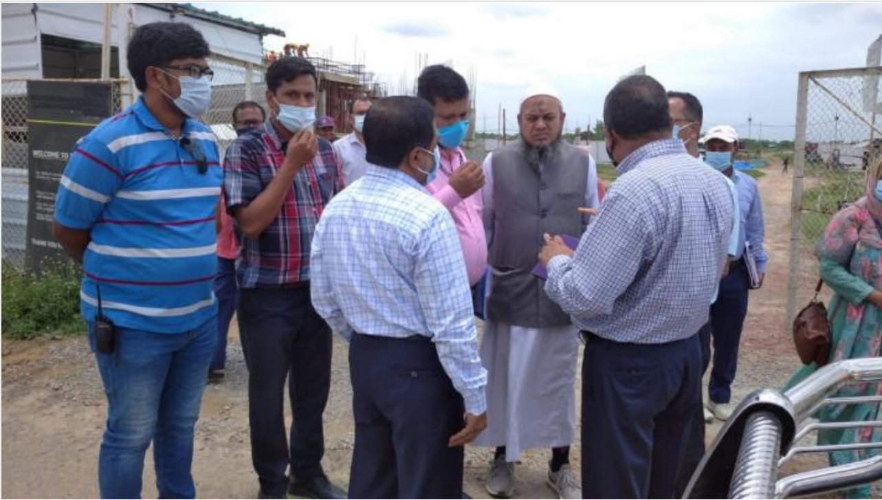
Honourable RAJUK Charman Visit on 12-06-21