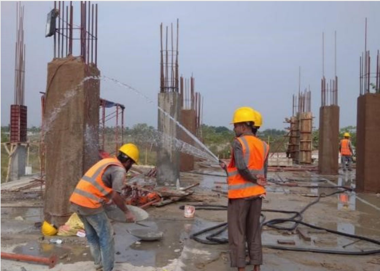
Column Curing on 09-05-21