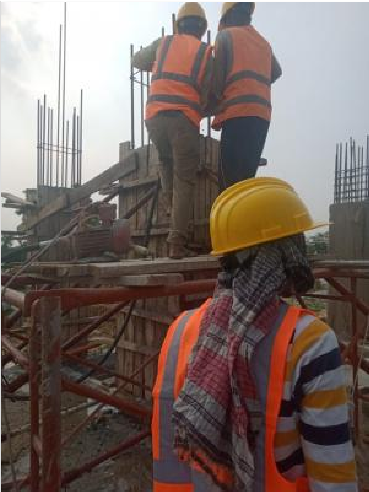
Ground Floor-Column Concreting on 23-05-21