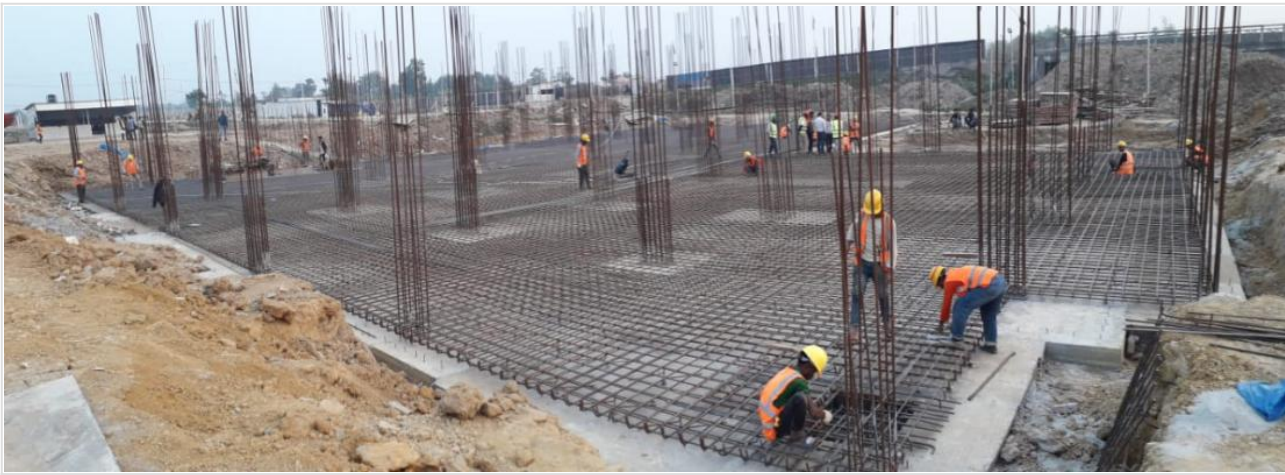
Mat Re-bar Work on 29-12-20