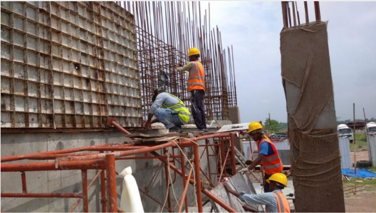
Ground Floor Lift Core Shuttering on 15-06-21