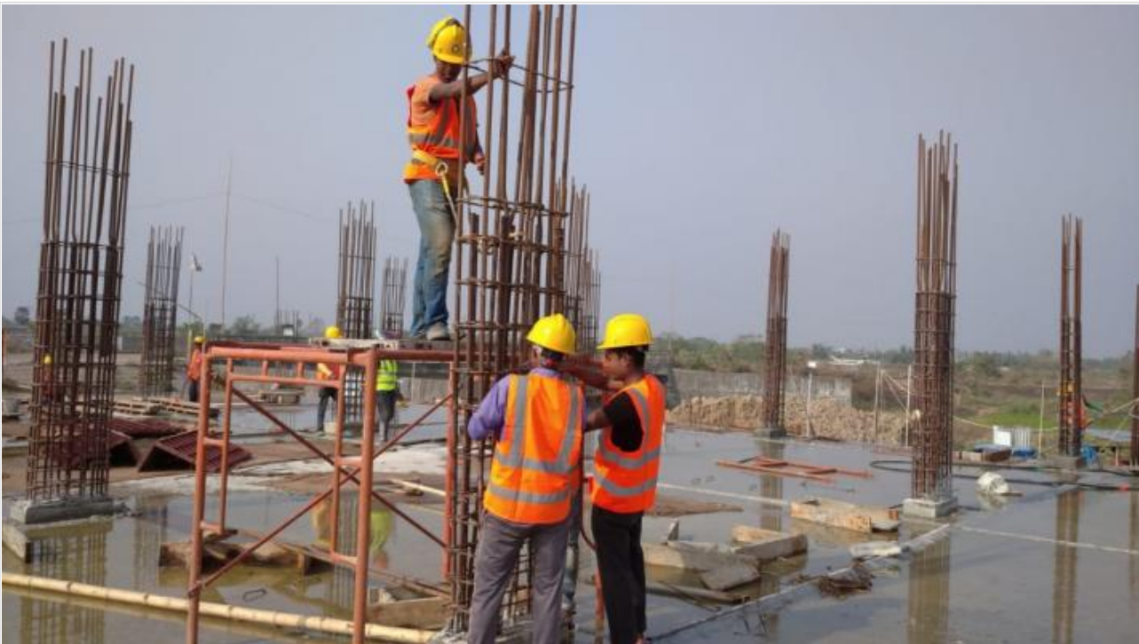
Ground Floor Column Re-bar Work on 01-04-21