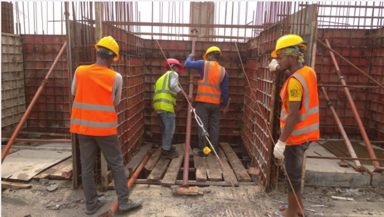
Ground floor Lift Core Shuttering on 07-06-21