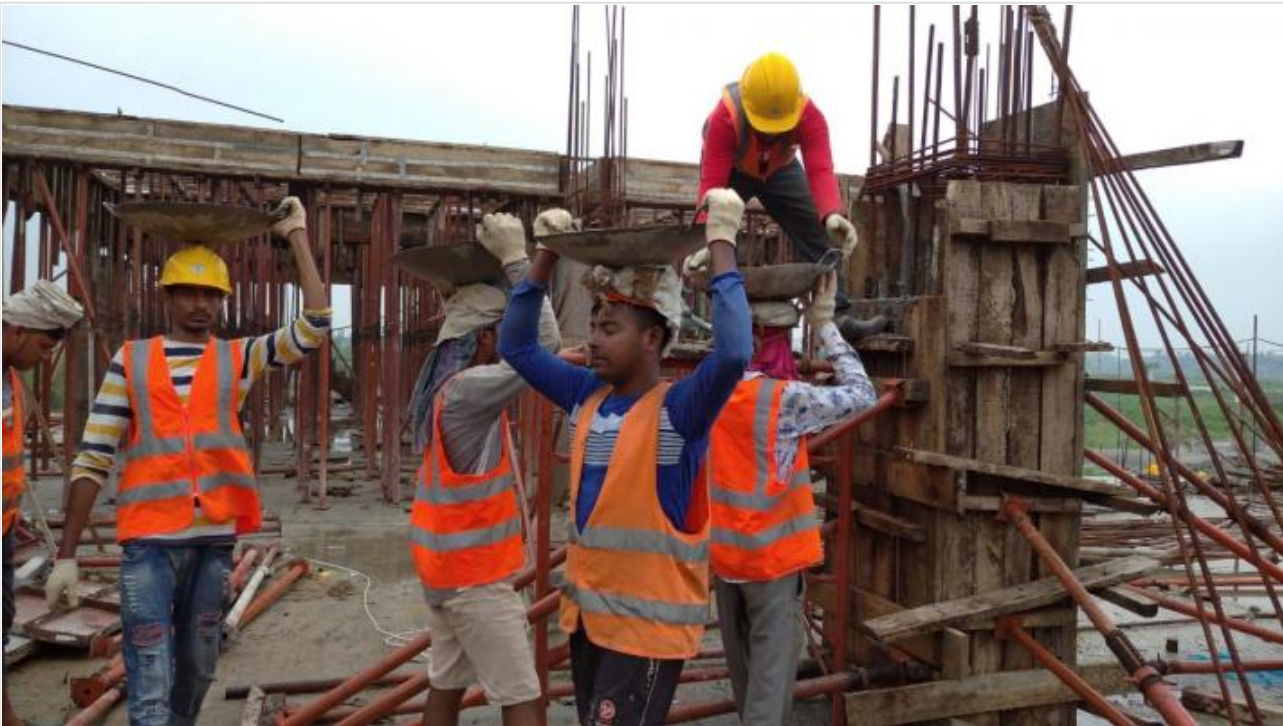
Ground Floor Column Concreting on 06-06-21