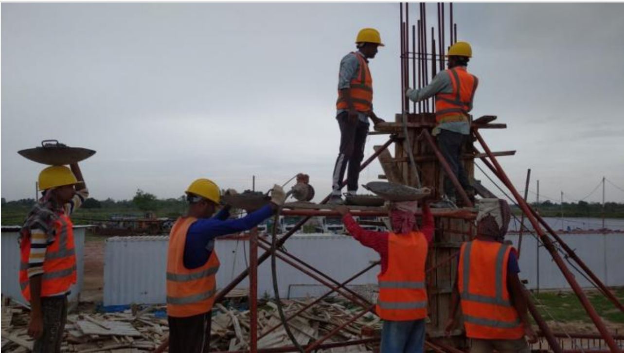
Ground Floor-Column Concreting on 26-05-21