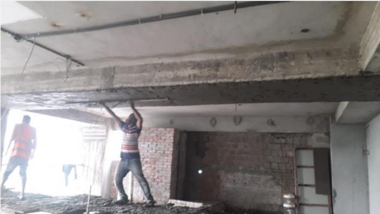
6F Parking Zone Beam Plaster on 15-01-21