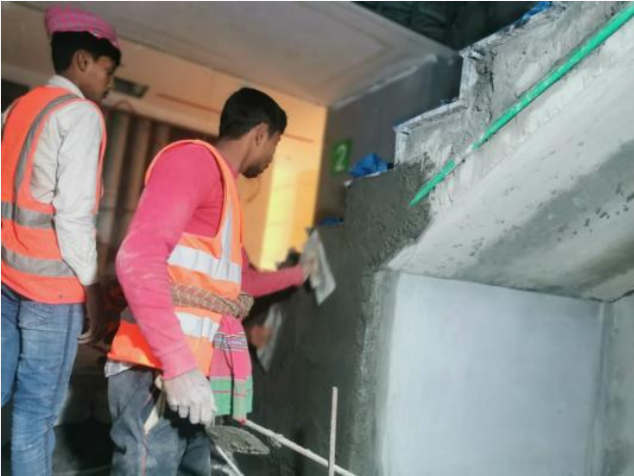
South Stair Side Plaster on 05-01-21