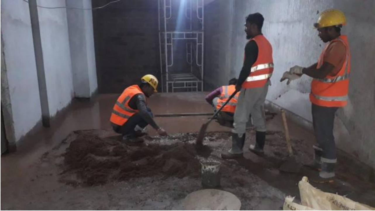
5F Patent Stone Flooring on 17-01-21