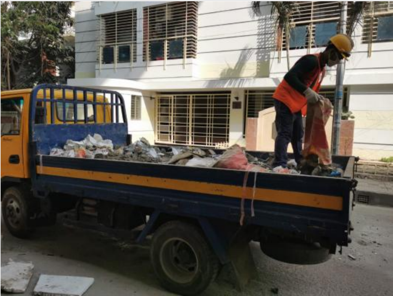
Rubish shifting to BTT, Purbachal on 28-02-21