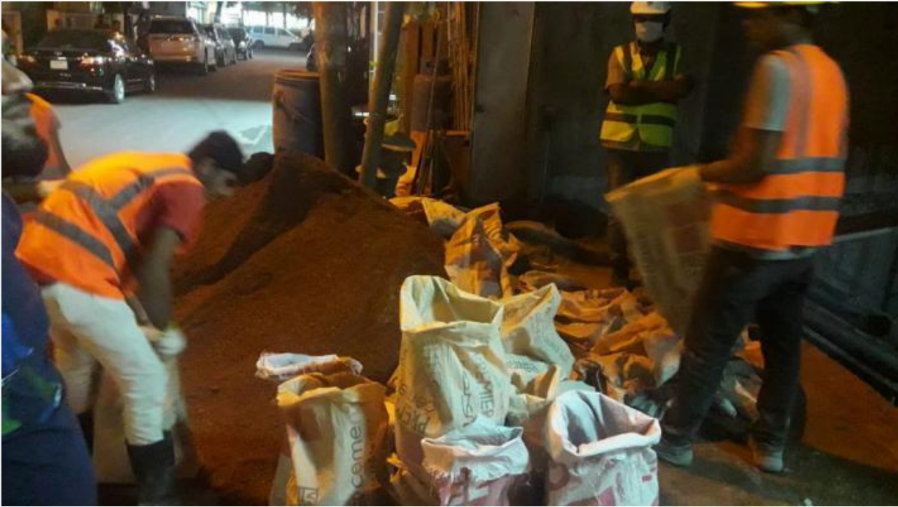
Materials Carrying on 03-12-20