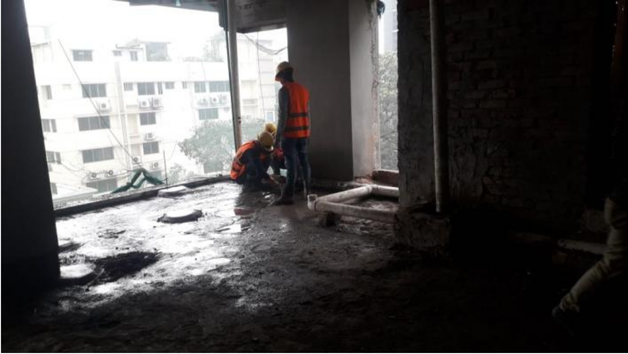
6F Patent Stone Flooring (Block Before) on 20-01-21