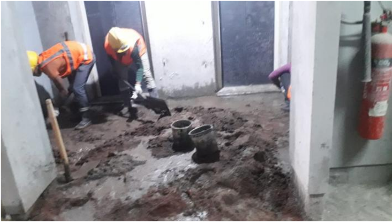
6F Patent Stone Flooring on 15-01-21