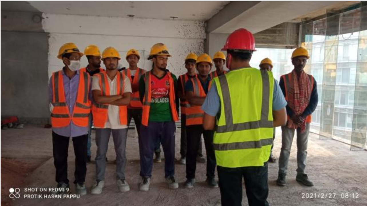
Toolbox meeting-Electrical Hazard on 28-02-21