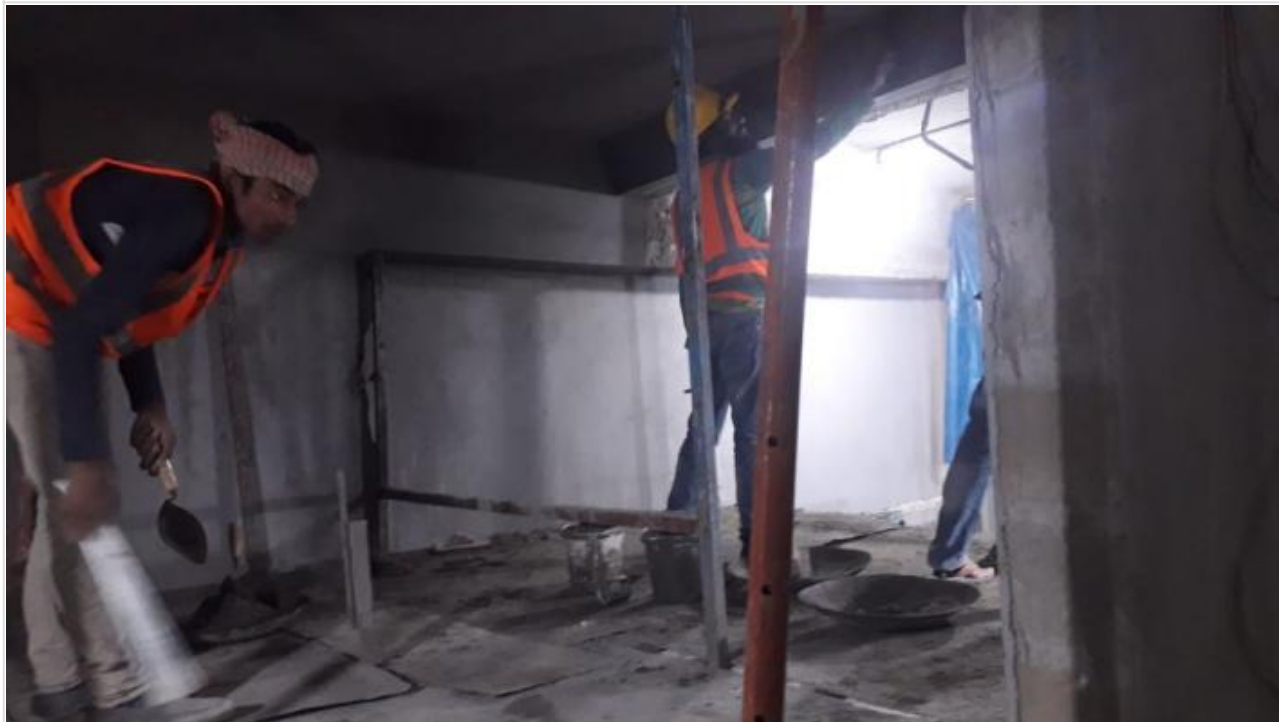
6F-Drive-way Beam Plaster on 23-01-21