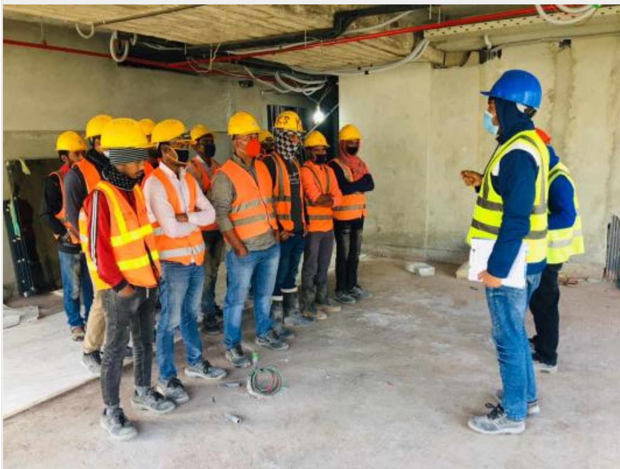
Toolbox Meeting-Work at Height on 01-02-21