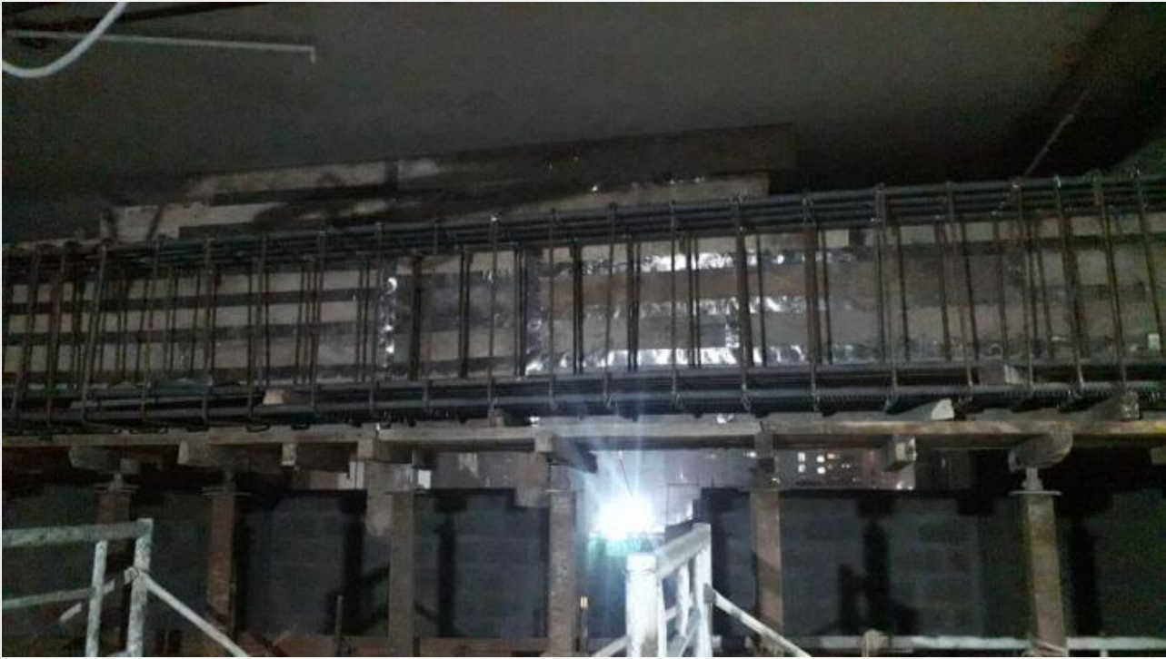
8F-Car Lift Beam Re-bar Work on 15-12-20