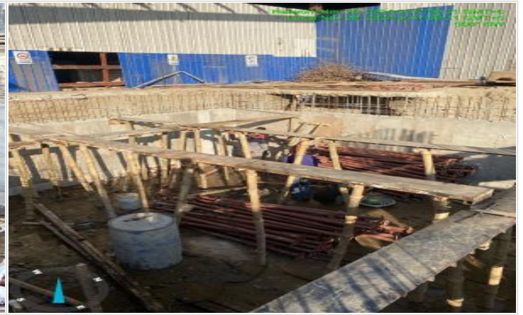
Tank slab shuttering on 19-11-24