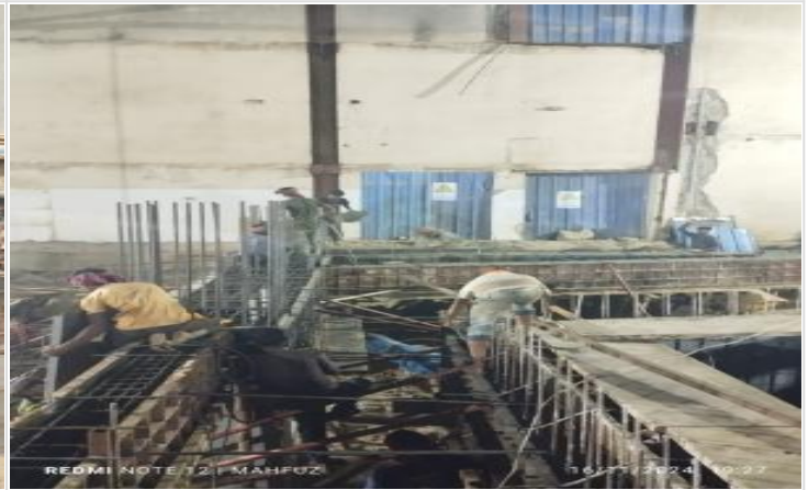
Foundation beam concreting on 16-11-24