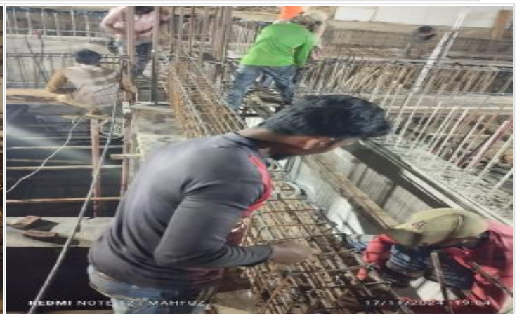
Foundation beam rebar work on 17-11-24