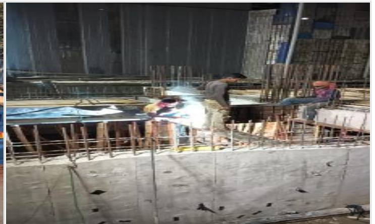
Embedded steel parts mobilized on 21-11-24