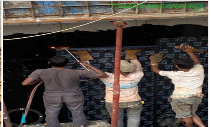
Tank slab shuttering on 22-11-24