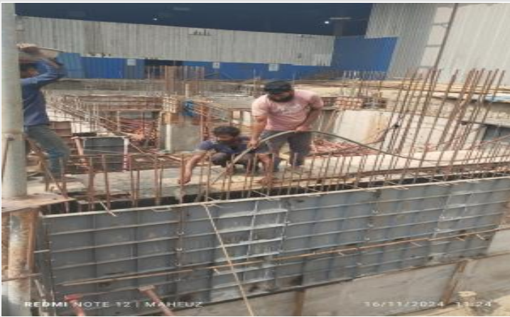
Wall concreting on 16-11-24