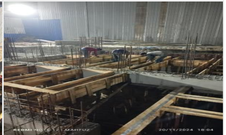
Tank slab shuttering on 20-11-24