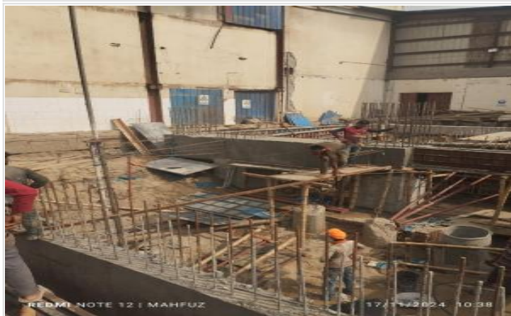
Foundation beam bottom shuttering on 17-11-24