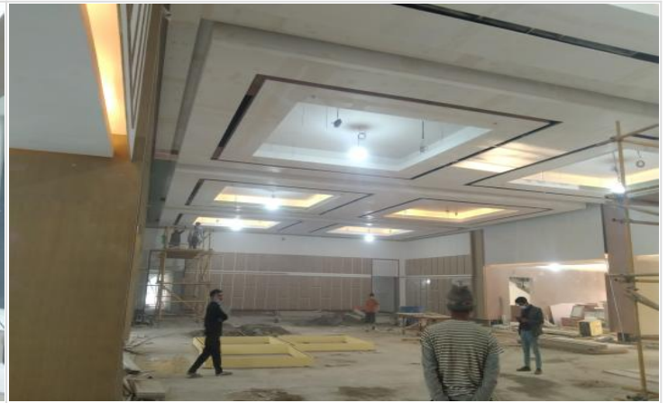
Interior work on 31-01-22