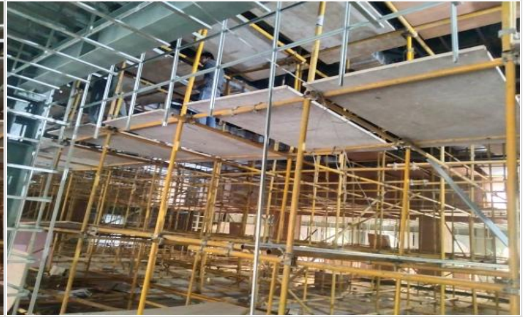
Interior ceiling on 05-01-22