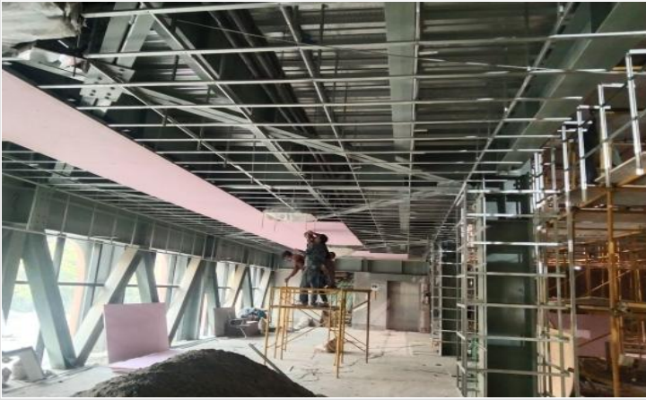
First floor ceiling work on 05-01-22