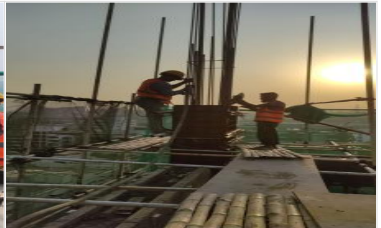
L-16-Column shuttering on 11-04-23