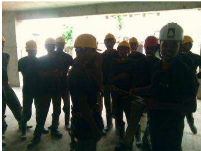
Tool Box Meeting