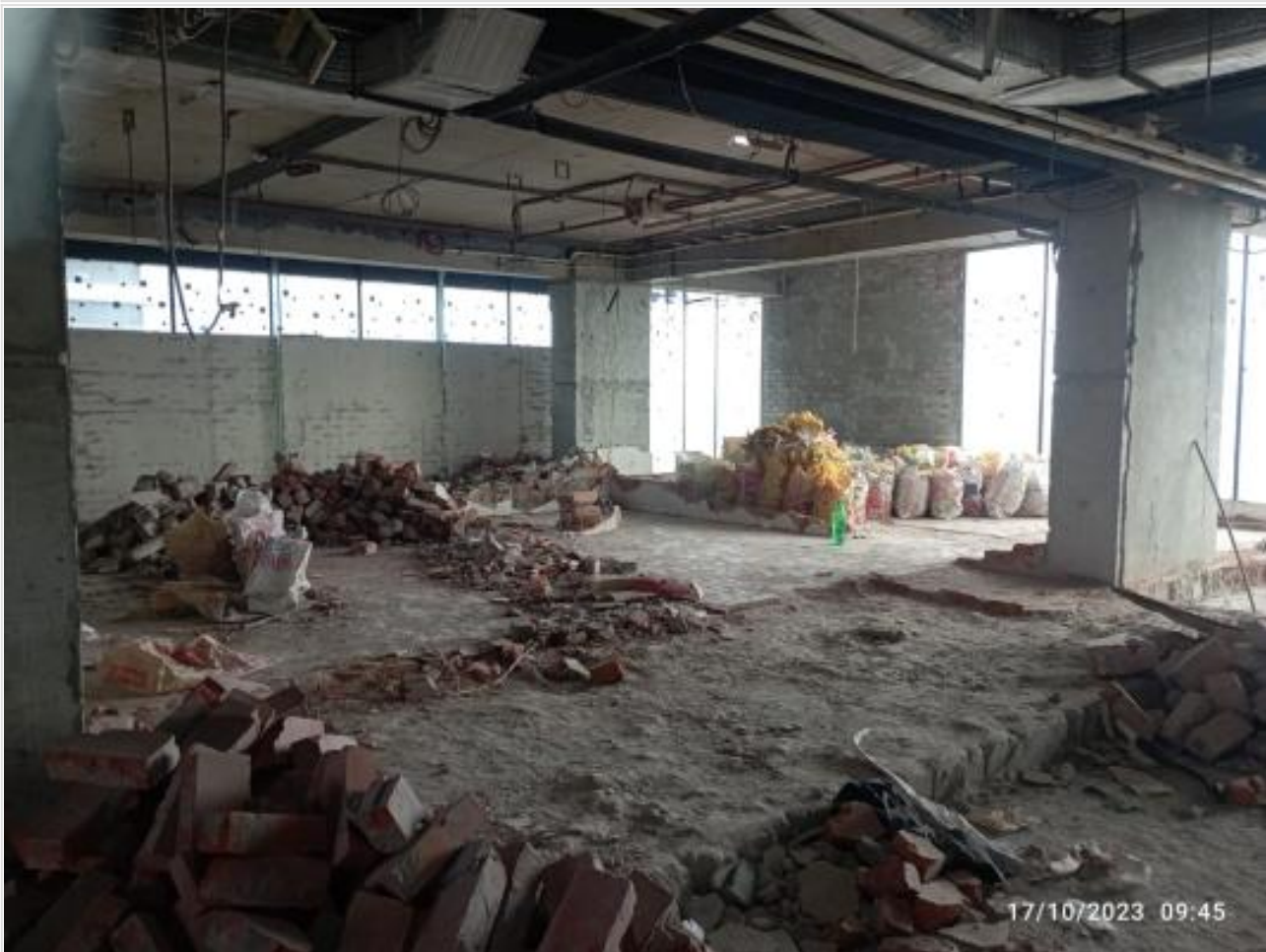
L-14-Kitchen Area on 16-10-23