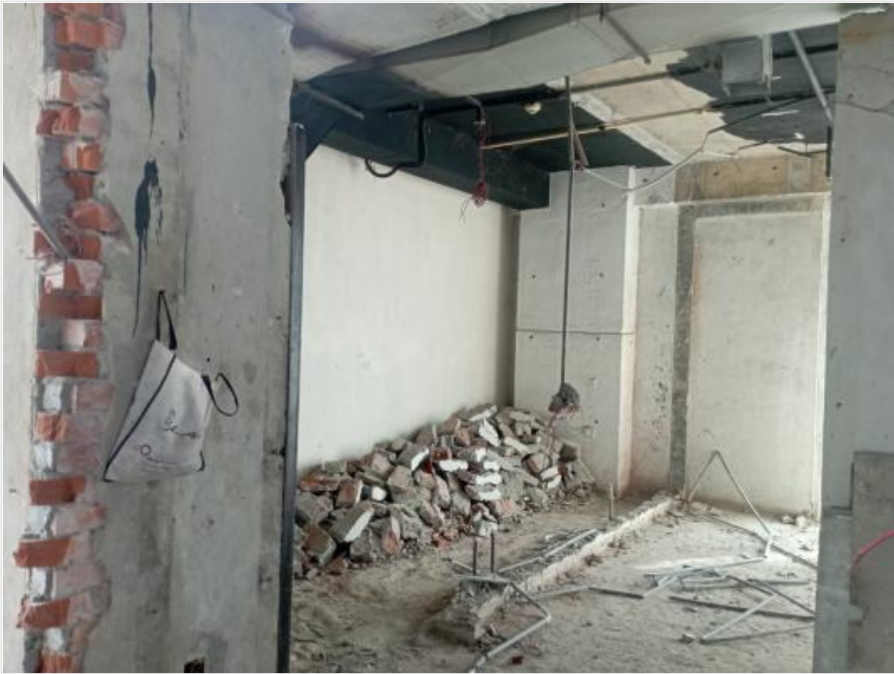
L-14-Kitchen Area on 24-10-23