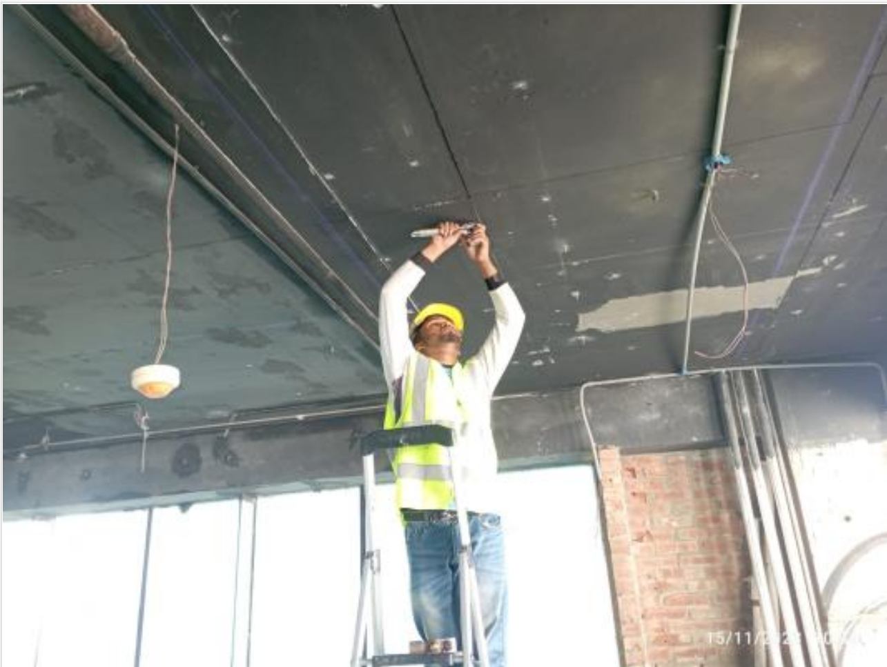
L-14-AC Installation on 15-11-23