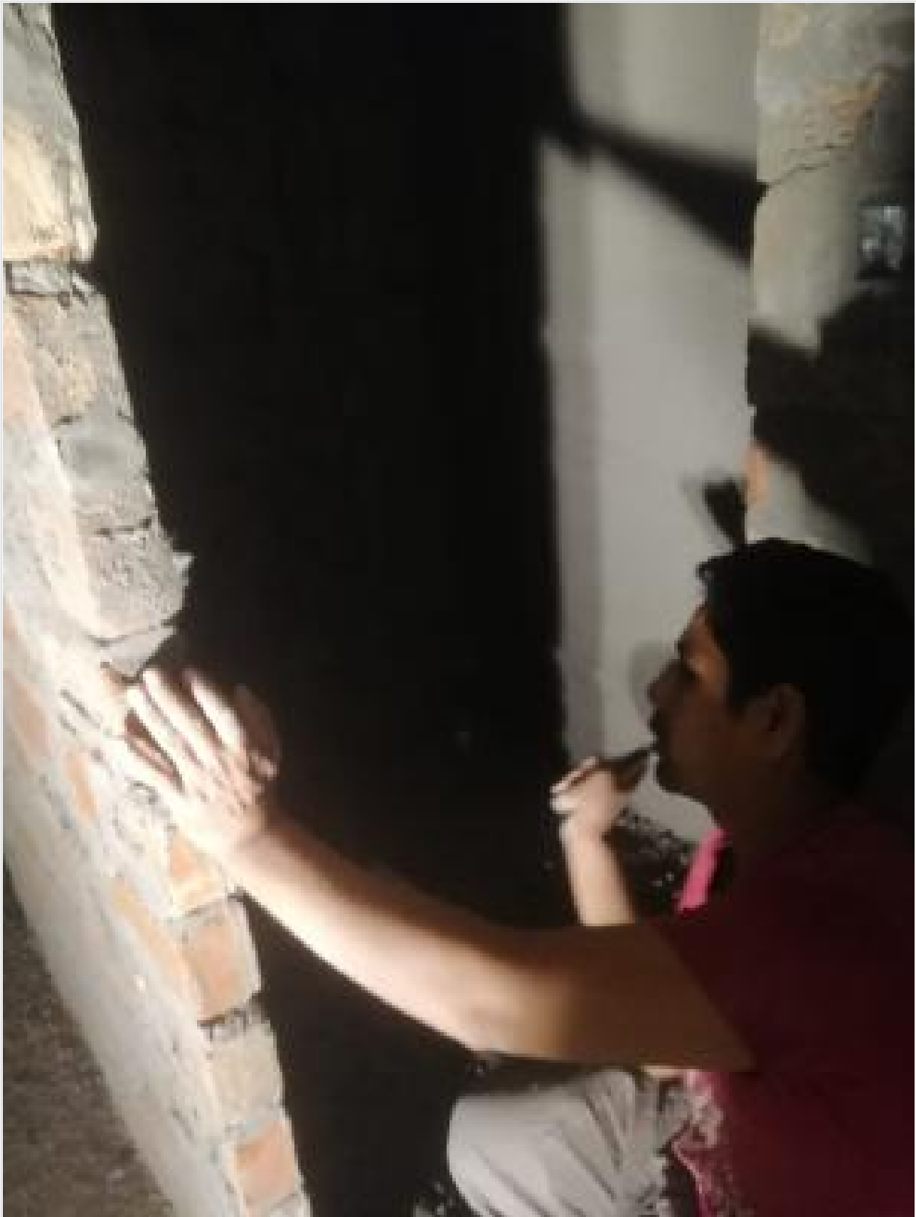
L-11-Steam-Suana-Plastering on 12-12-23