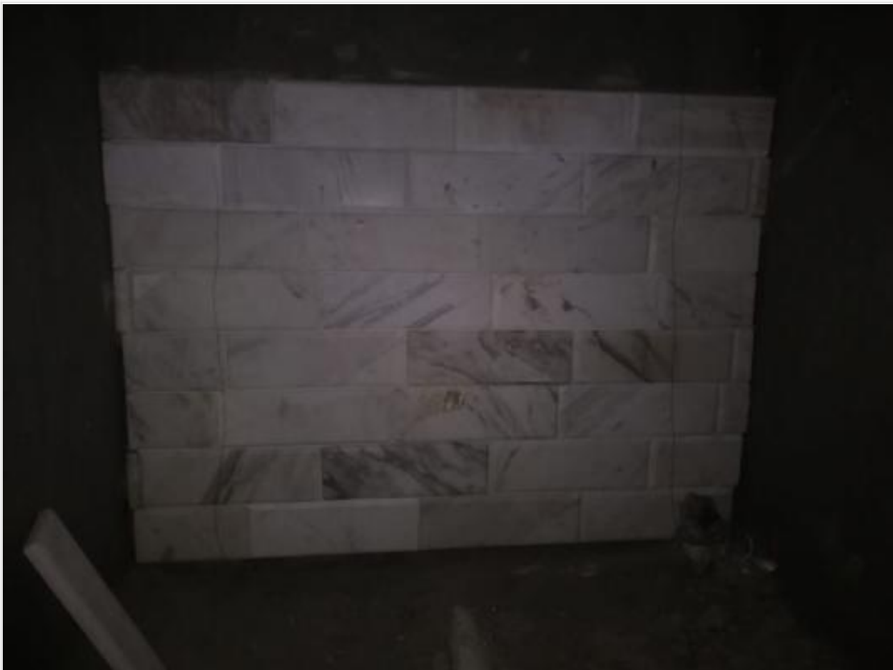
L-11-Steam-Tile Work on 17-12-23