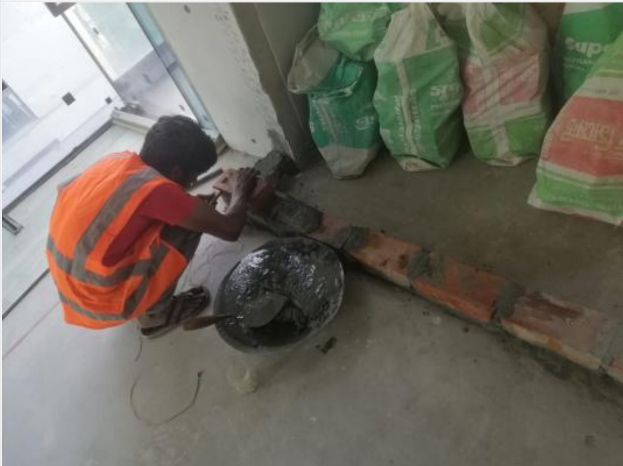
L-11-Steaming Suana-Brickwork on 28-11-23