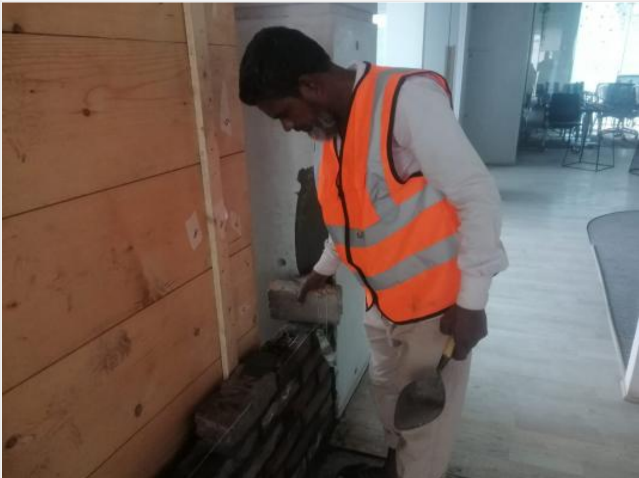
L-11-Steam n Suana-Brickwork on 29-11-23