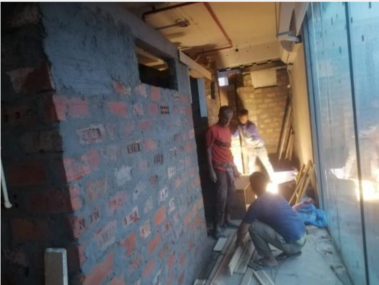
L-11-Steam-Suana-Brickwork on 07-12-23