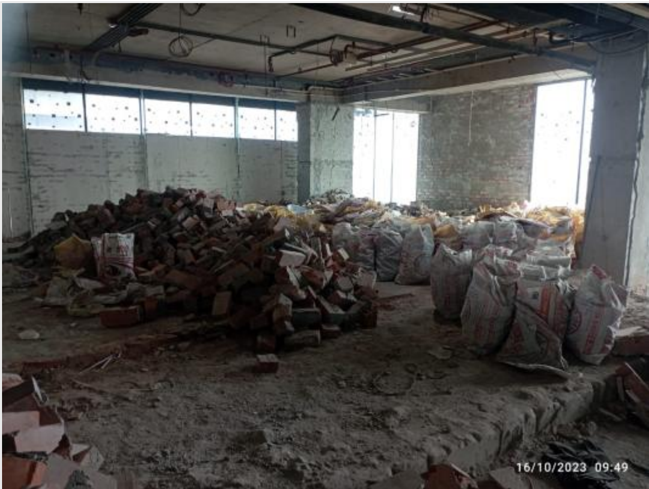
L14-Old Kitchen Wall-shelf demolition co on 15-10-23