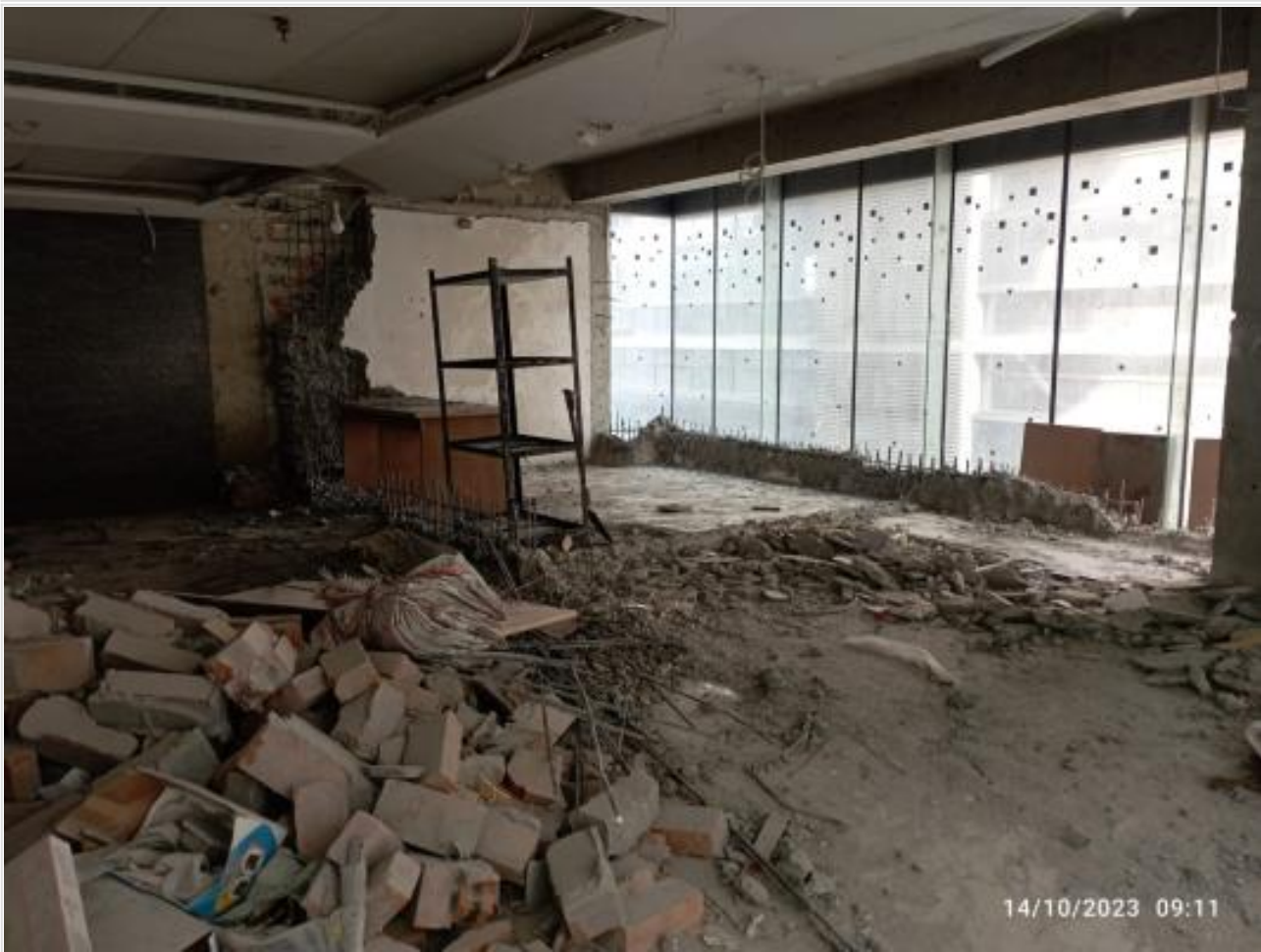
L-4-North Vault dismantling on 13-10-23