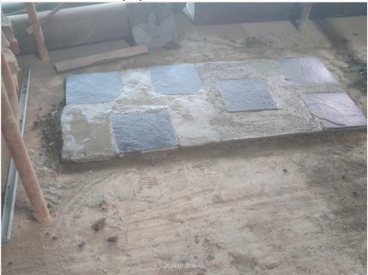
L-14-Floor Marble Mock-up on 01-01-24