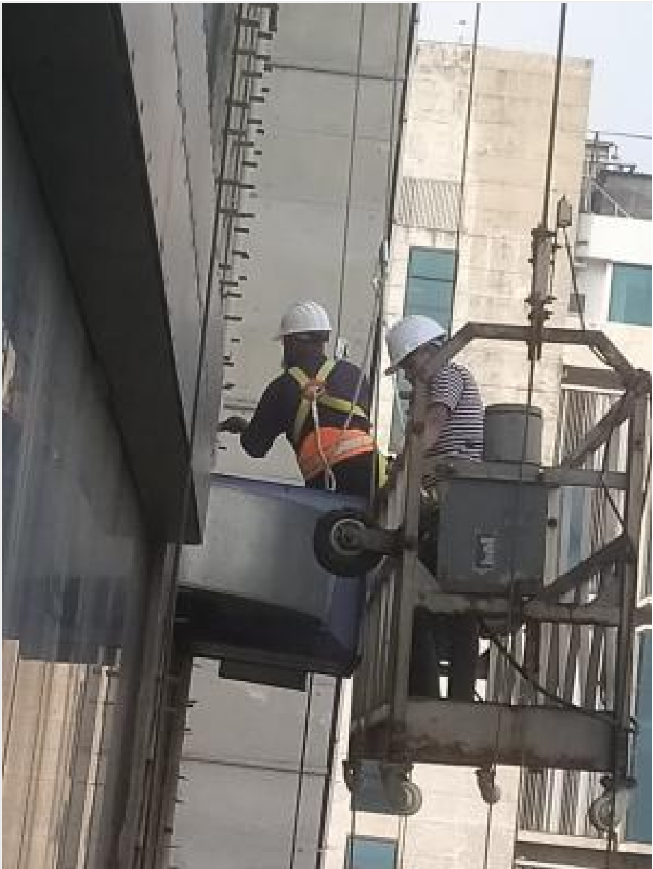
L-11-Steam-Suana-Plumbing work on 10-12-23