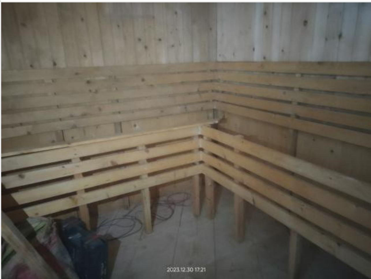
L-11-Suana Wooden wall on 30-12-23