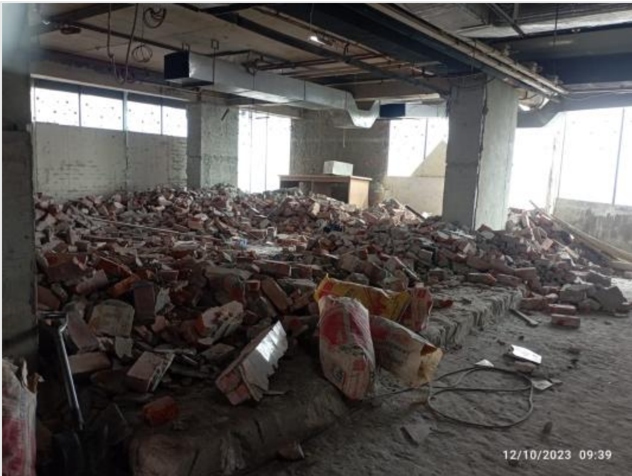
L-14-Old Kitchen wall dismantling on 11-10-23