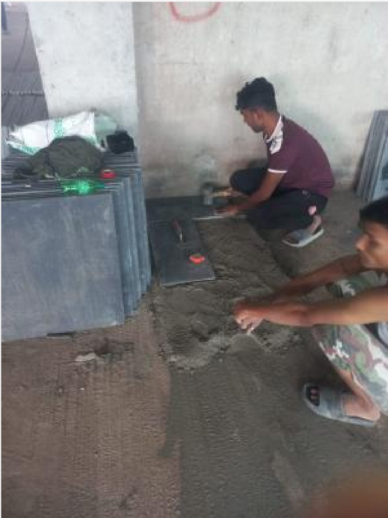
L-11-Steam-Suana-Plumbing work on 11-12-23