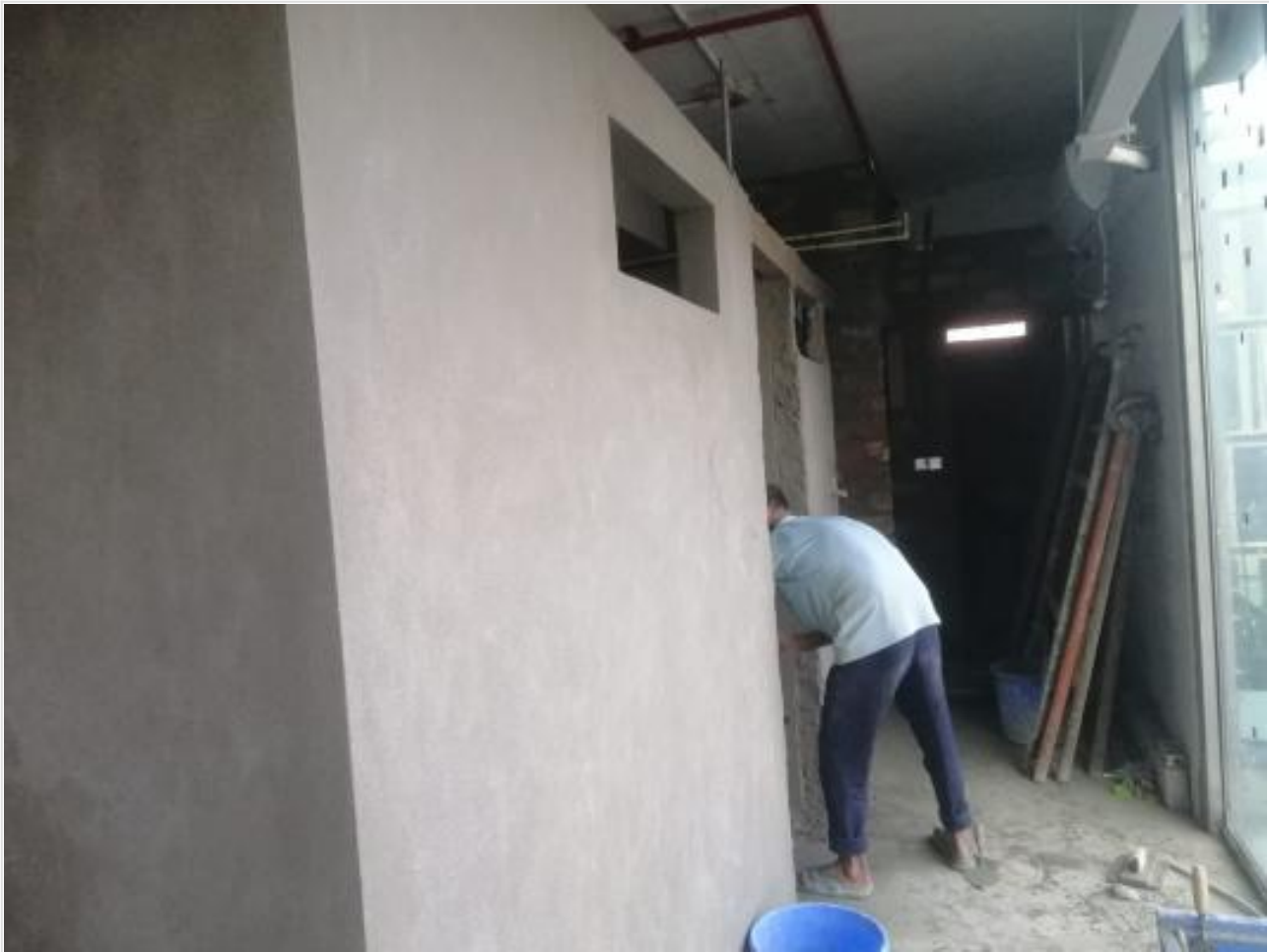
L-11-Steamin Suana-Plastering on 11-12-23