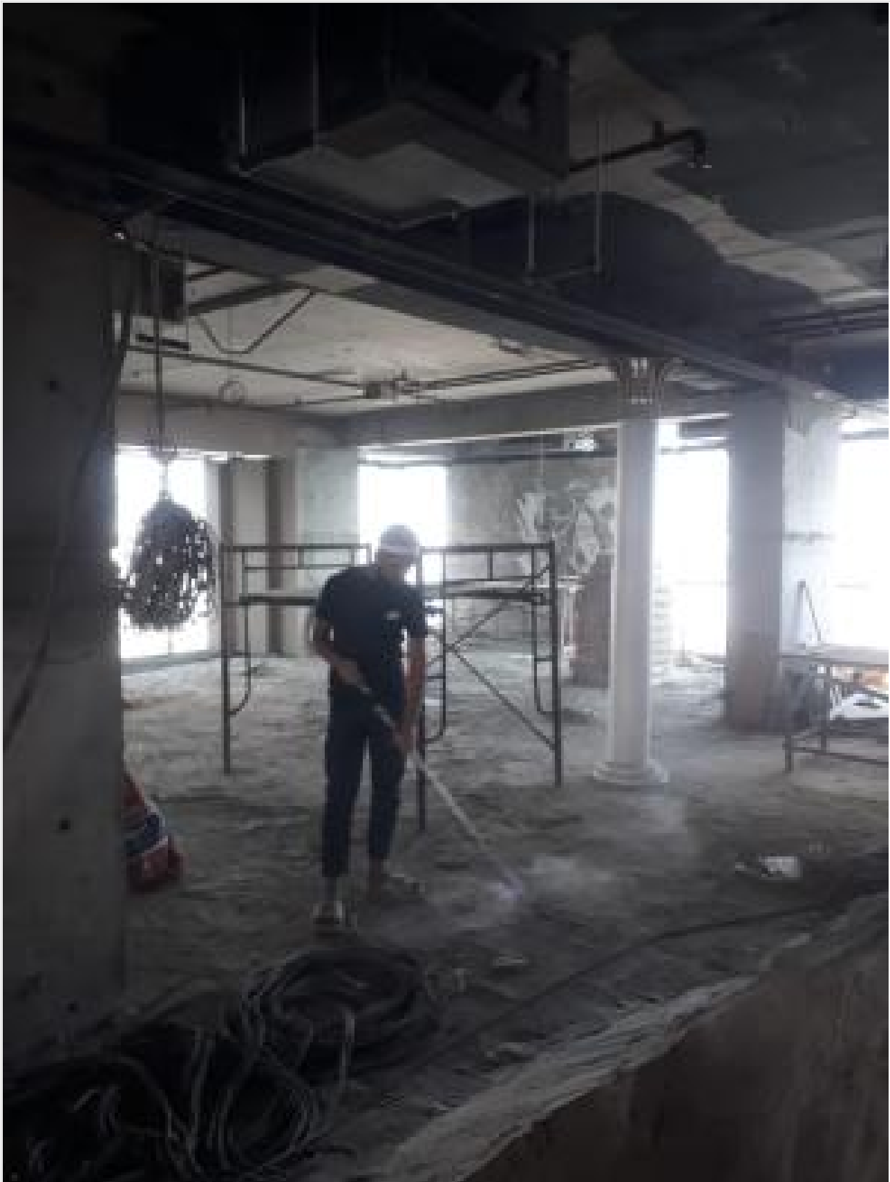
L-16-Materials Removal on 25-11-23