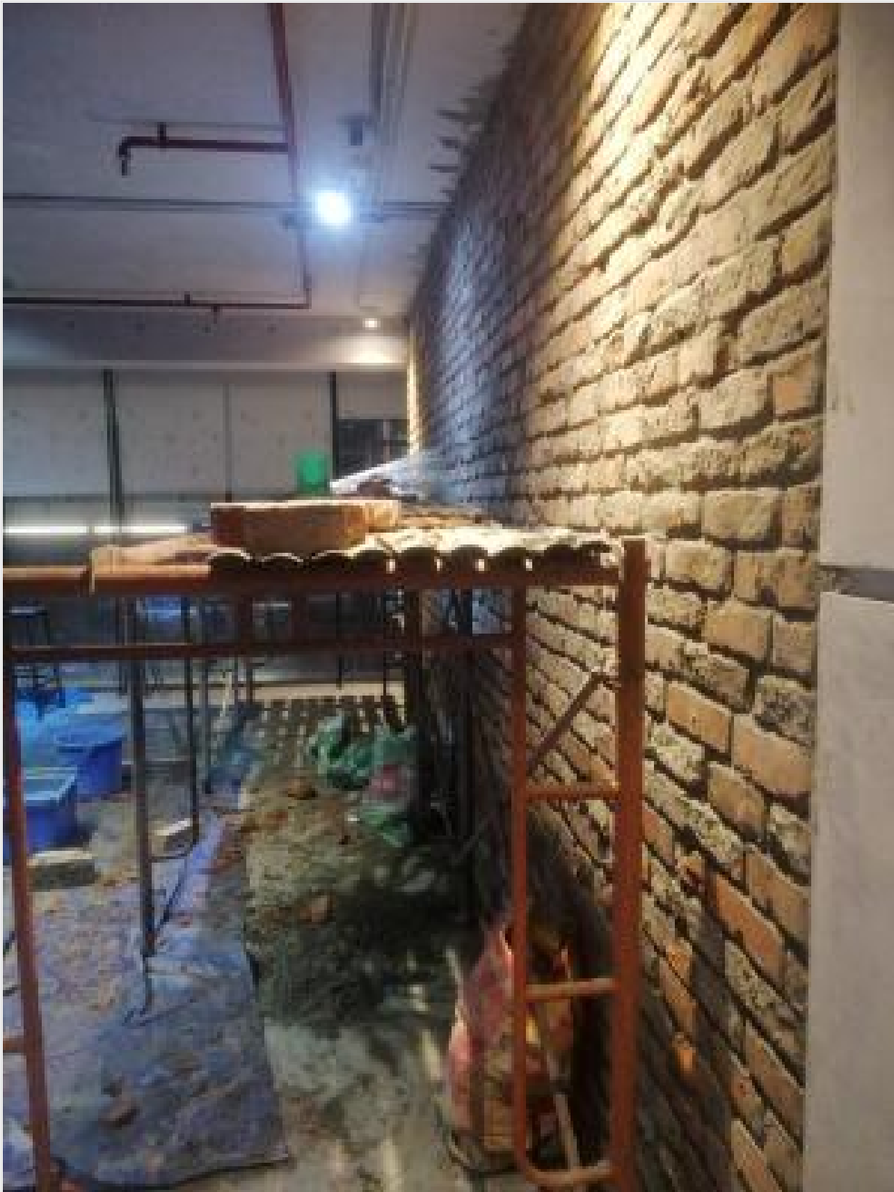
L-11-Steam-Suana-Brick-work on 03-12-23