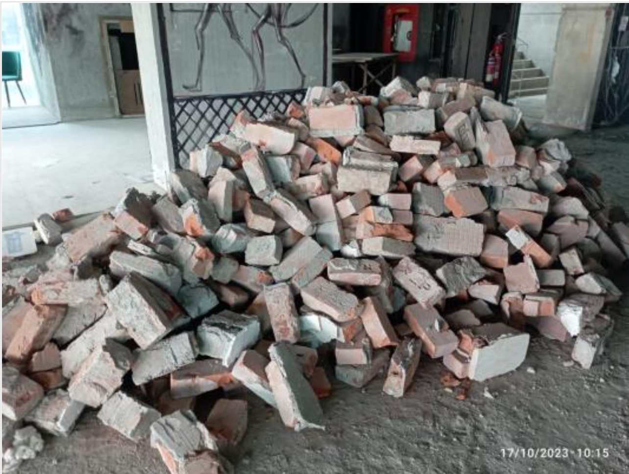
L-14-Dismatled Brick on 16-10-23

Dismantled brick to be used in another work