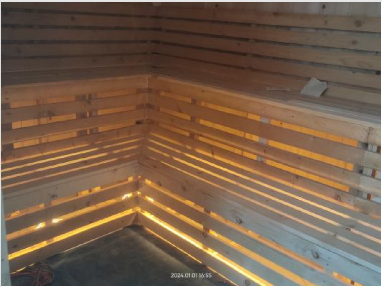
L-11-Steam-Suana-Wooden Wall-Lighting on 01-01-24