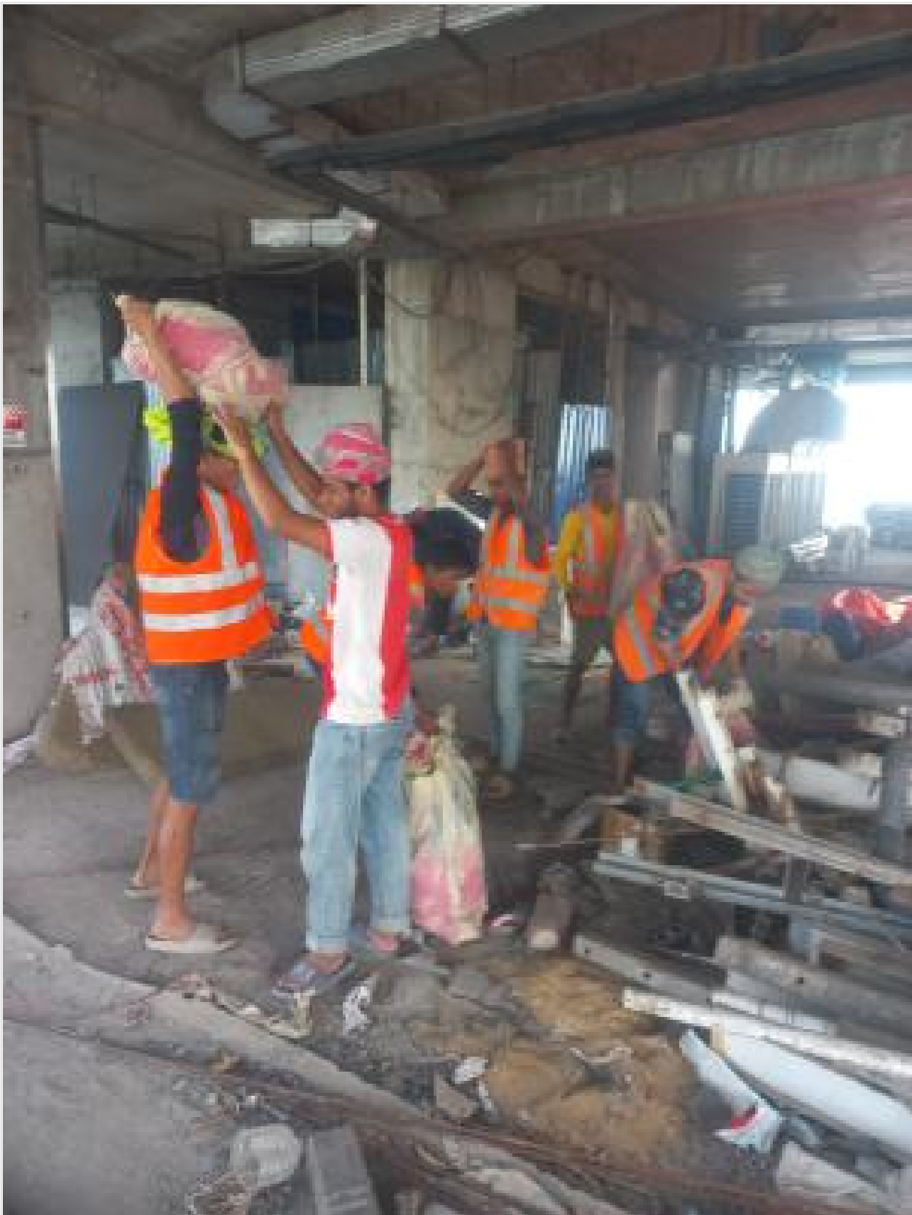
L-16-Materials Removal on 23-11-23