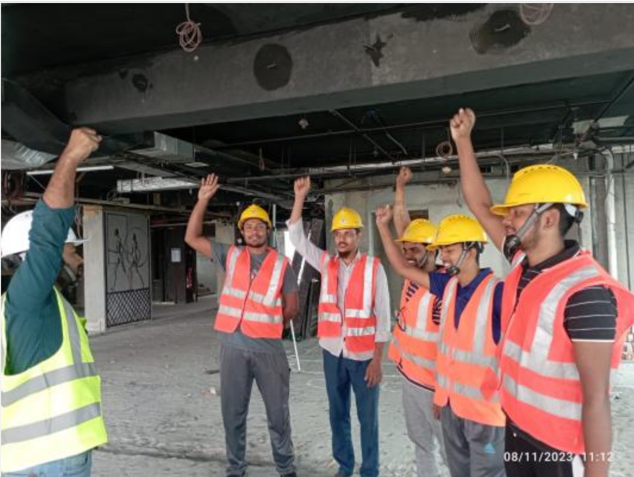
Safety Induction on 08-11-23