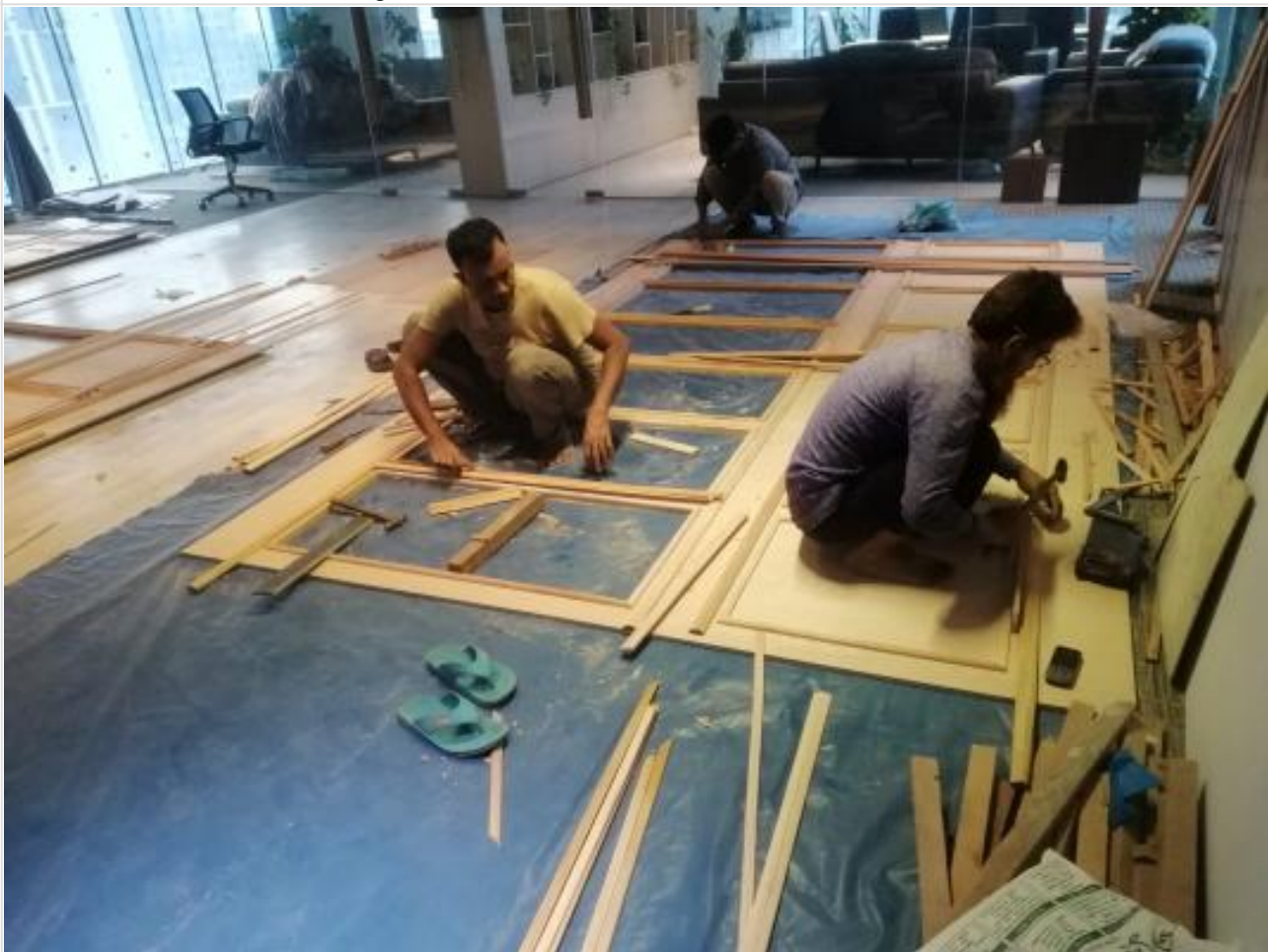
L-11-Lounge Outside Glass Frame on 28-12-23