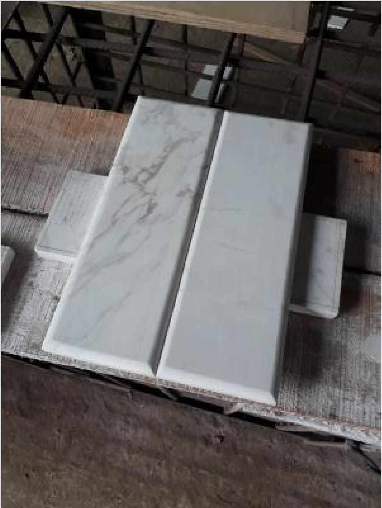
L-11-Steam-Marble moulding on 13-12-23