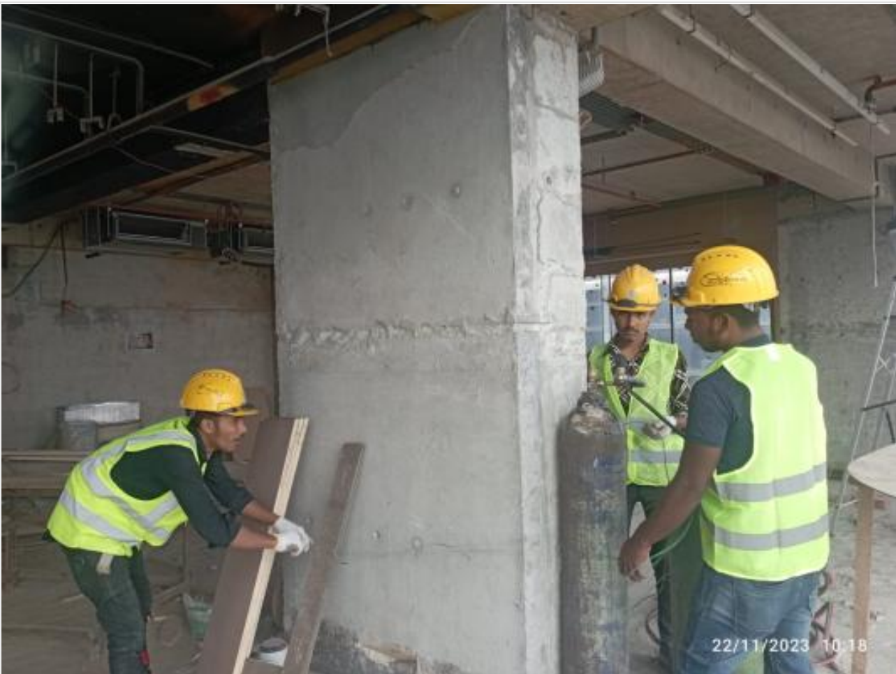
L-14-AC Installation on 22-11-23