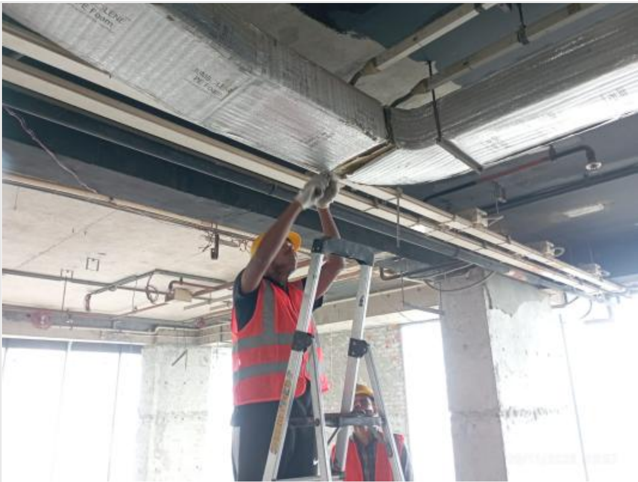
L-14-Old AC duct removing on 09-11-23