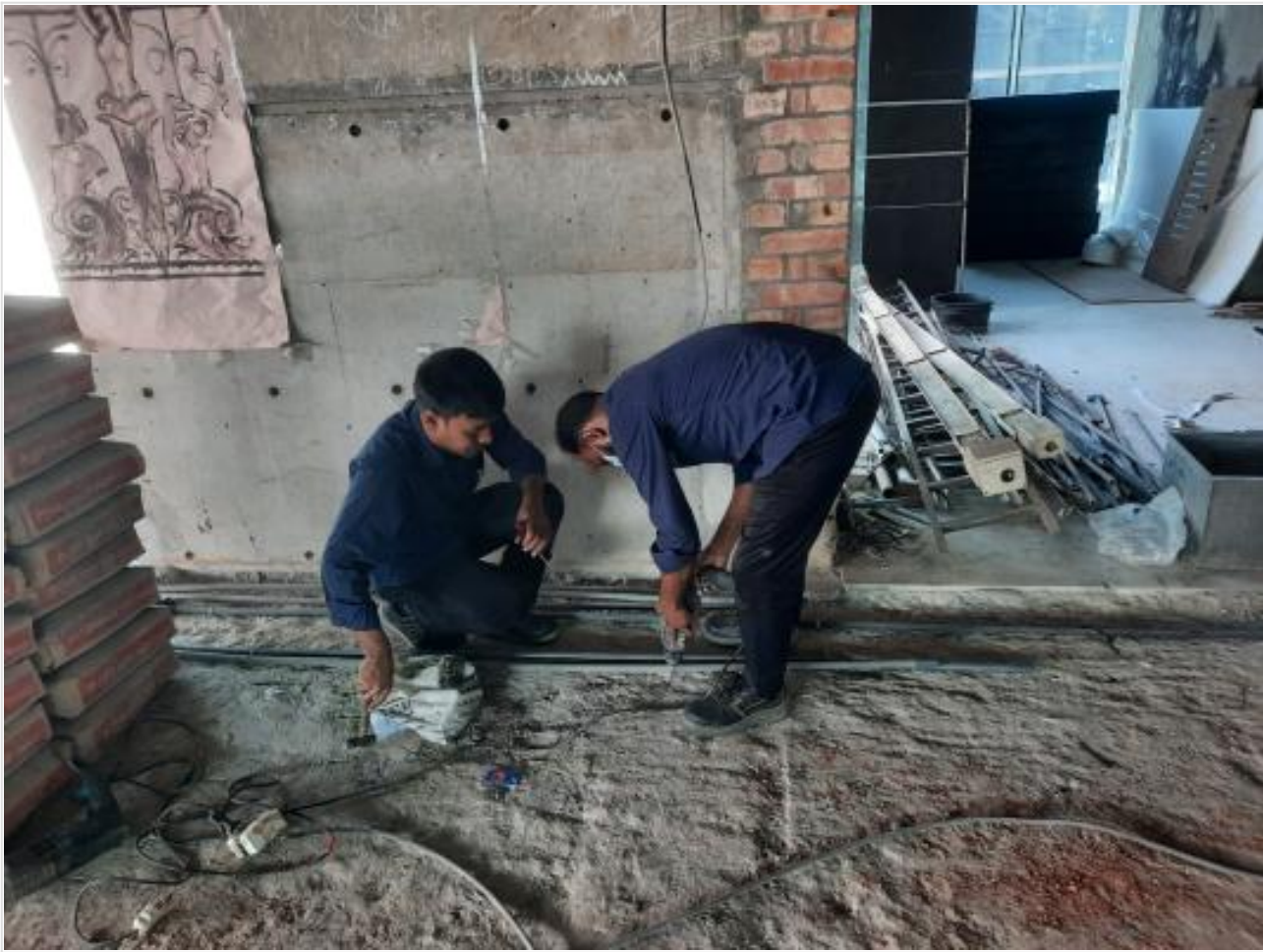
L-14-Electrical Pipe laying on 28-11-23