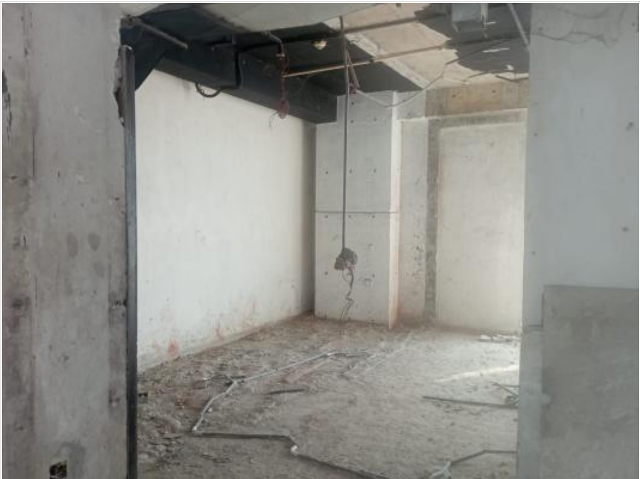
L-14-Old Kitchen Area on 26-10-23