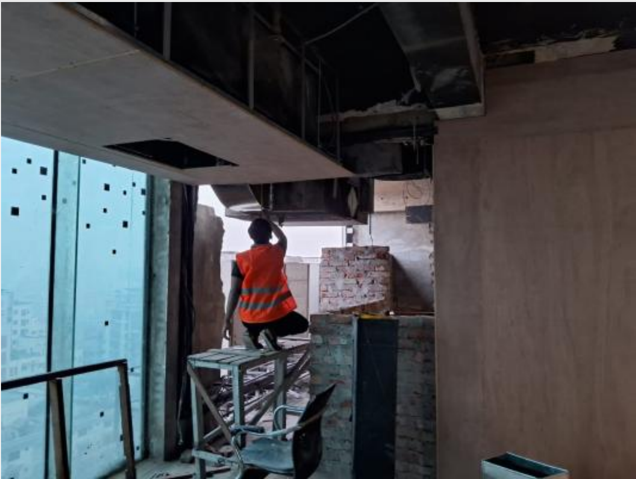
L-14-AC Ducting on 17-01-24