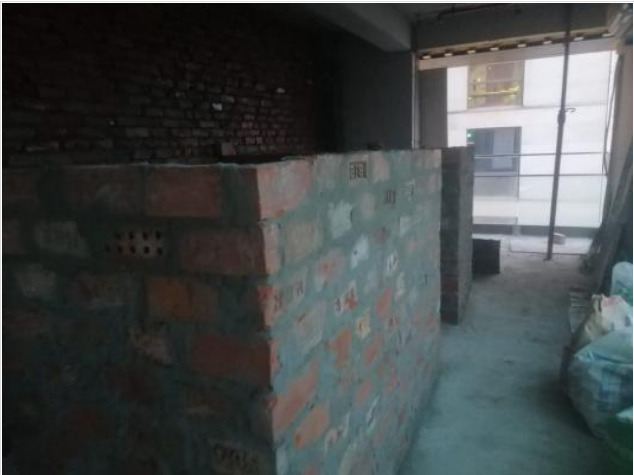
L-11-Steam-Suana-Brick-work on 04-12-23