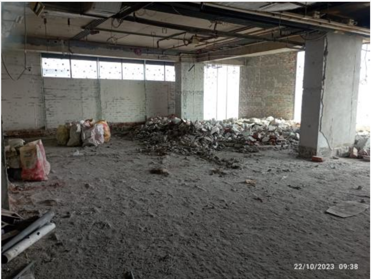
L-14-Kitchen Area on 23-10-23