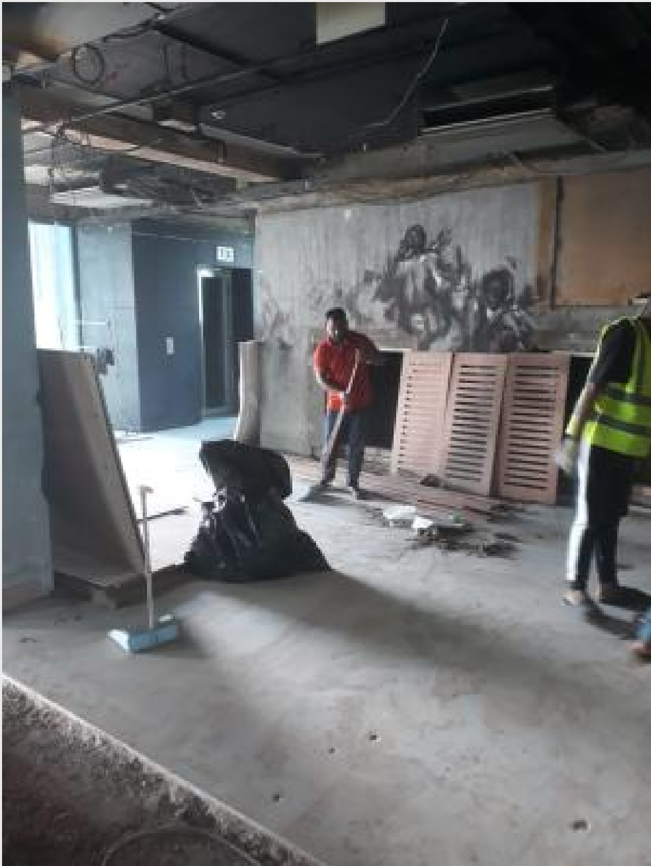
L-16-Materials Removal on 25-11-23