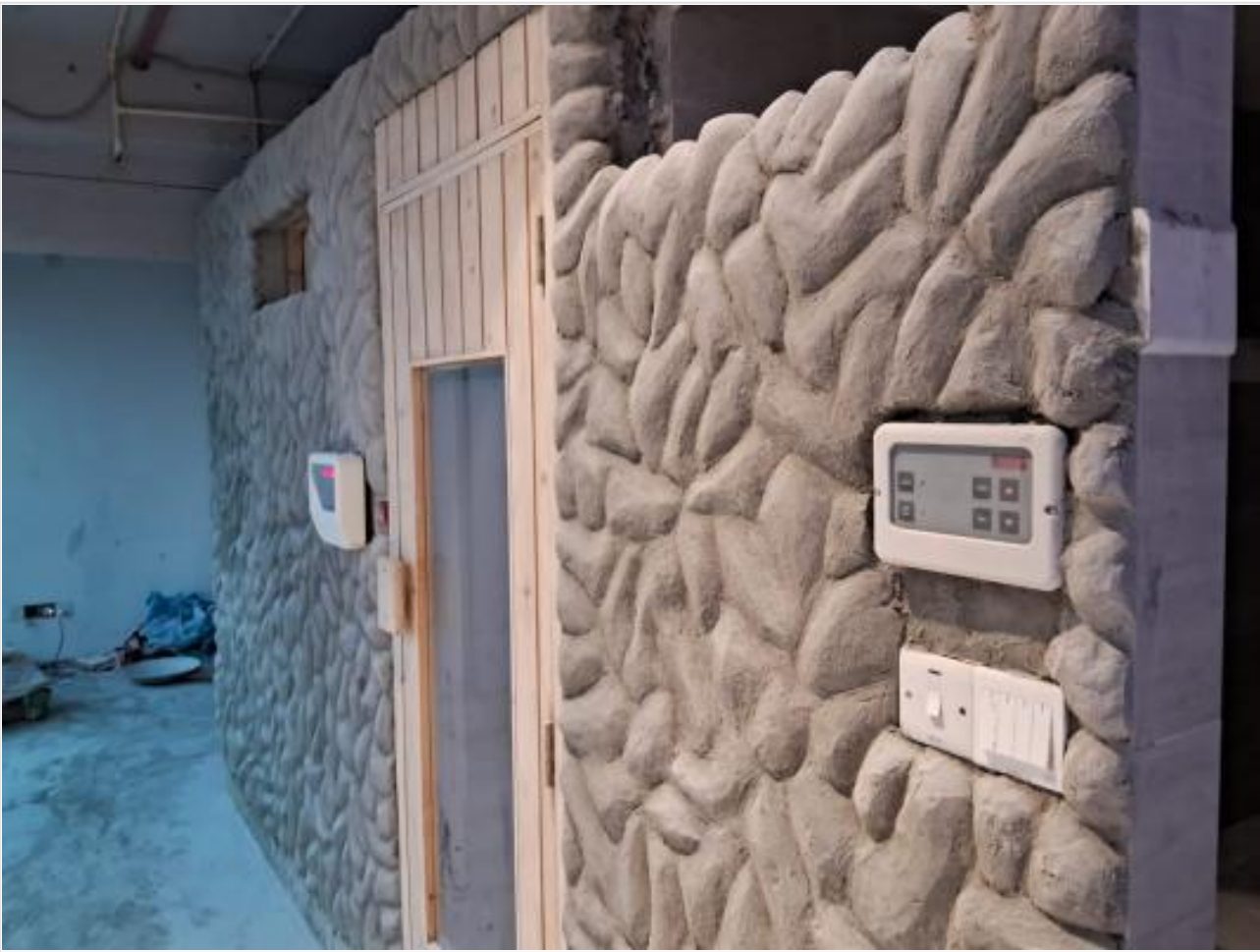
L-11-Outside Design Plaster on 22-01-24