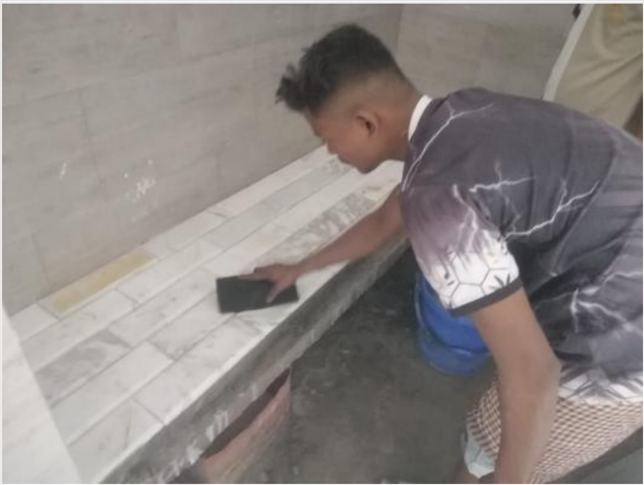
L-11-Steam-Suana-Marble Polishing on 26-12-23