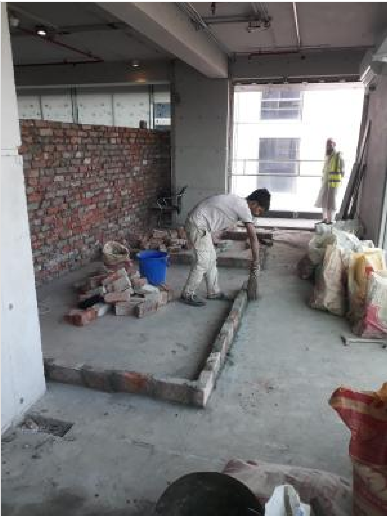
L-11-Steam-Suana-Brick-work on 02-12-23