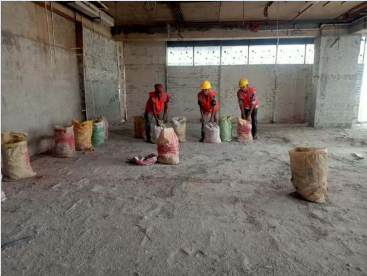
L-14-Old Kitchen Area Debris removing on 26-10-23