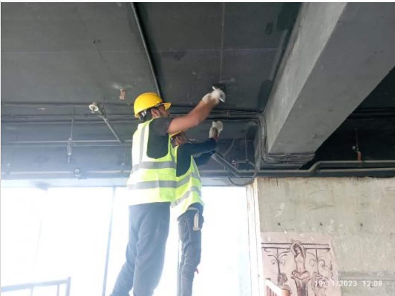
L-14-AC Installation on 19-11-23