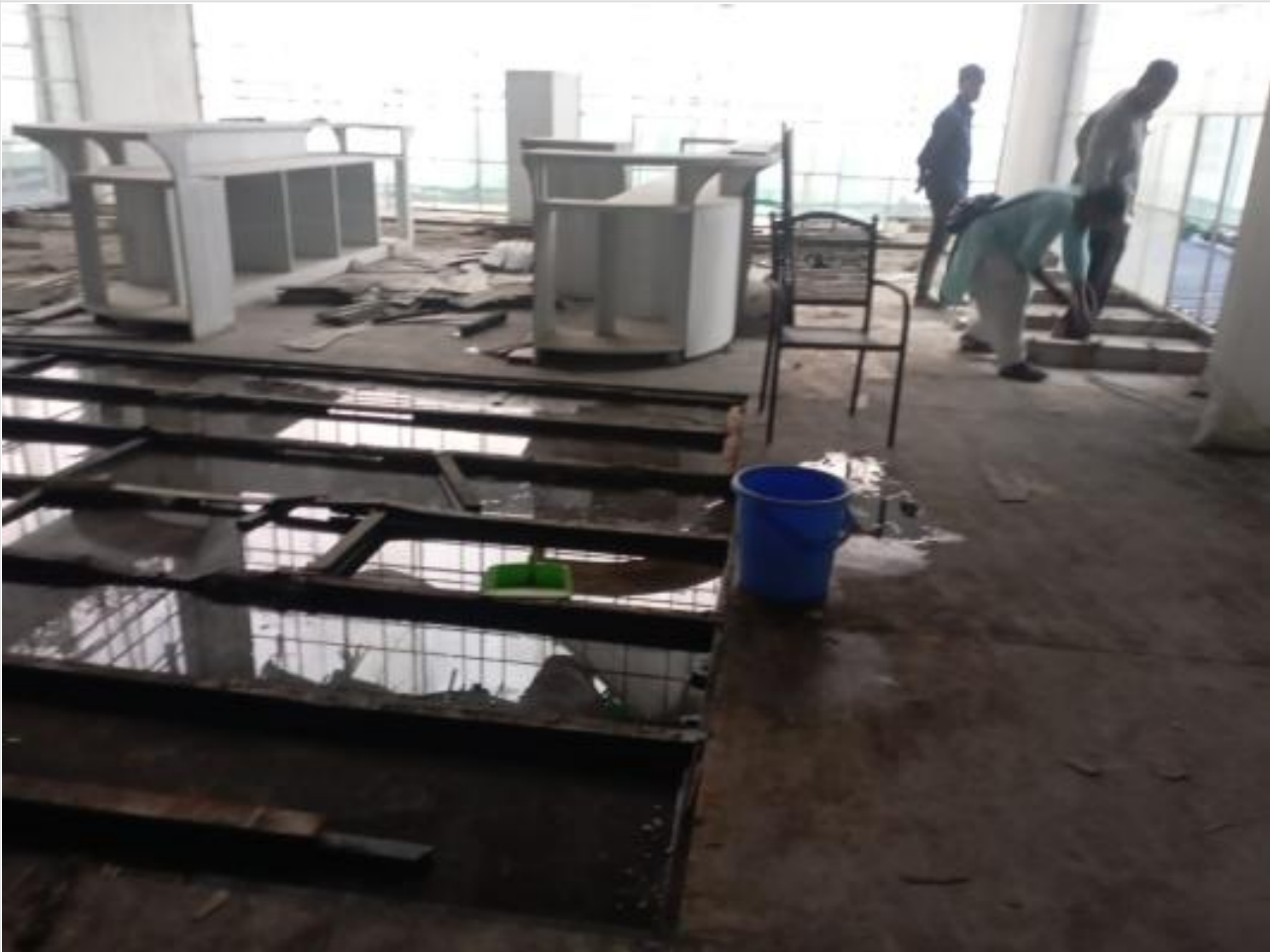
L-15-Wooden Floor dismantling on 24-12-23