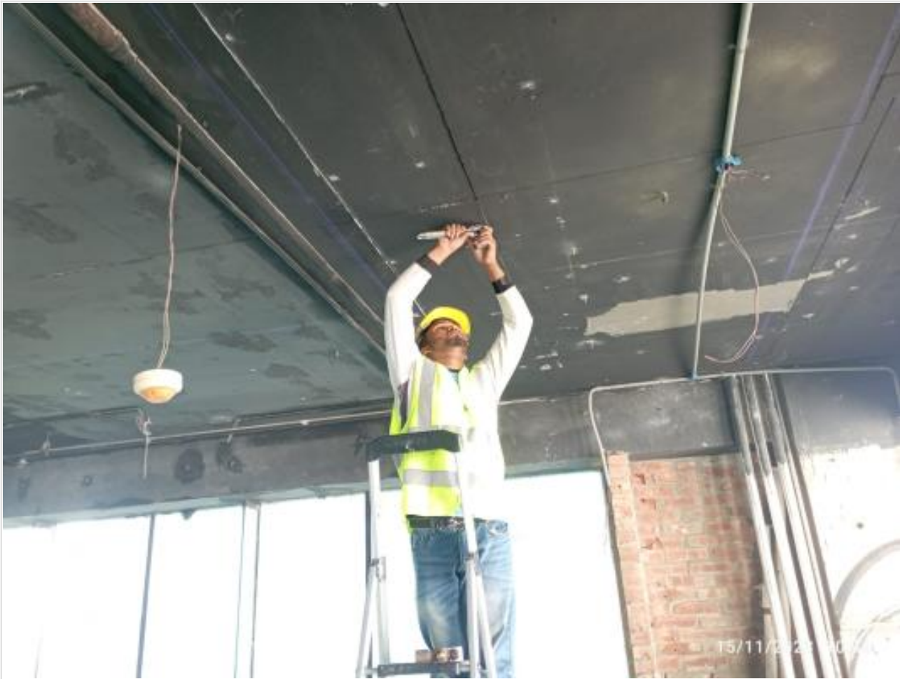
L-14-AC Installation on 15-11-23