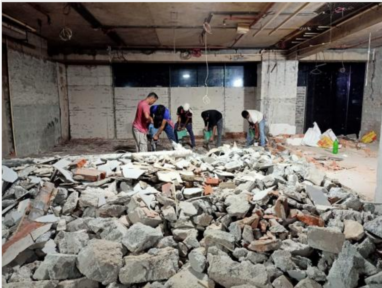
L-14-Kitcjen-Floor Dismantling on 19-10-23