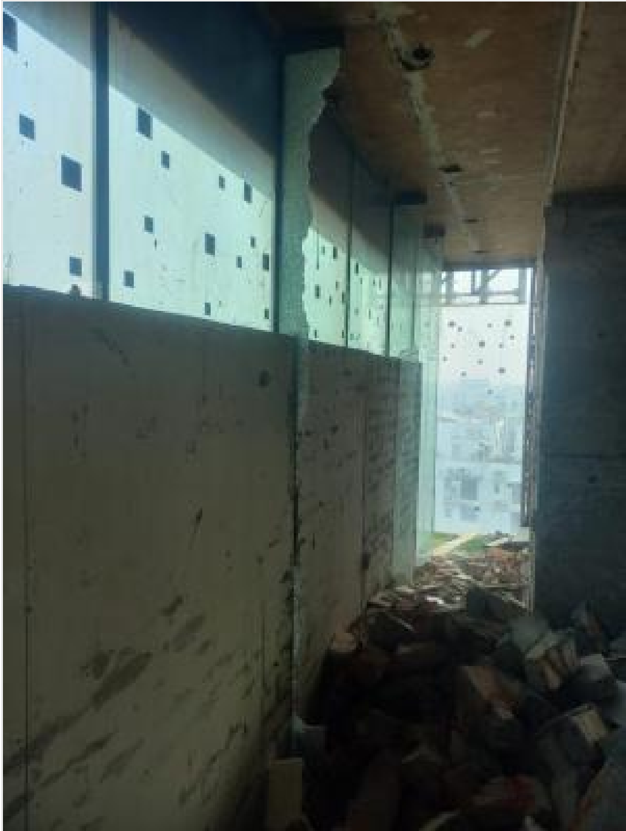
L-14-Fin glass broken during dismantling on 10-10-23