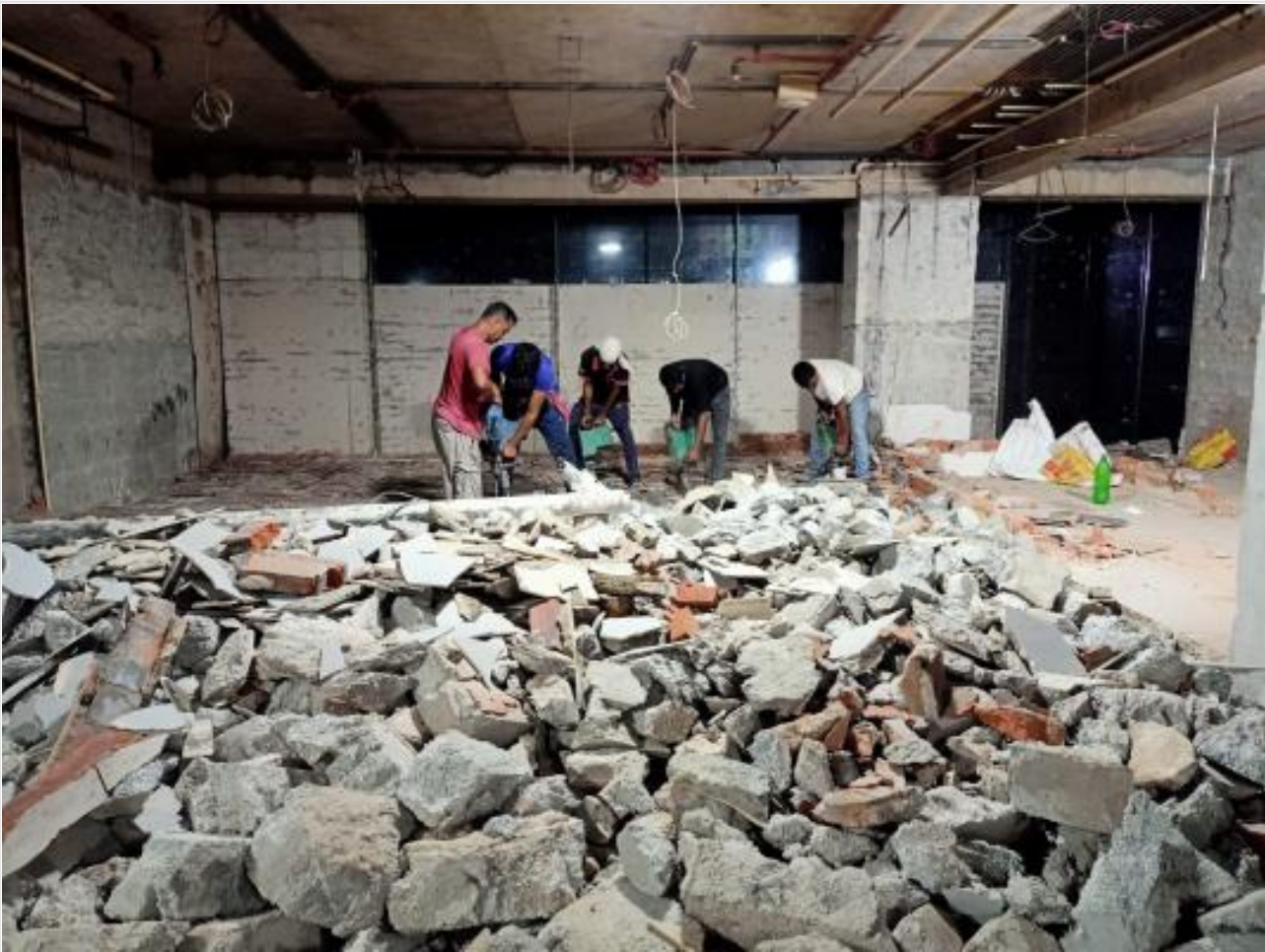
L-14-Kitchen Floor dismantling on 18-10-23