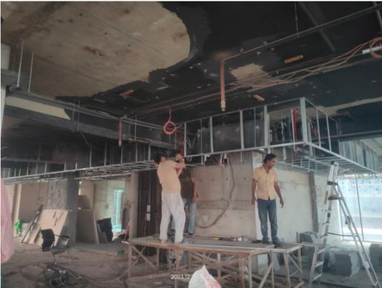
L-14-False Ceiling work on 24-12-23