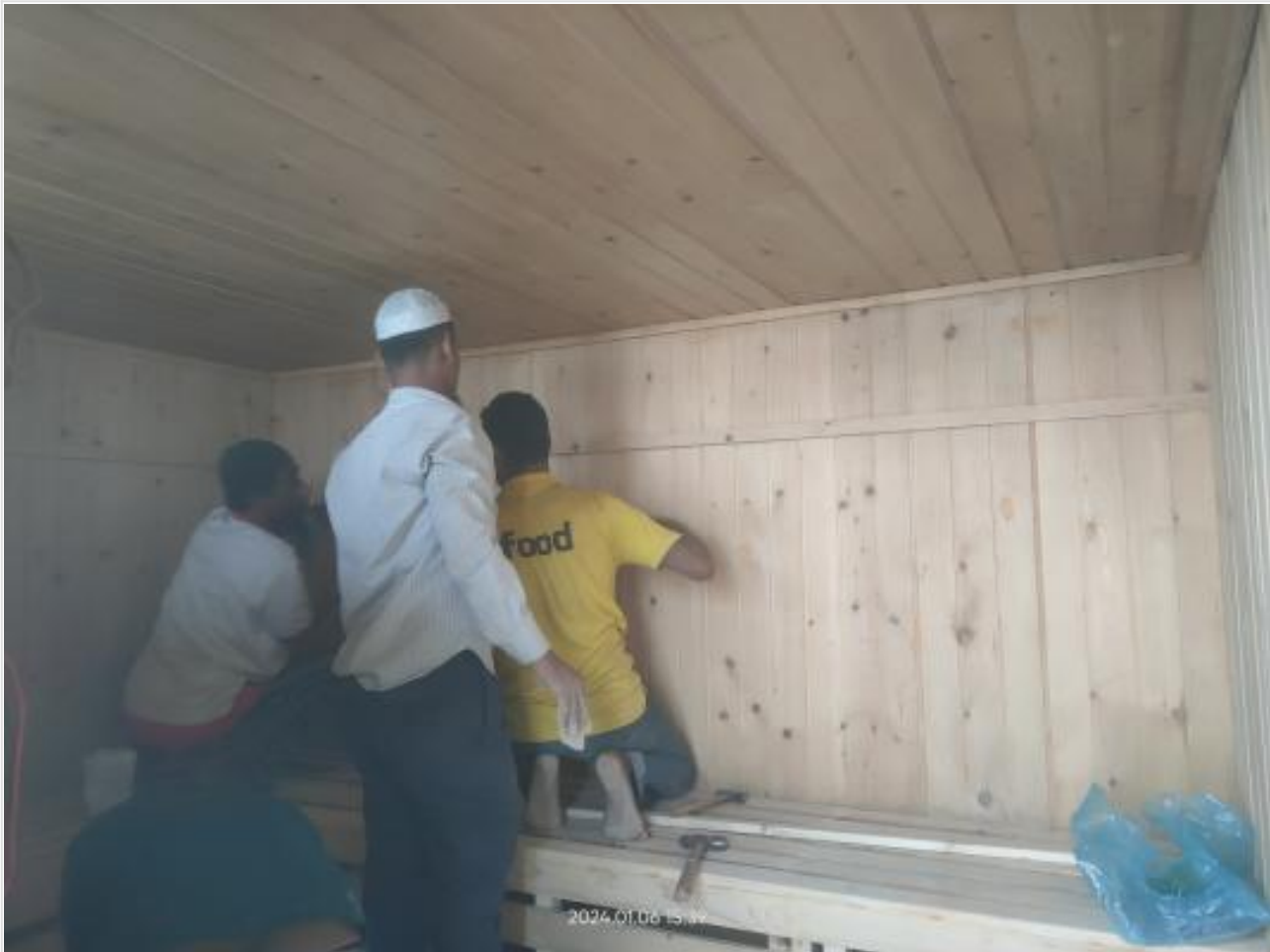
L-11-Suana-Wooden Wall Work on 06-01-24