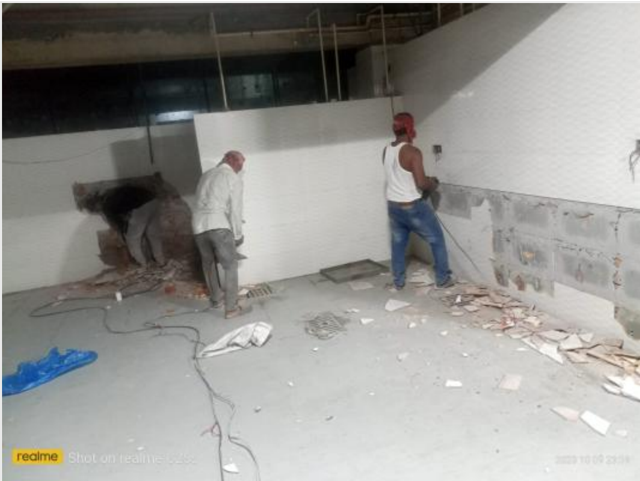
L-14-Old Kitchen wall dismantling on 09-10-23