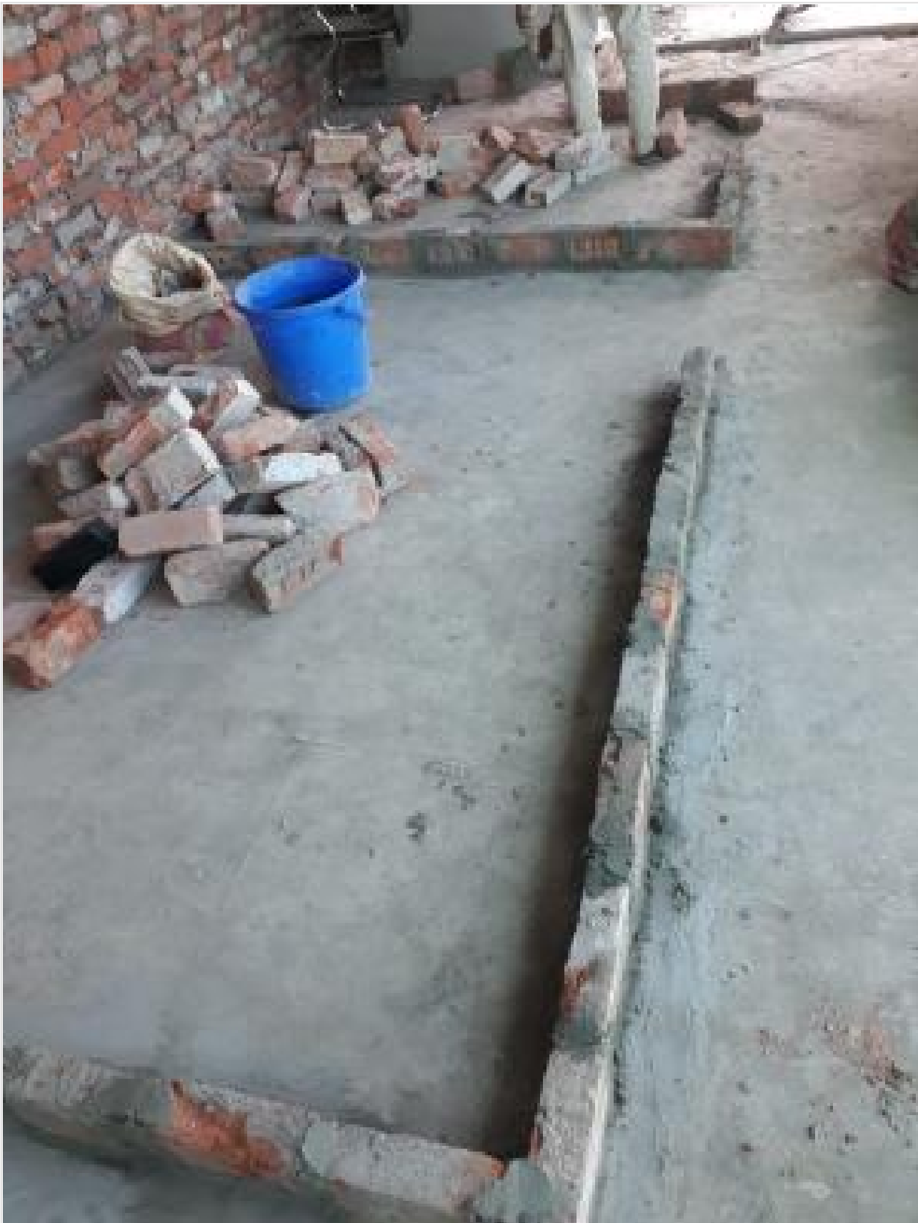
L-11-Steam-Suana-Brick-work on 02-12-23