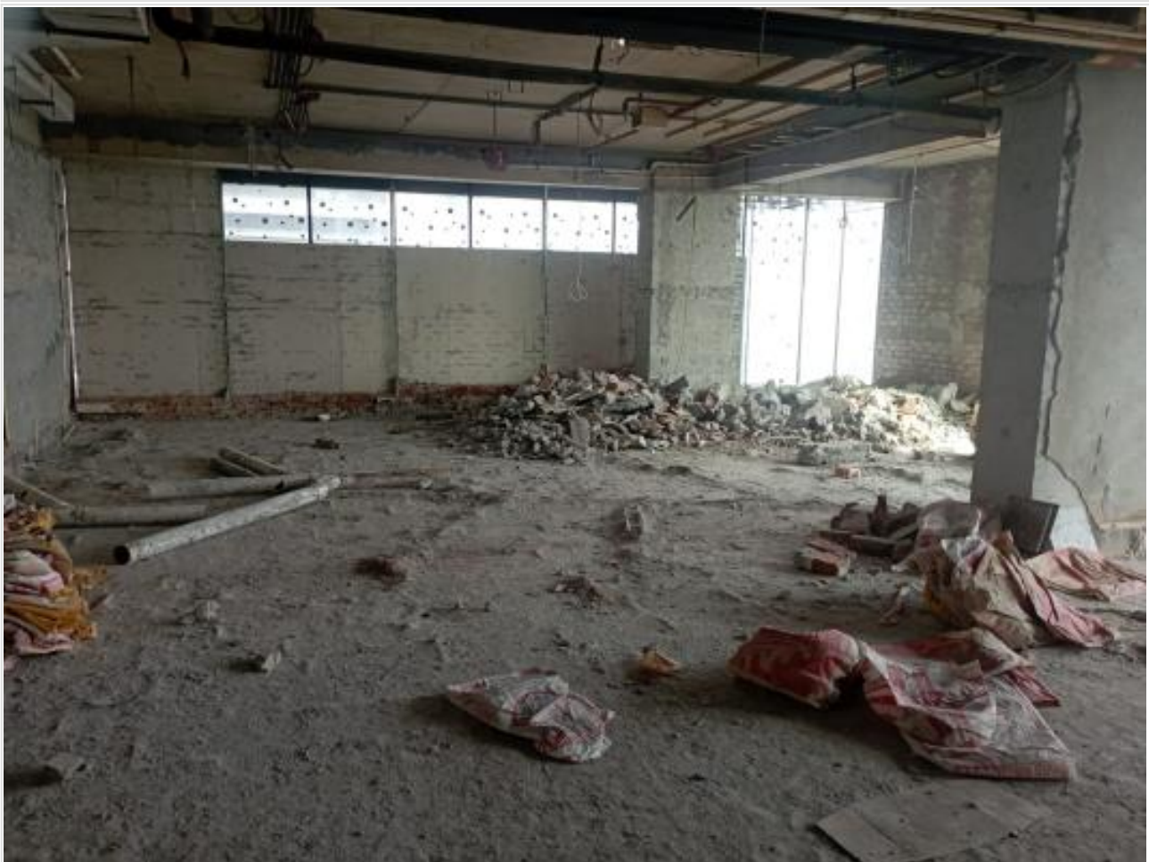
L-14-Kitchen Area on 24-10-23