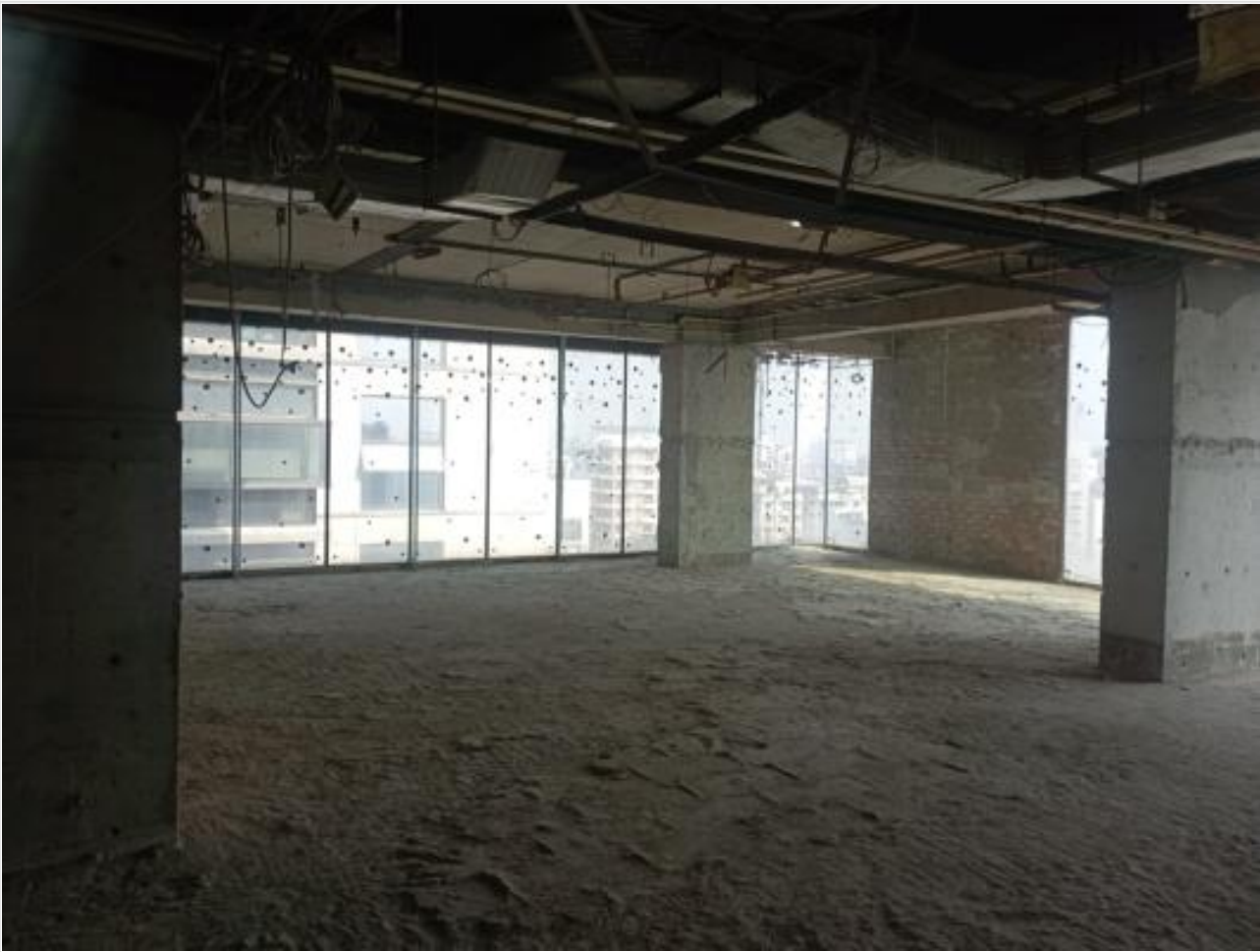
L-14-Old Kitchen Area on 28-10-23