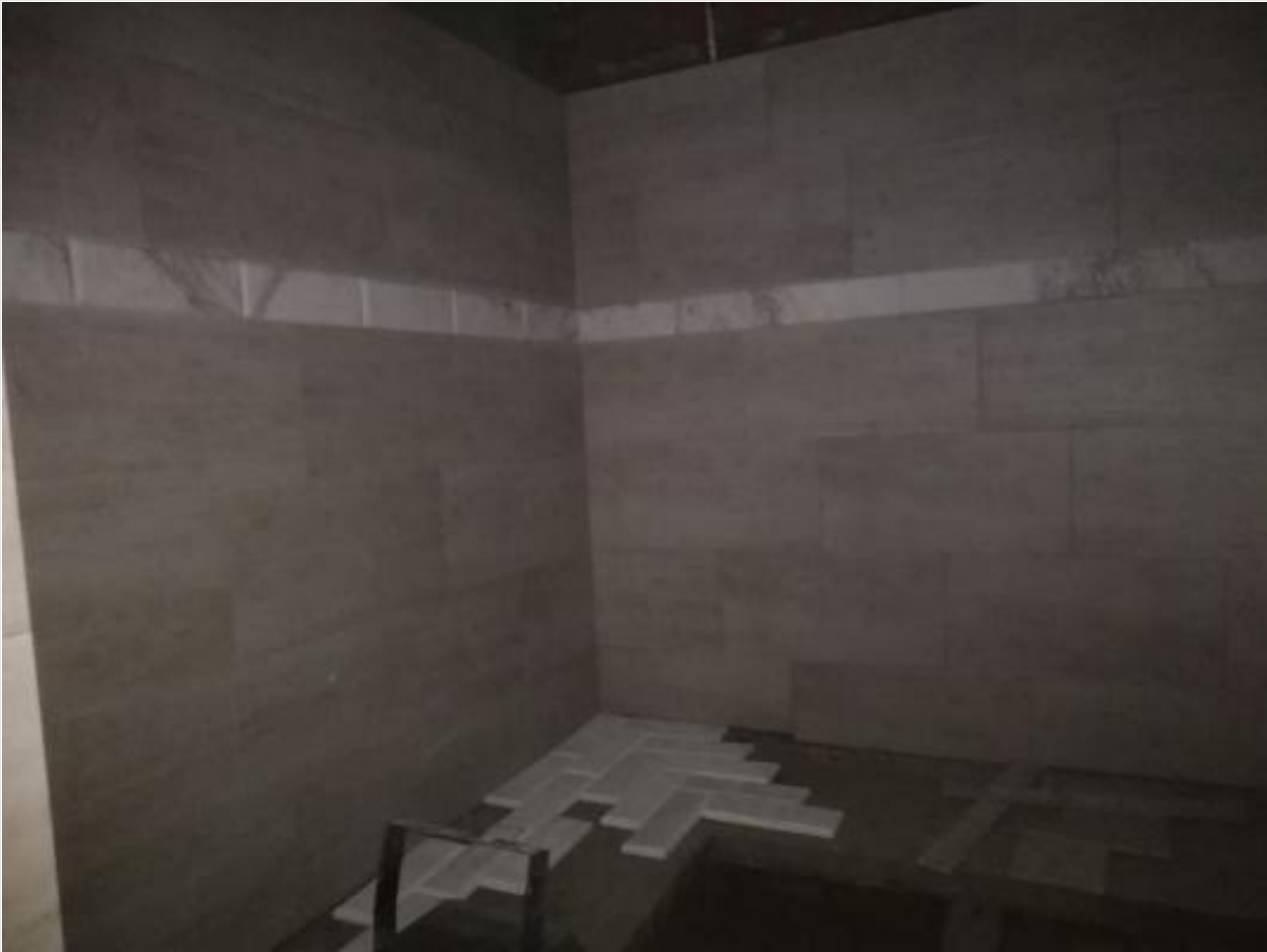
L-11-Steam-Tile/Marble Work on 17-12-23