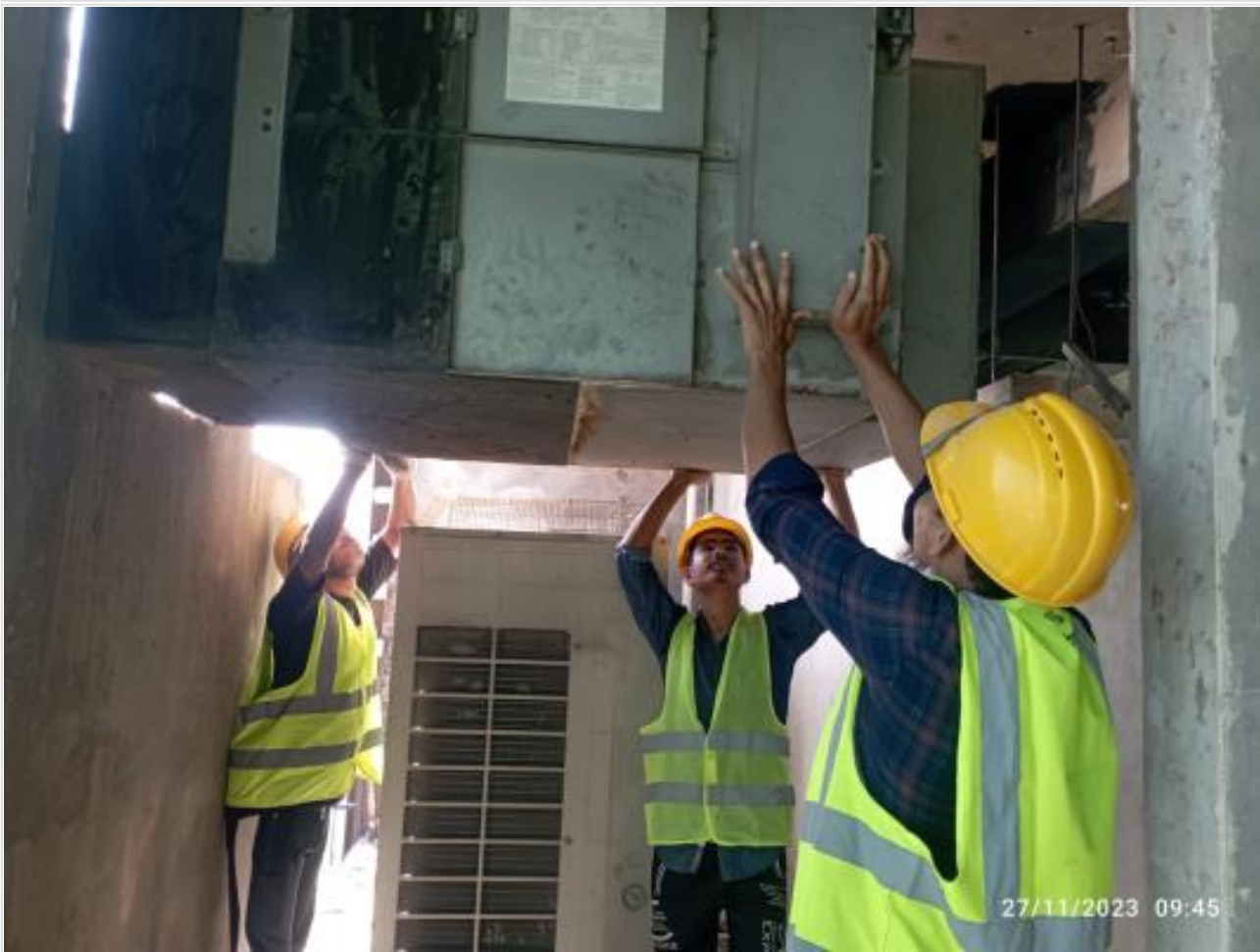
L-14-AC Installation on 27-11-23