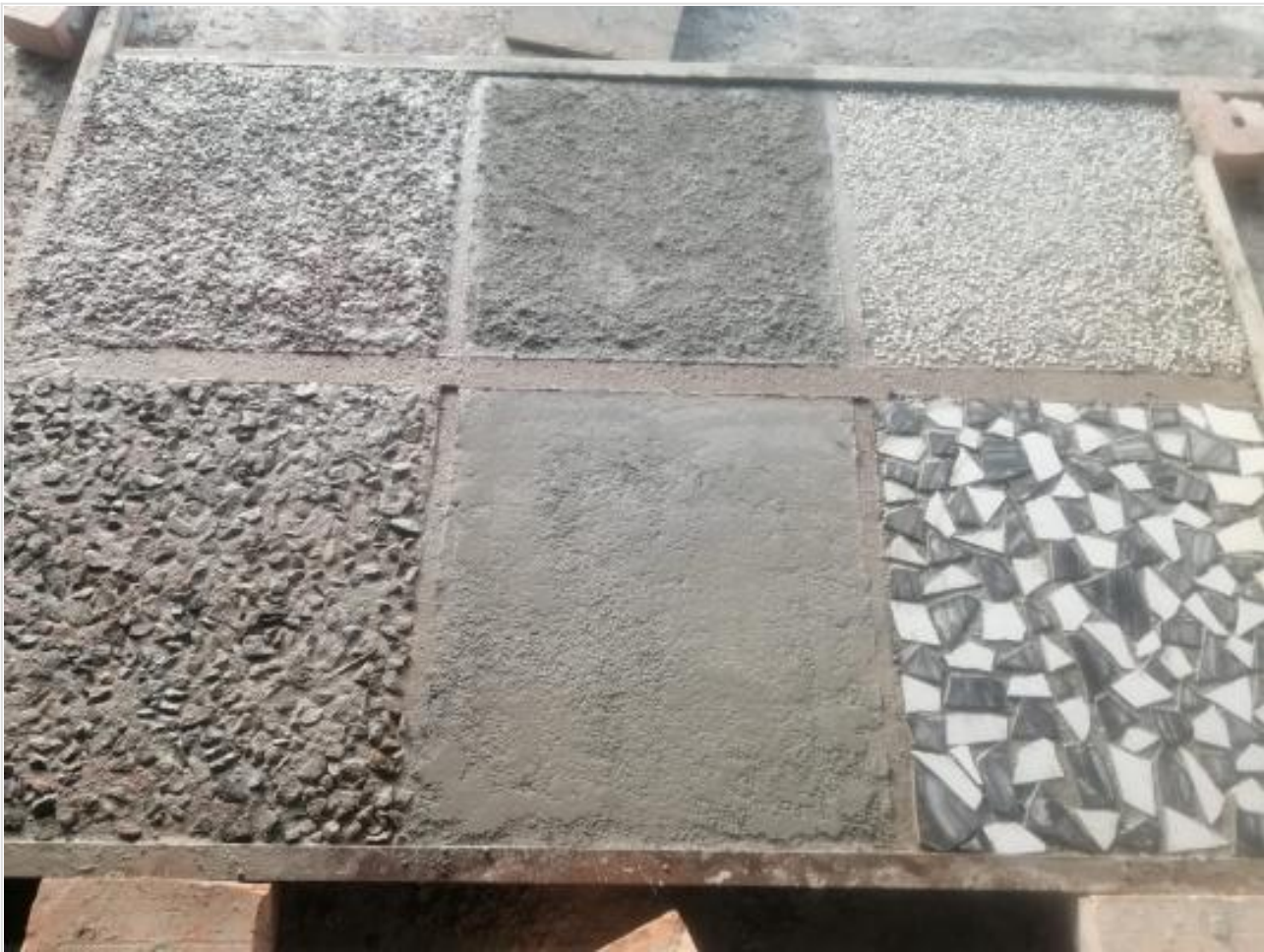
L-14-NCF Mock-up on 22-11-23