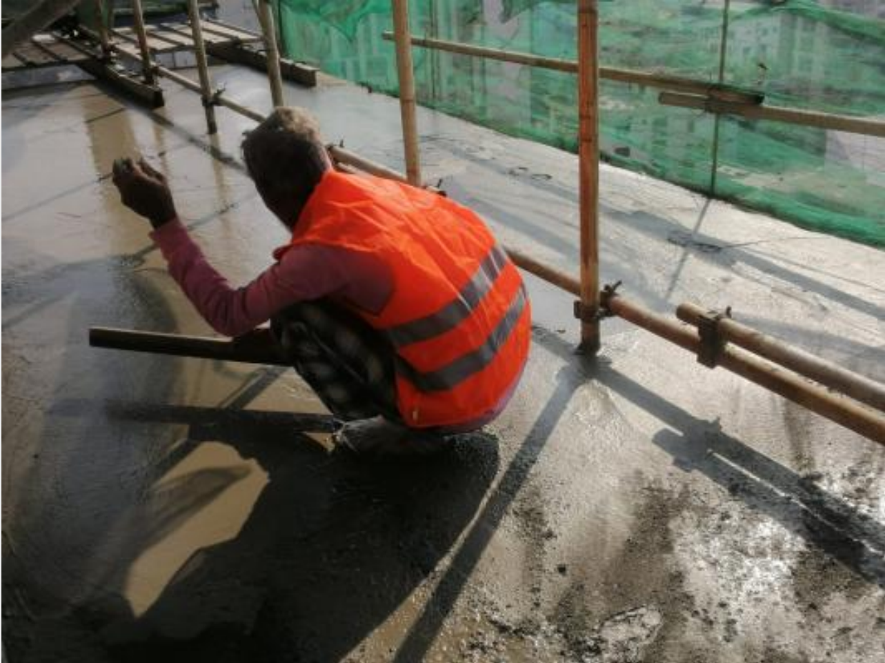
L-15-Floor CC with NCF on 28-01-24