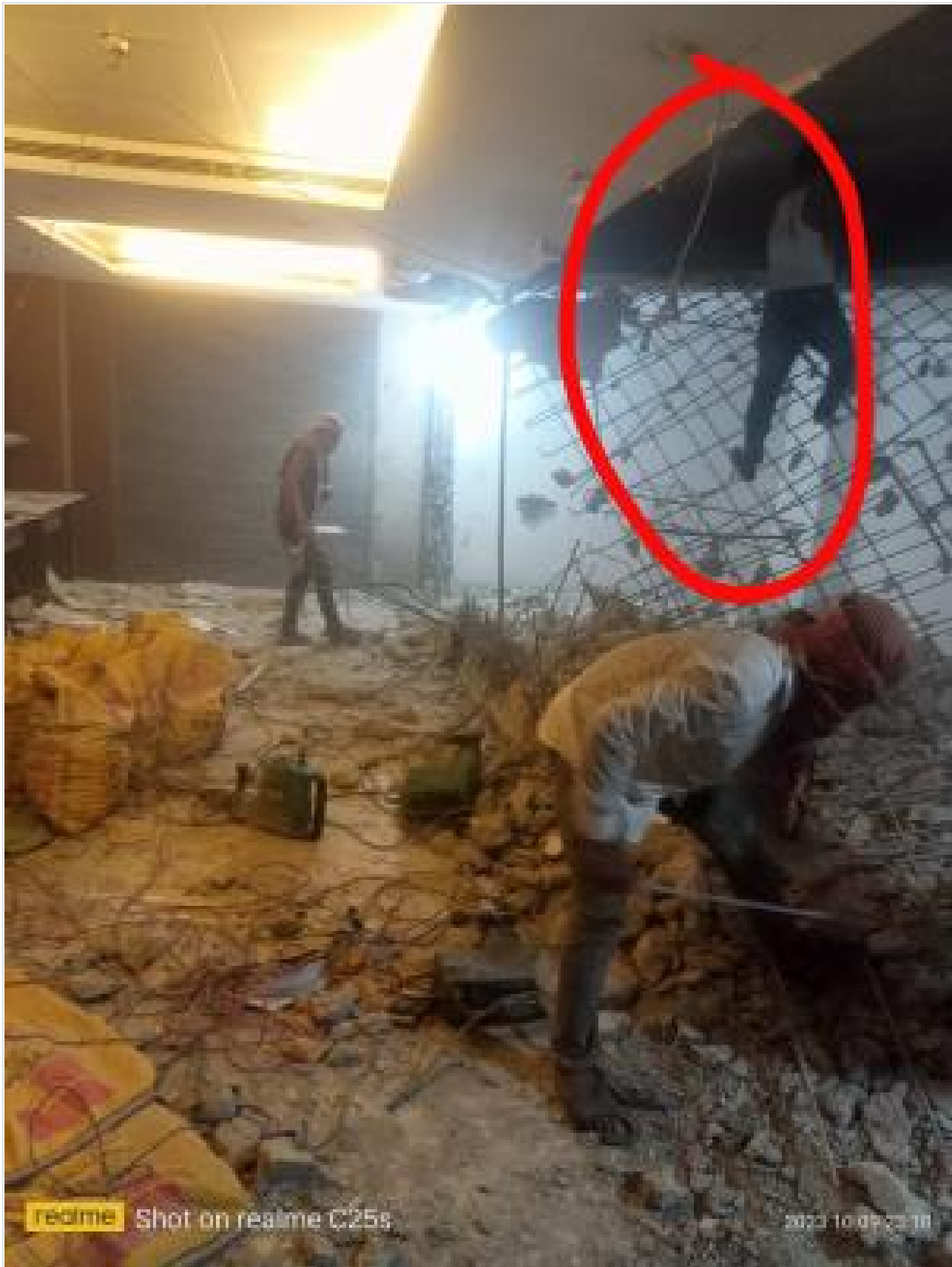
L-4-North Vault dismantling on 09-10-23