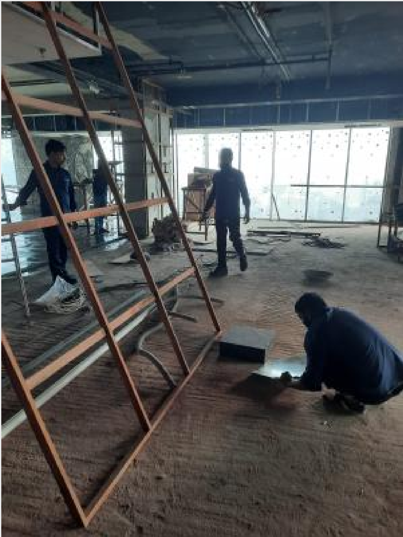
L-14-Electrical work on 10-01-24