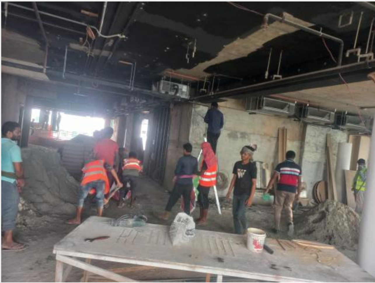
L-16-Materials Removal on 29-11-23