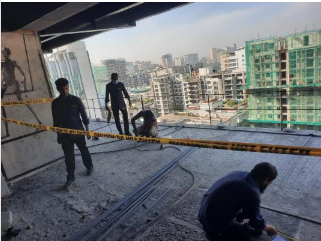
L-14-Electrical Pipe Laying on 27-11-23