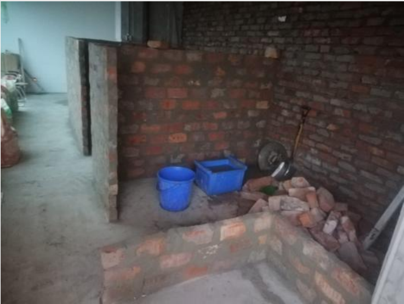
L-11-Steam-Suana-Brick-work on 04-12-23