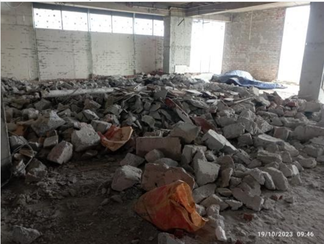
L-14-Kitchen Floor Area on 18-10-23