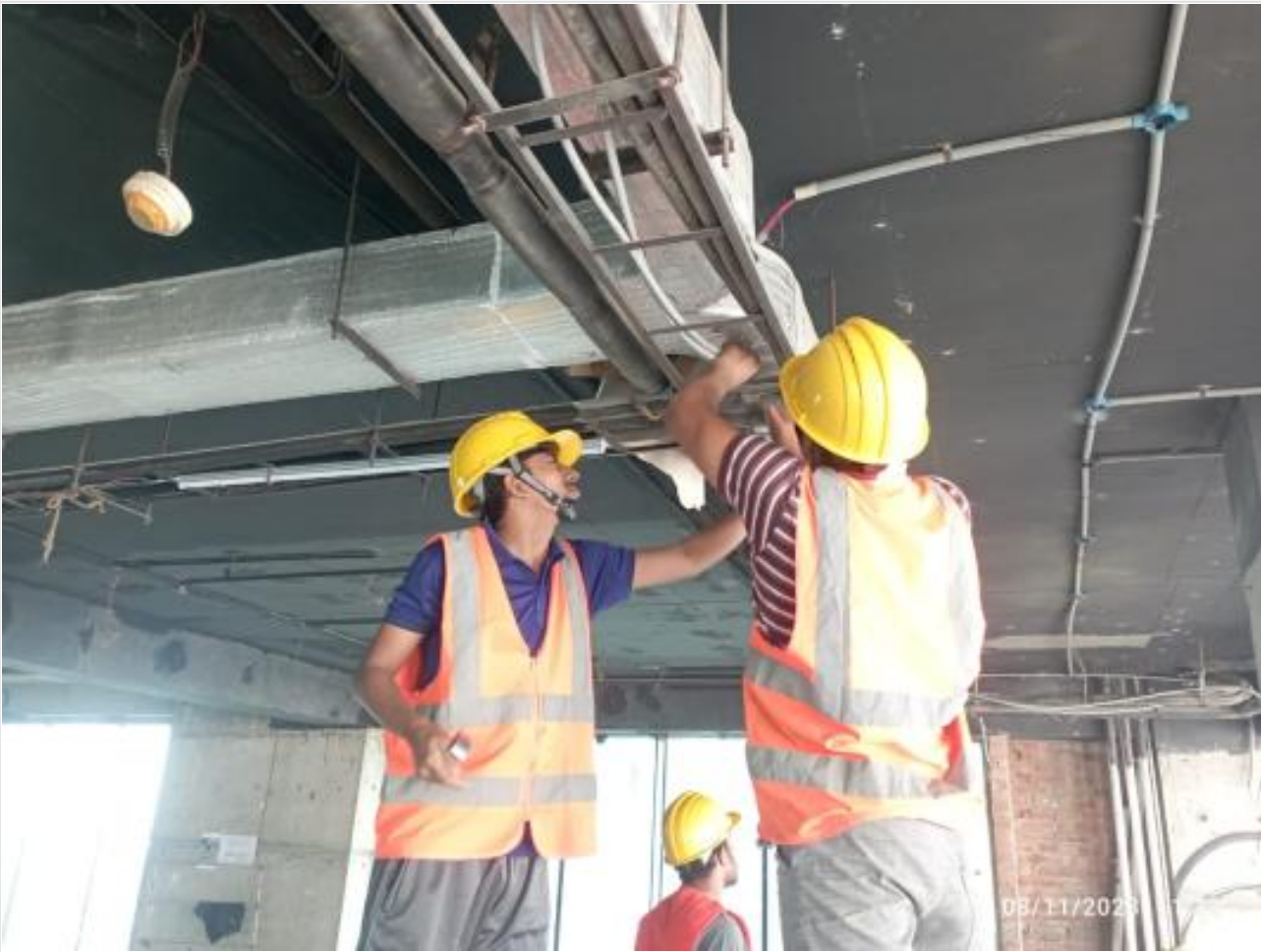
L-14-Old AC Duct Removing on 08-11-23