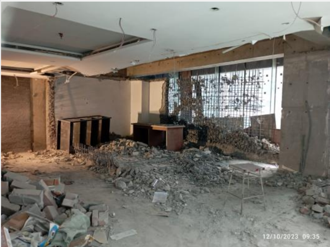
L-4-North Vault dismantling on 11-10-23