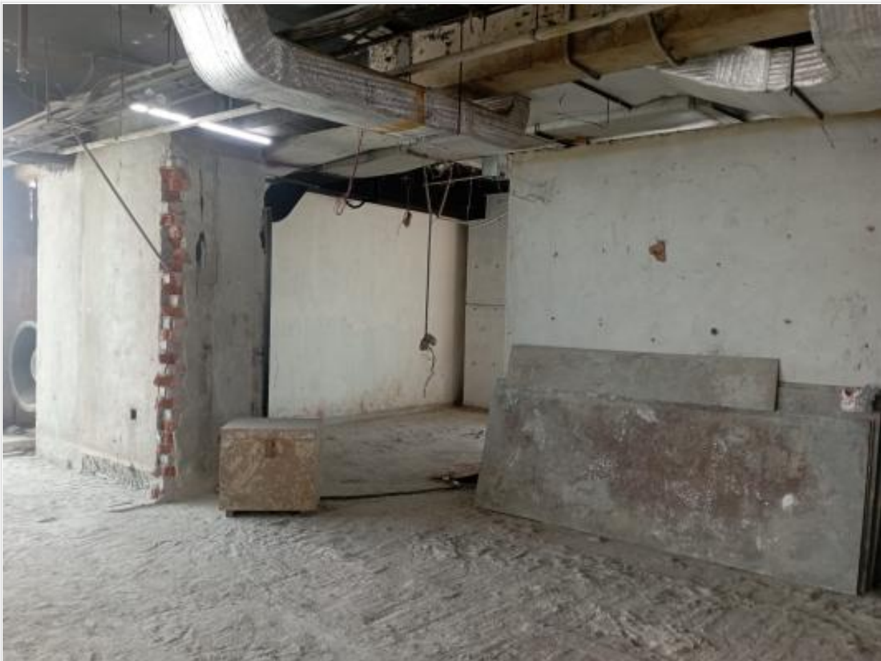
L-14-Old Kitchen Area on 28-10-23