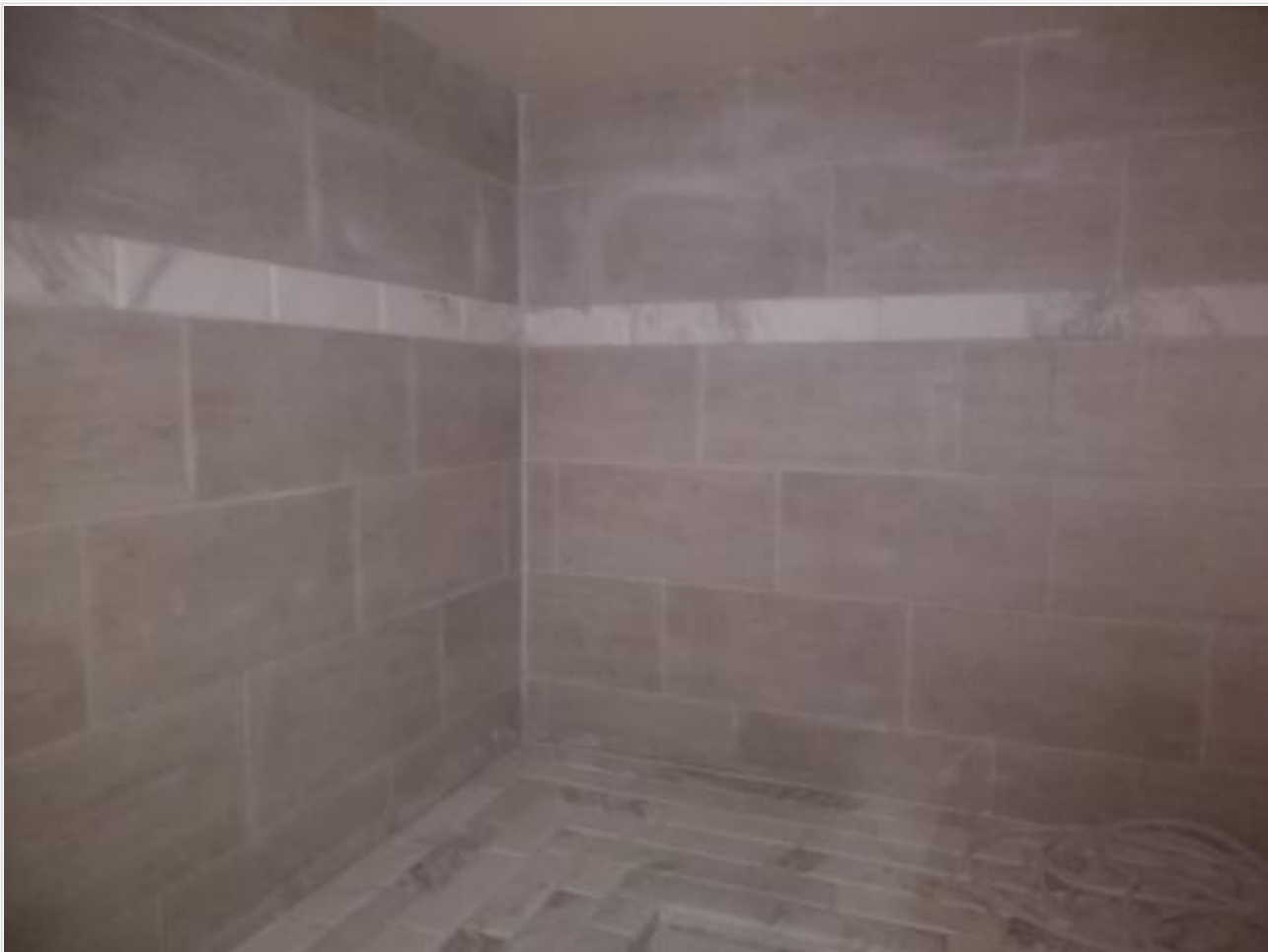
L-11-Steam-Suana-Marble rectification on 10-01-24