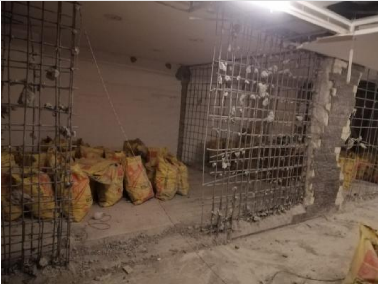
L-4-North Vault dismantling on 07-10-23