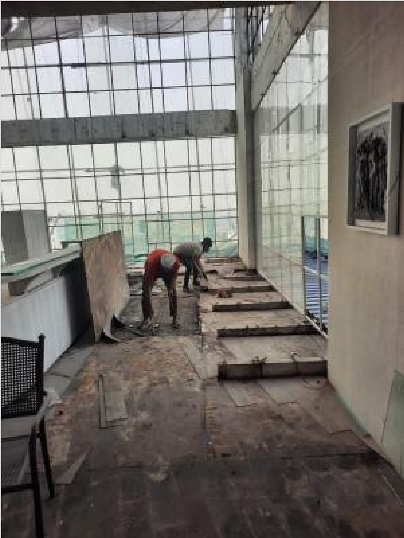
L-15-Wooden Floor dismantling on 26-12-23