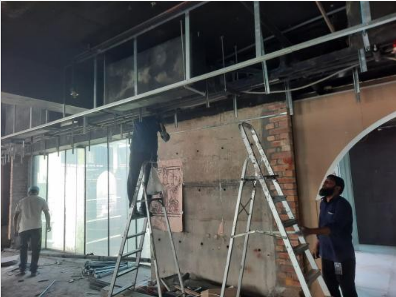
L-11-Electrical wiring on 20-12-23