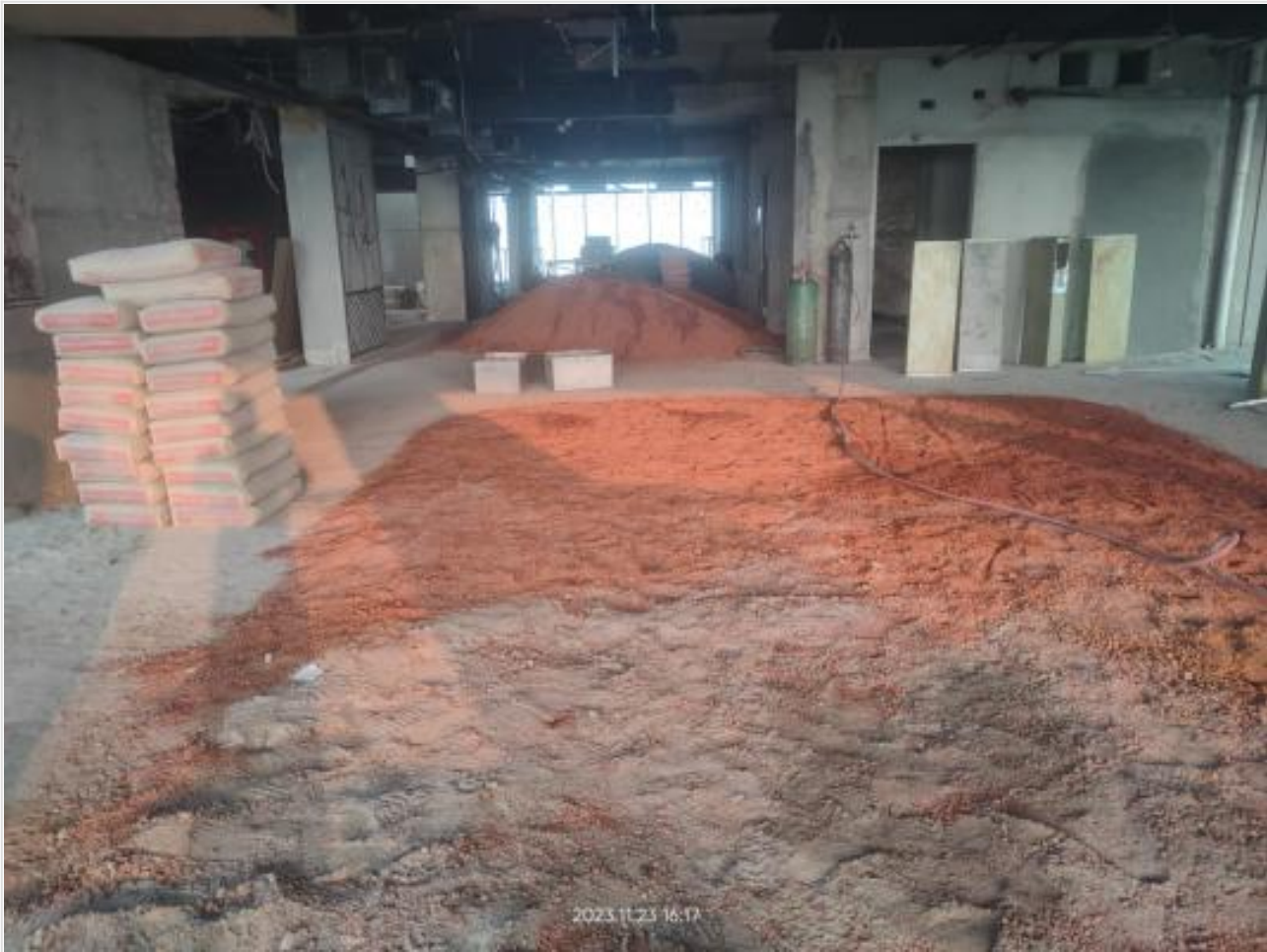
L-14-NCF Material procured on 23-11-23