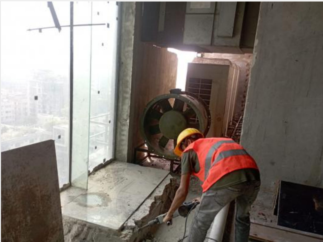
L-14-Old Kitchen Floor Dismantling on 25-10-23