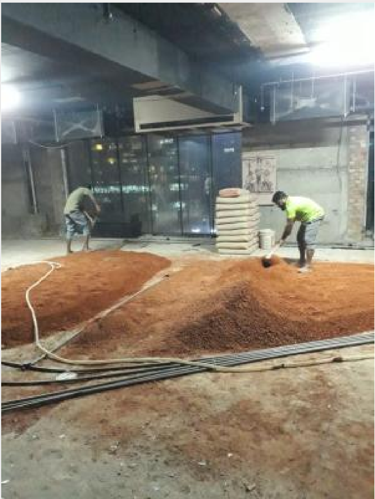
L-14-NCF Work start at night on 30-11-23