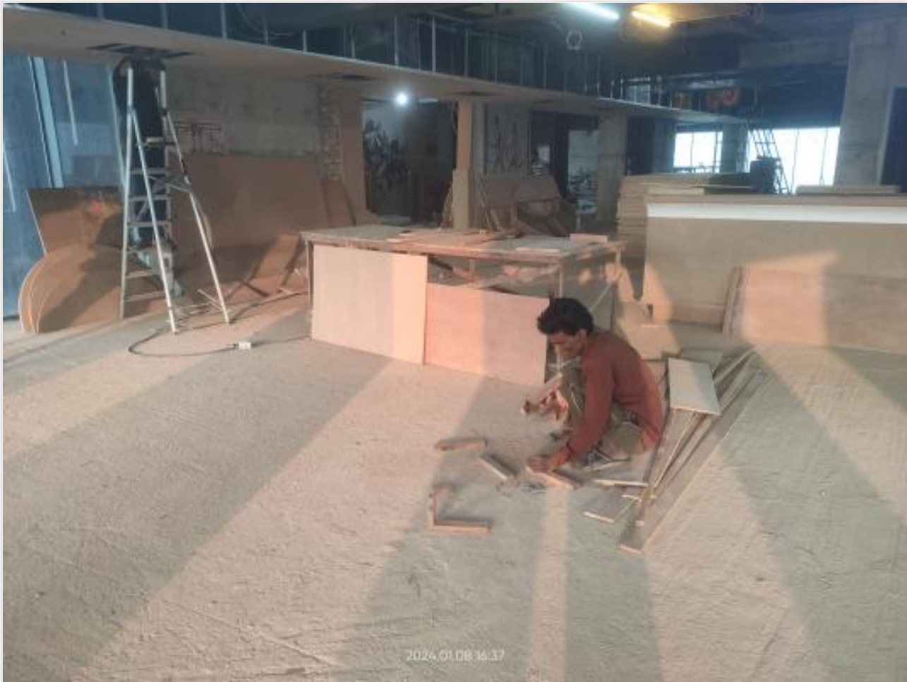
L-14-False Ceiling Work on 08-01-24