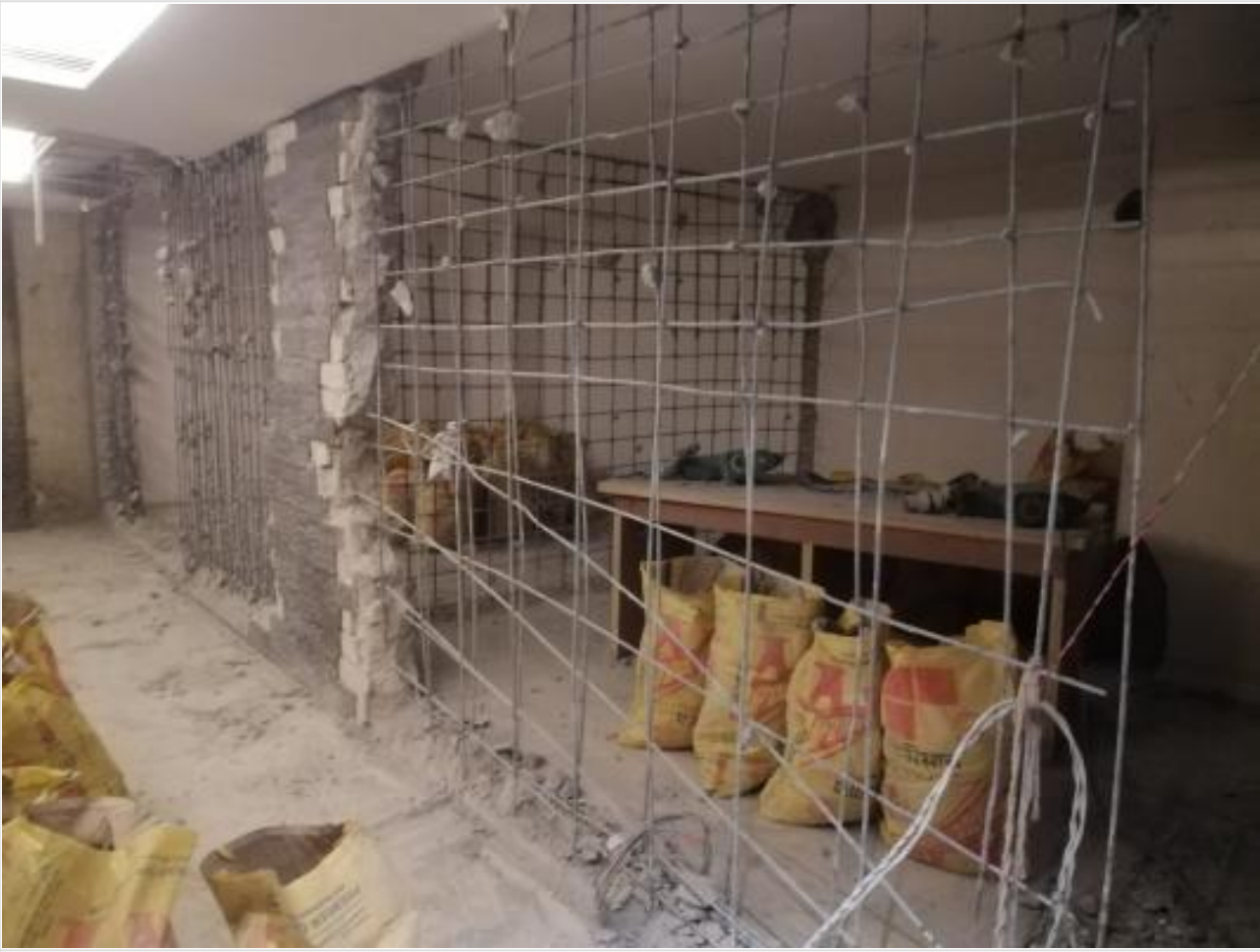
L-4-North Vault dismantling on 07-10-23