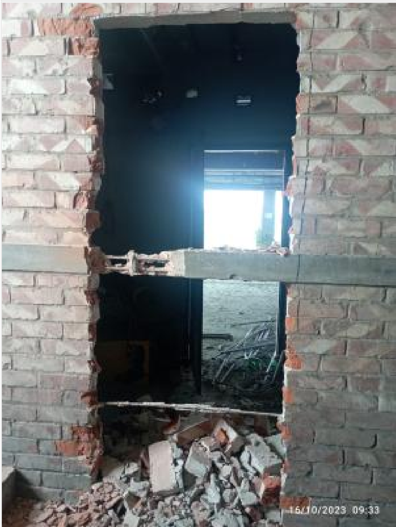
L14-Starcase-South-Door Cutting on 15-10-23