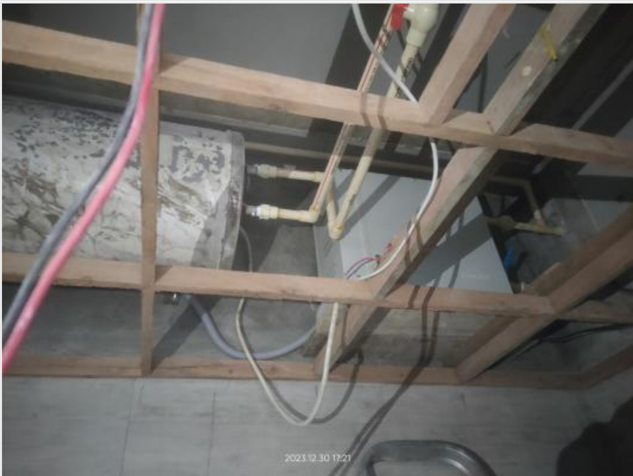
L-11-Steam machine installation on 30-12-23