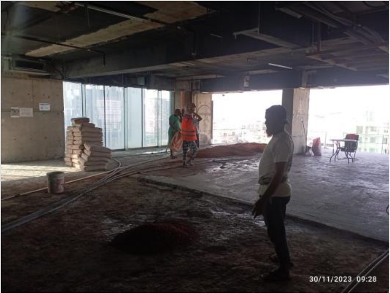
L-14-Floor NCF Work on 30-11-23