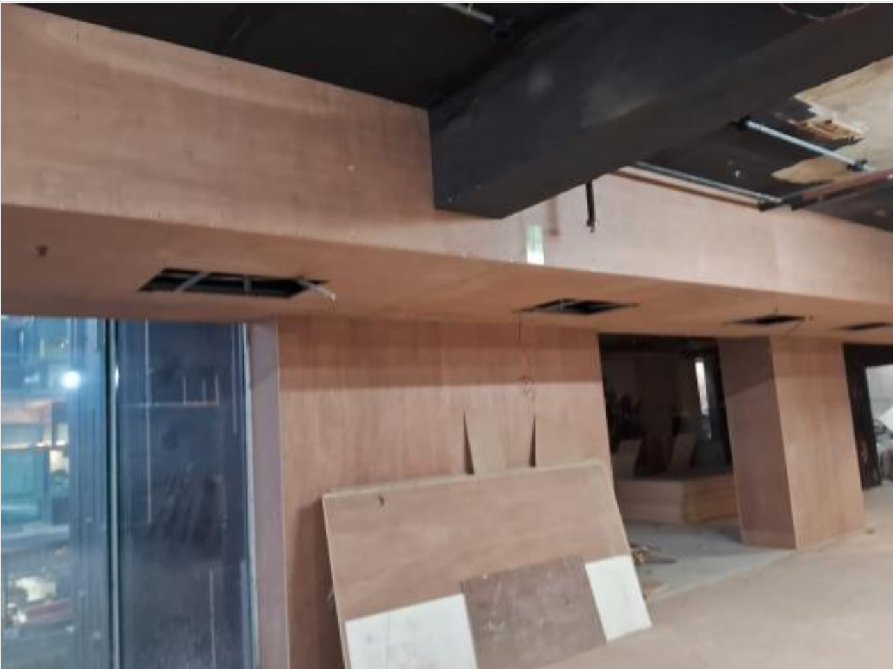
L-14-False Ceiling and Interior on 22-01-24