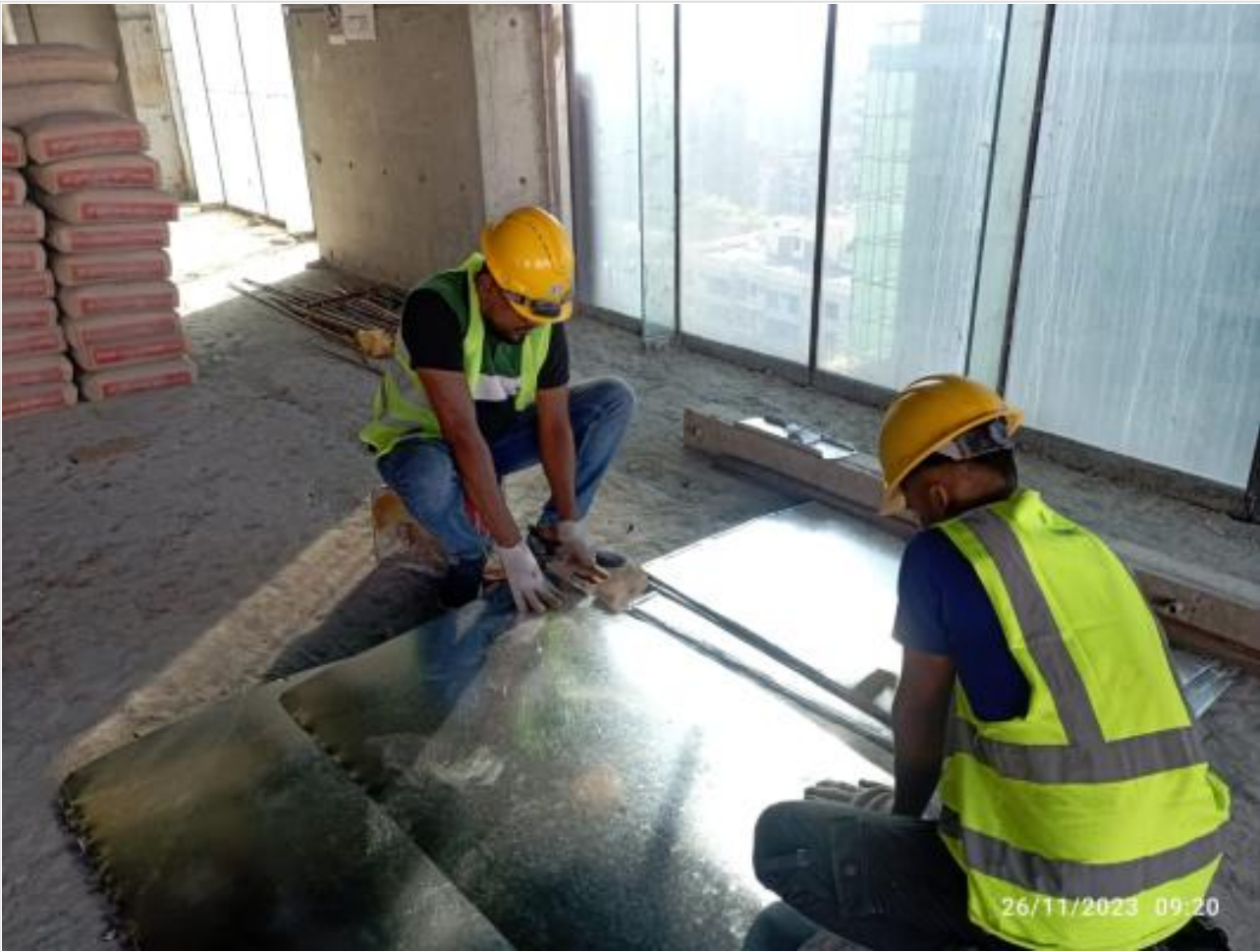
L-14-AC Duct fabrication on 26-11-23