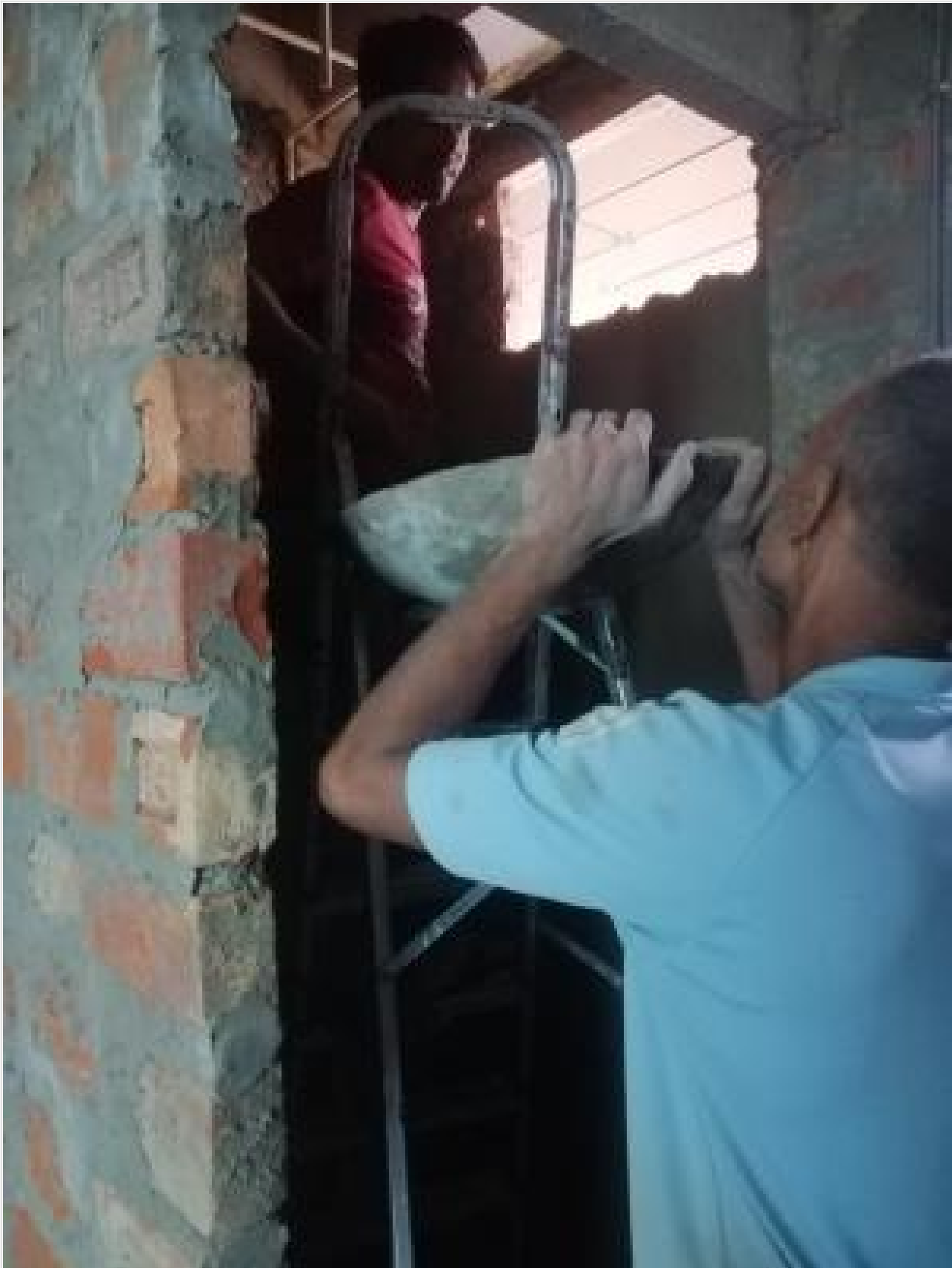
L-11-Steam-Suana-Plastering on 12-12-23