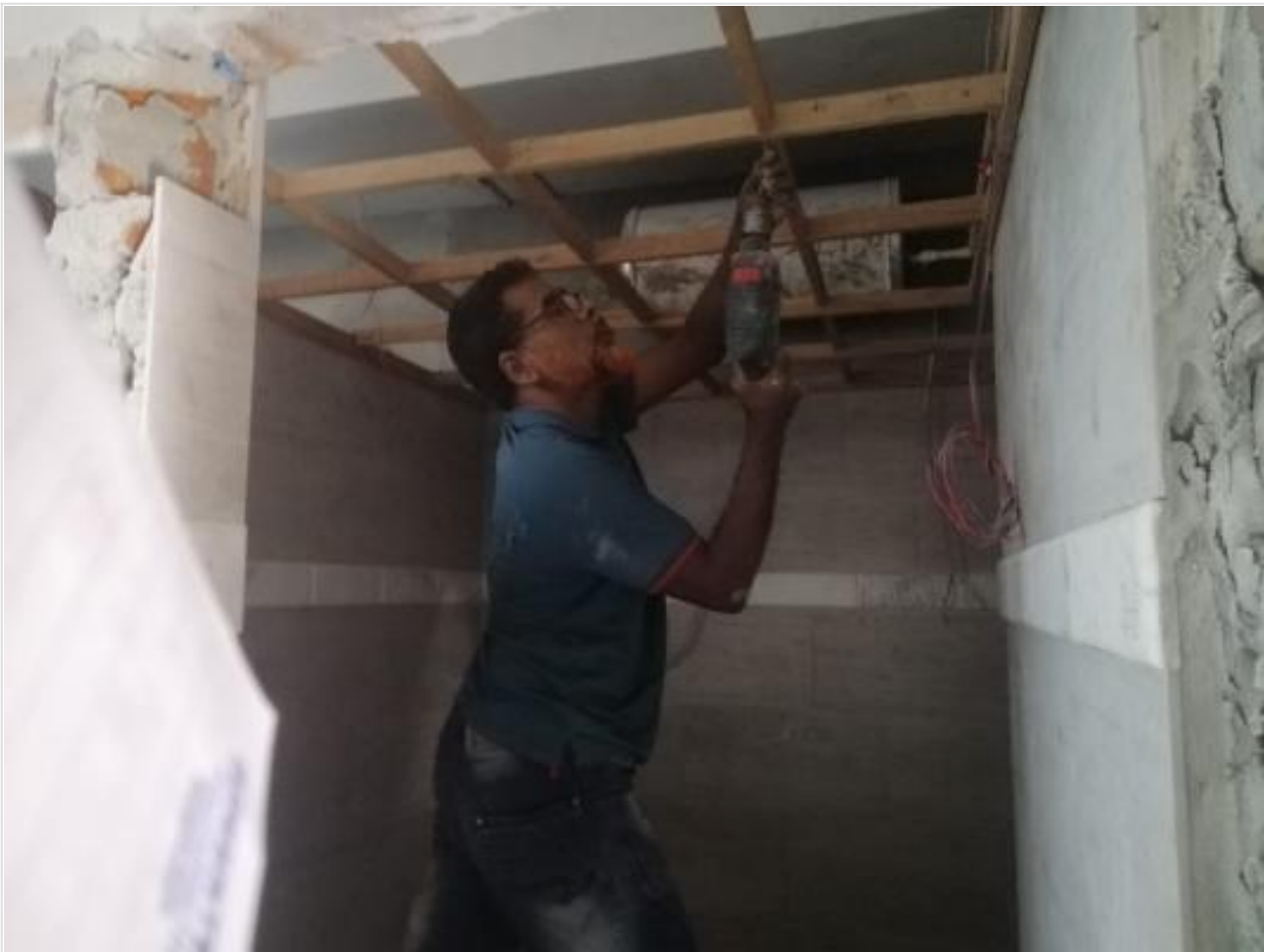
L-11-Steam-Suana-False Ceiling on 28-12-23