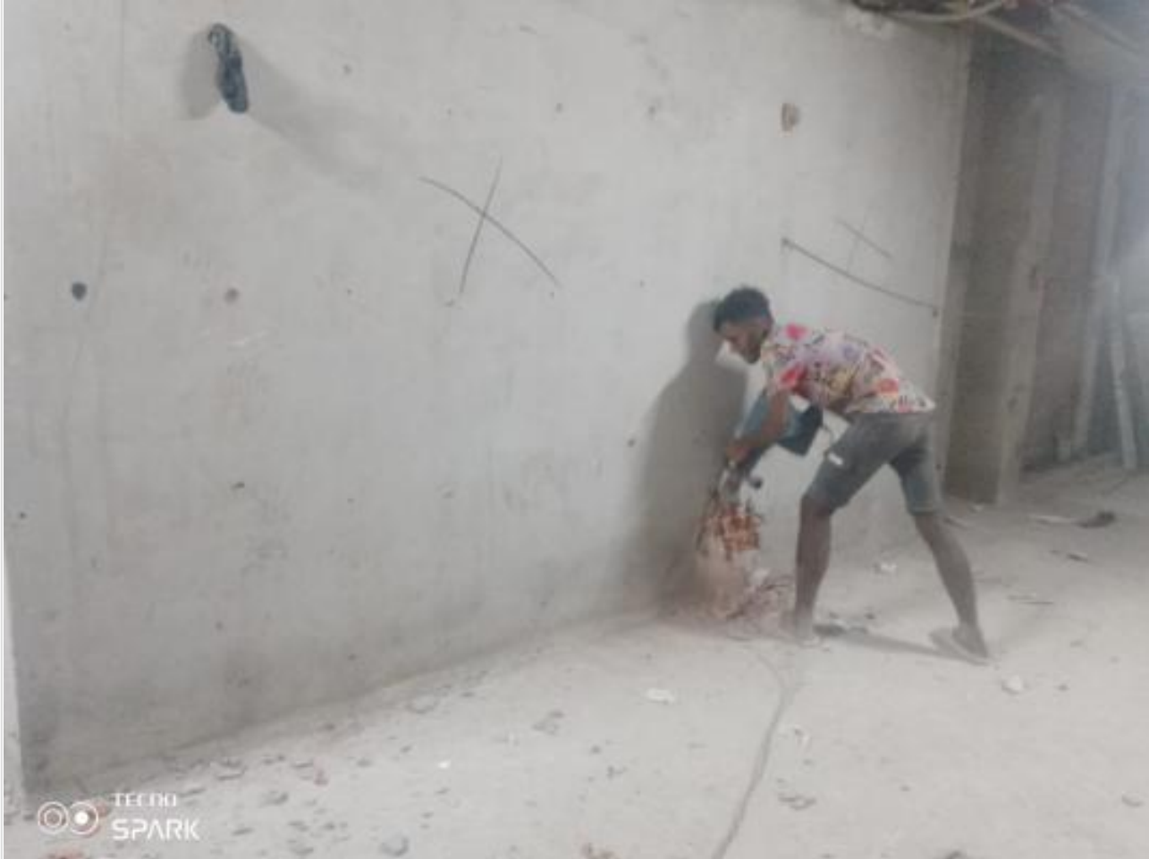
L-14-East-South Wall dismantling on 17-10-23