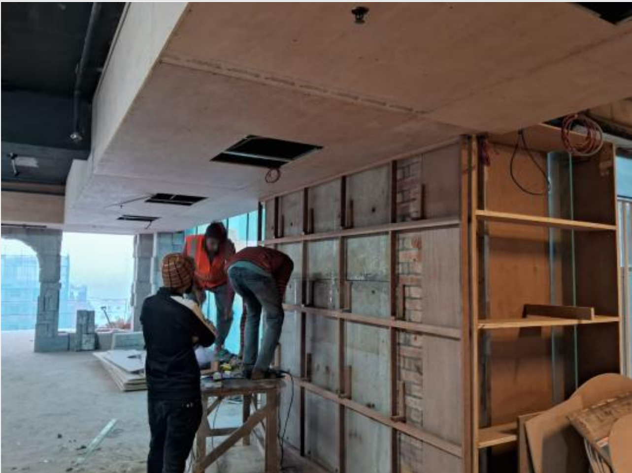
L-14-False Ceiling Work on 17-01-24