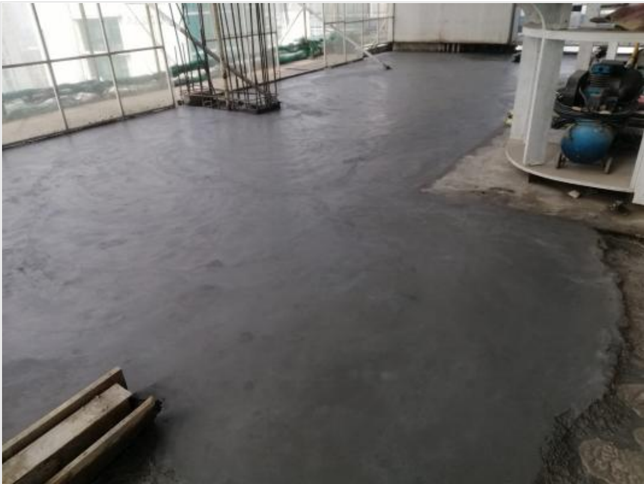
L-14-Floor CC with NCF on 26-01-24