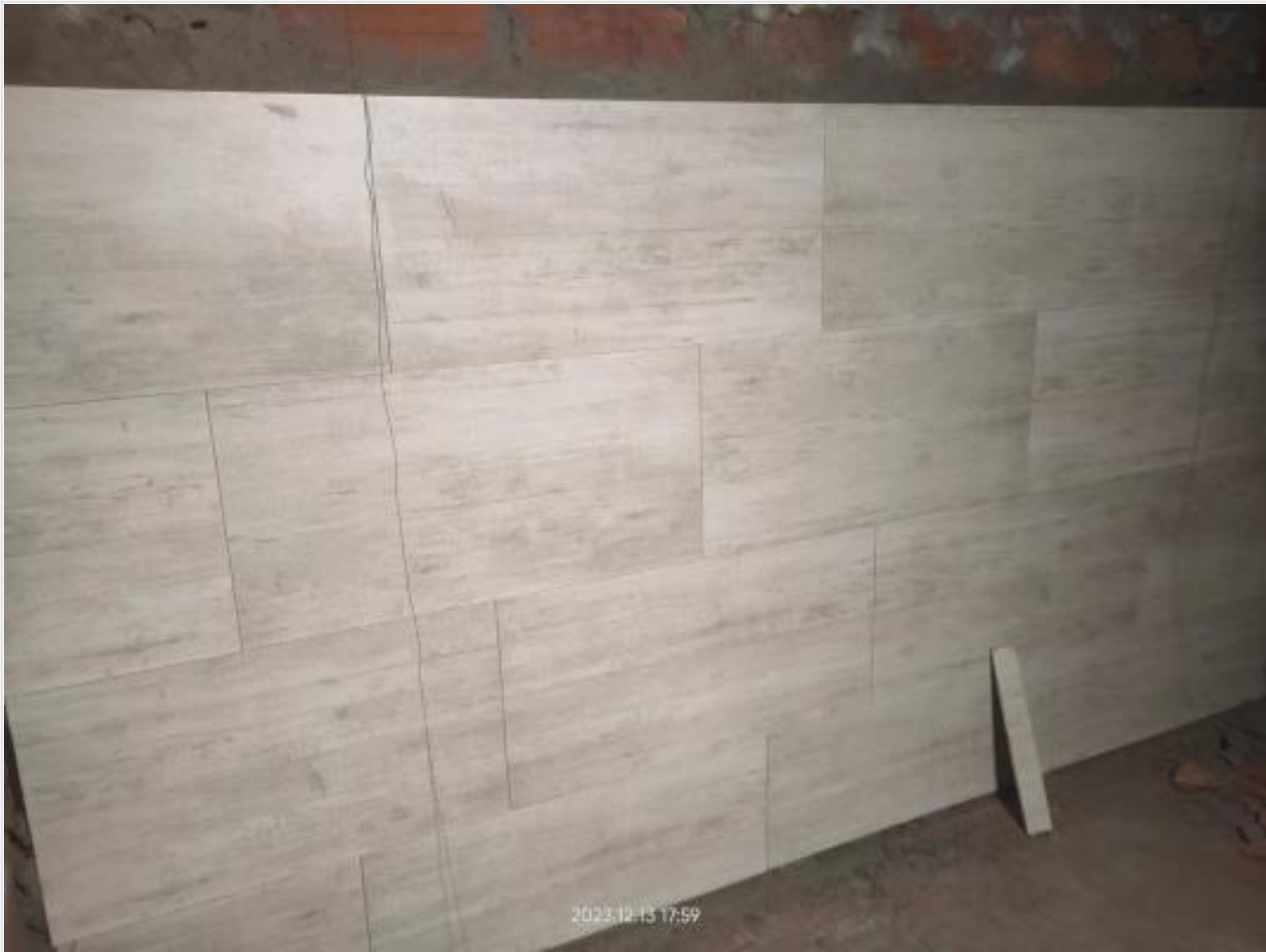
L-11-Steam-Wall tile fixing on 13-12-23