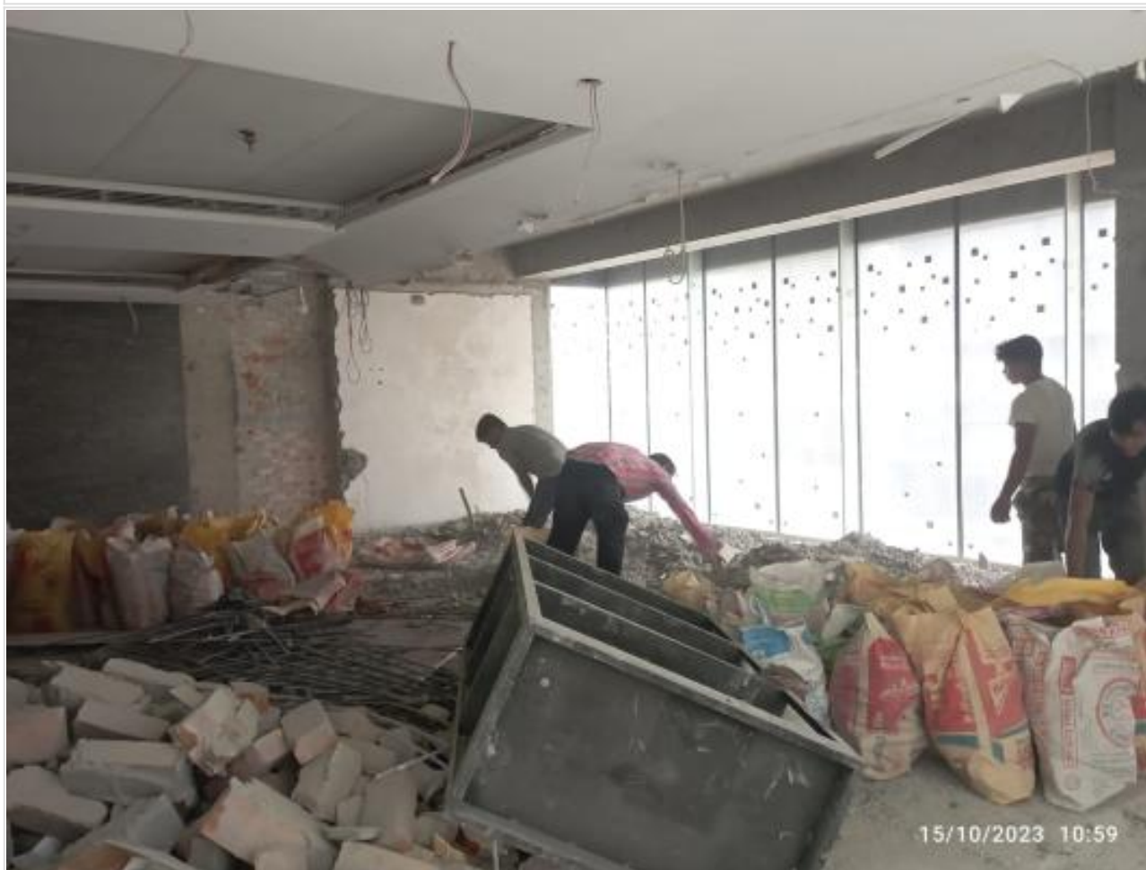
L-4-North-East Vault demolition complete on 14-10-23