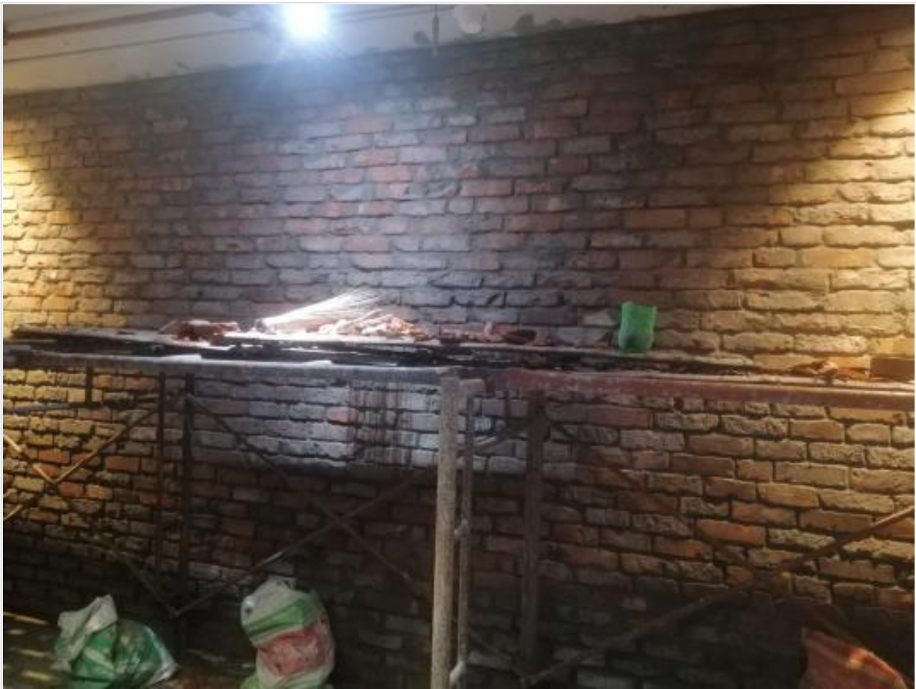
L-11-Steam-Suana-Brick-work on 03-12-23