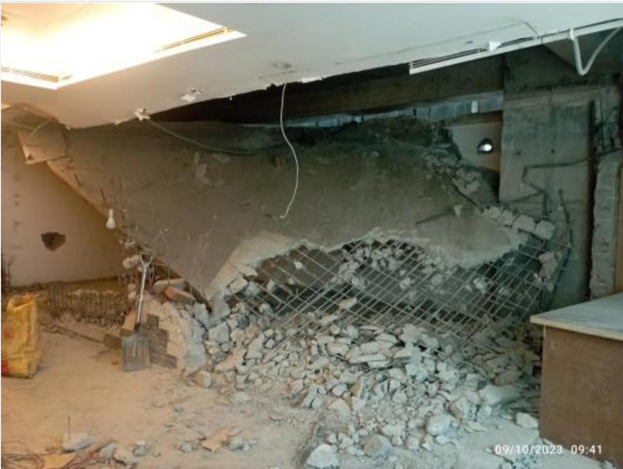
L-4-North-East Vault dismantling on 08-10-23