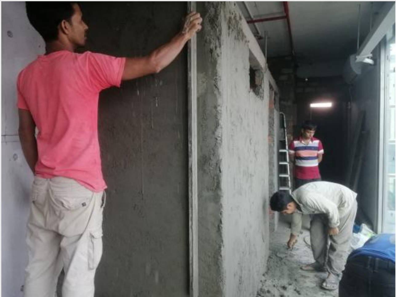
L-11-Steam-Suana-Plastering on 10-12-23