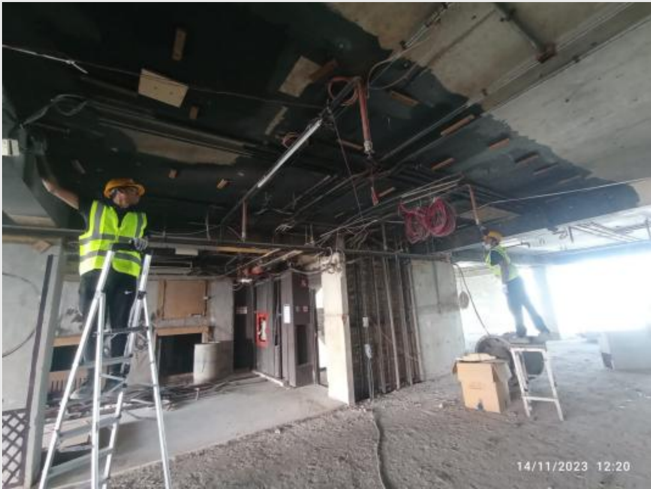
L-14-AC installation on 14-11-23