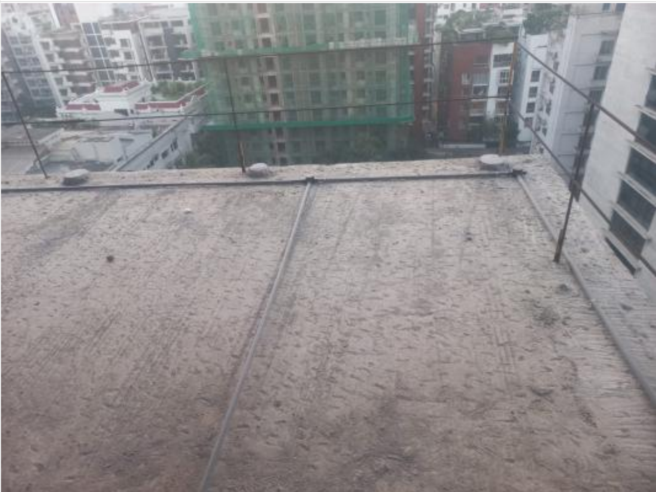
L-14-Electrical Pipe Laying on 26-11-23