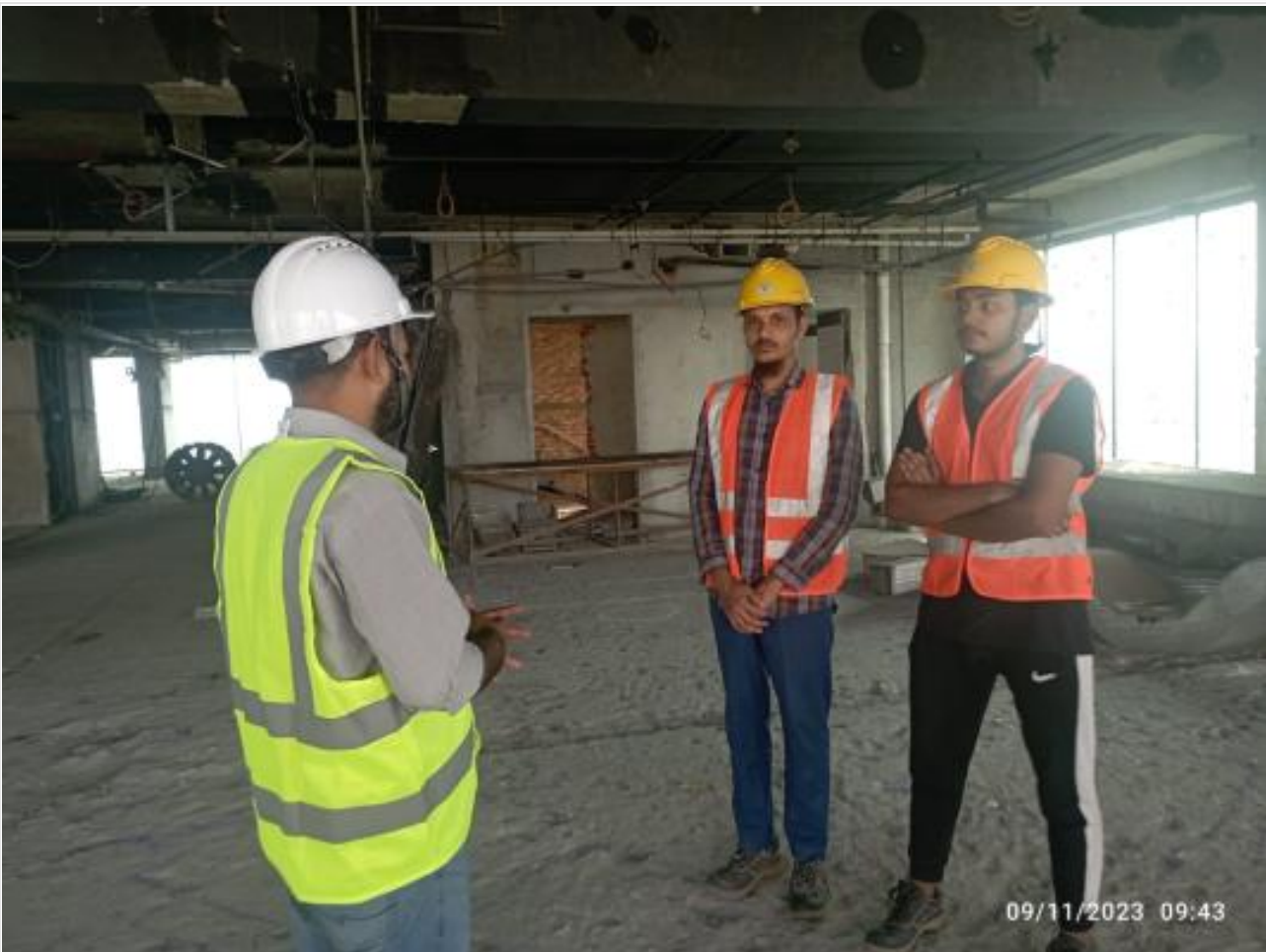
Tool-box Meeting on 09-11-23