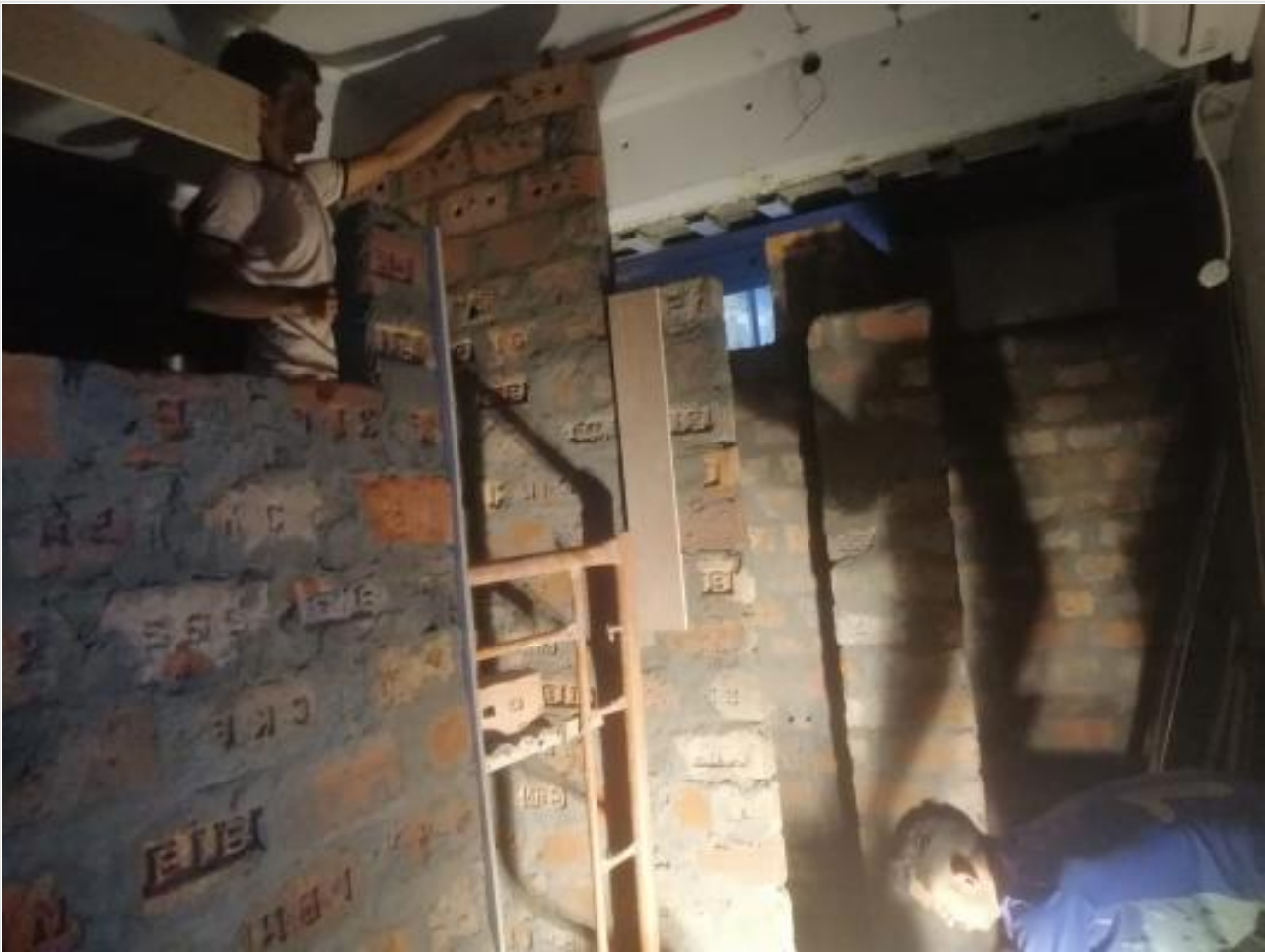
L-11-Steam-Suana-Brickwork on 07-12-23