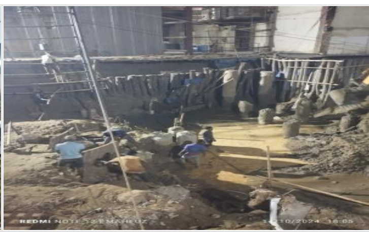
Shoring on 14-10-24

Earth excavation on 14-10-24 Site Desription Wooden pile driving 41 nos. Site Instruction