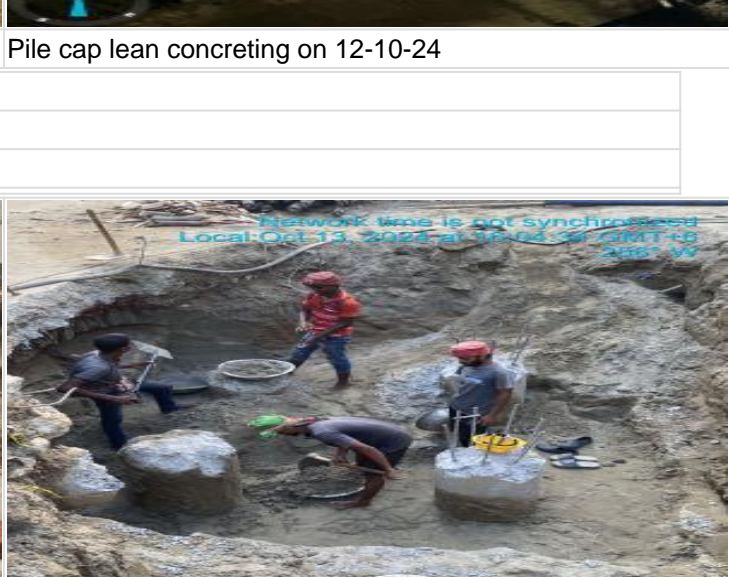
Earth excavation manually on 13-10-24