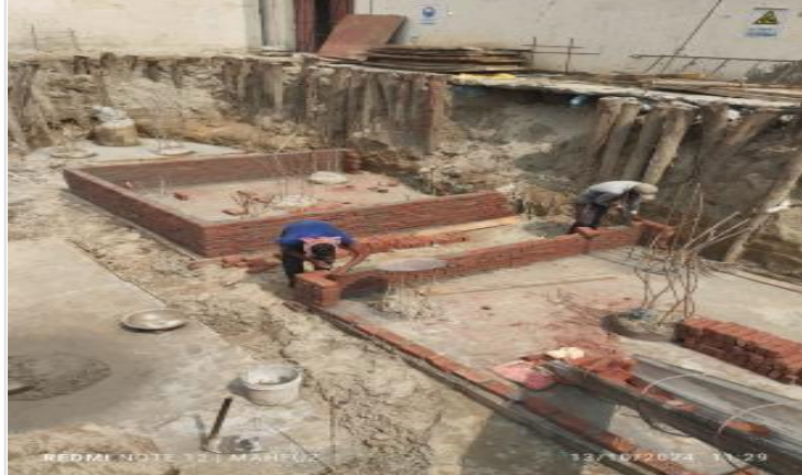
Pile cap side brick shuttering on 13-10-24 Site Desription Wooden shore piling 14 nos. Site Instruction

Checking before pile cap lean concreting on 12-10-24 Site Desription Due to rain work started late Site Instruction