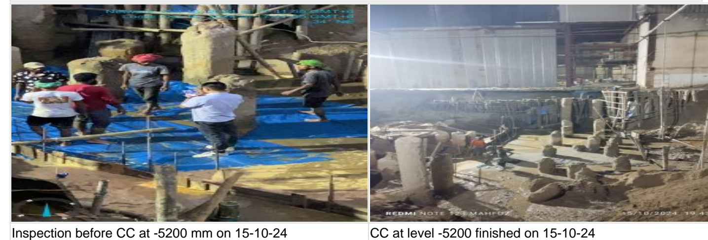
Inspection before CC at -5200 mm on 15-10-24 Site Desription Site Instruction

Earth excavation on 14-10-24 Site Desription Wooden pile driving 41 nos. Site Instruction