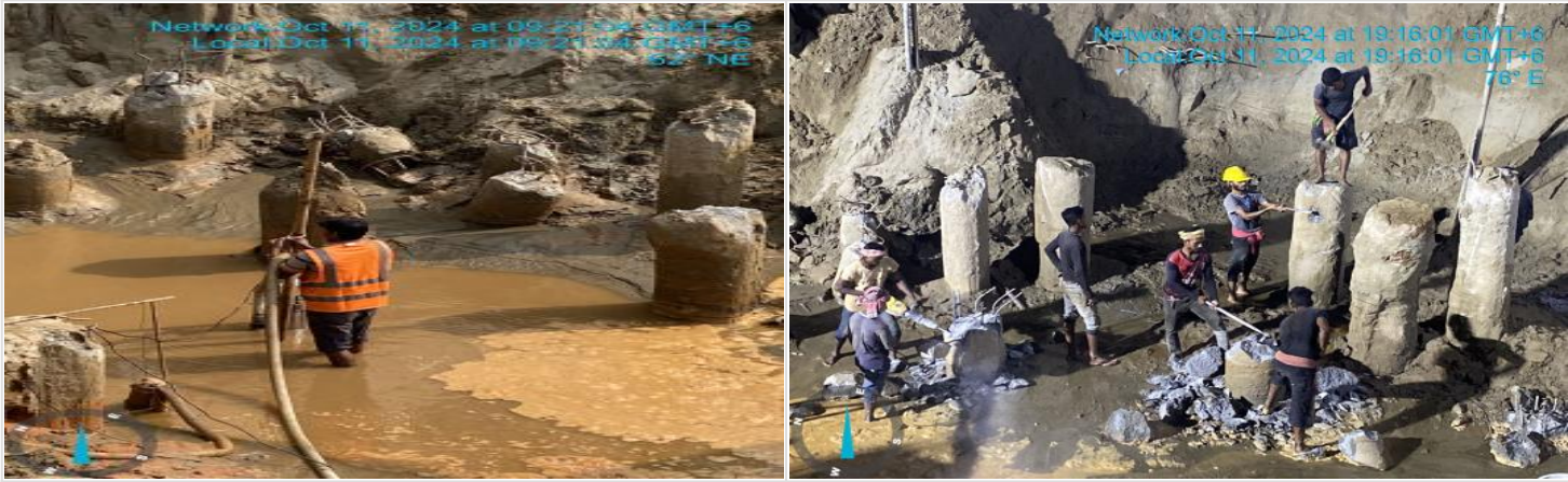
Pile head breaking on 11-10-24

Dewatering on 11-10-24 Site Desription Site Instruction