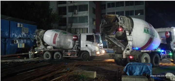
Ready mix car