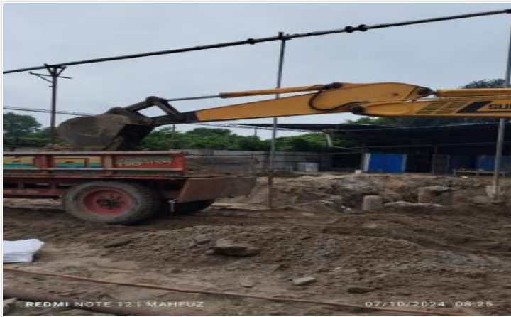
Earth excavation on 07-10-24