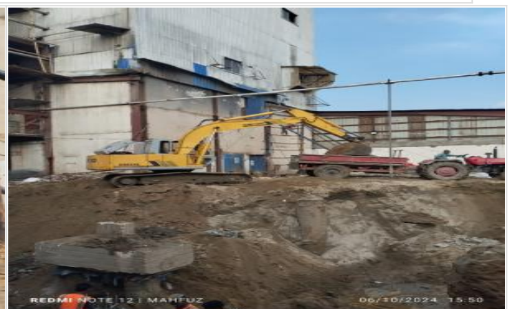
Wooden shore pile driving on 06-10-24