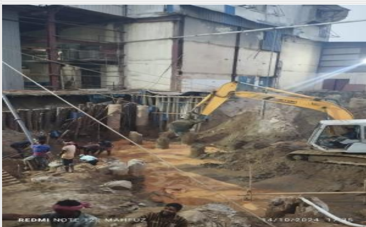
Earth excavation on 14-10-24