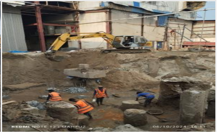
Pile head breaking on 07-10-24