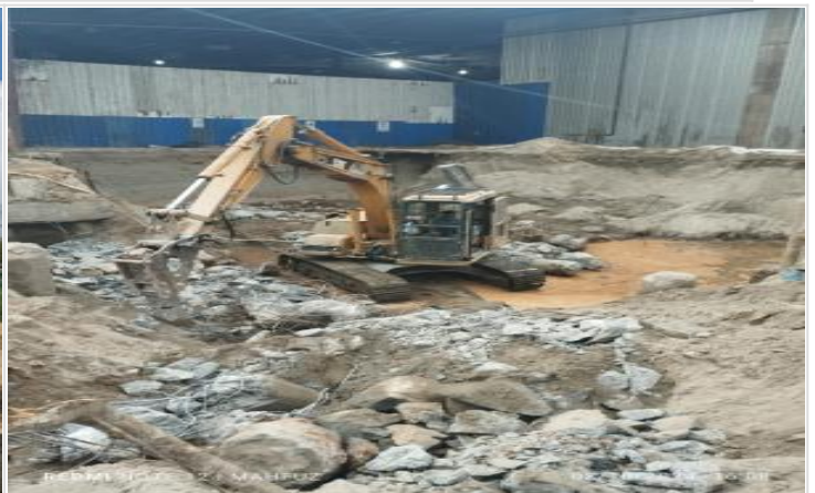
Dismantling by hydraulic breaker on 08-10-24