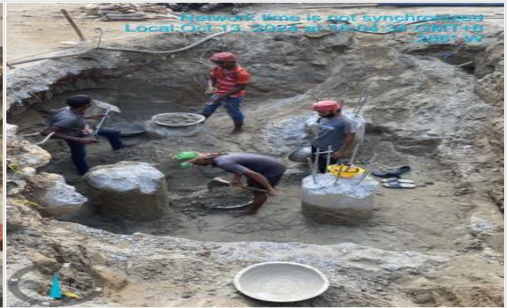
Earth excavation manually on 13-10-24