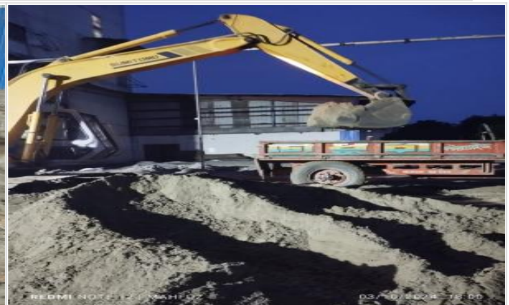
Obstacle RCC dismantling on 03-10-24