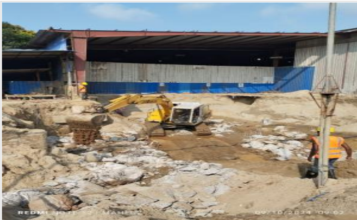
Earth excavation on 09-10-24