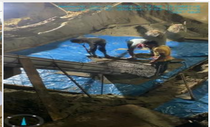
Checking before pile cap lean concreting on 12-10-24