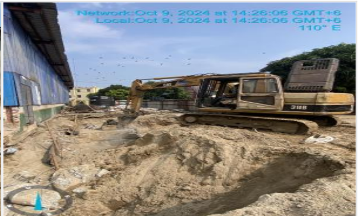
Old base dismantling by hydraulic hammer on 09-10-24