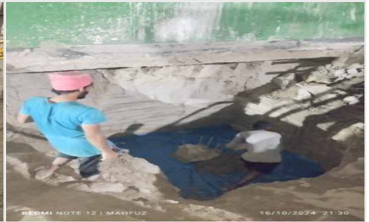
Excavation, brick-shuttering, steel shut on 16-10-24