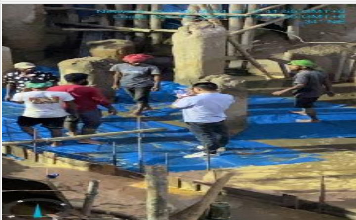
Inspection before CC at -5200 mm on 15-10-24