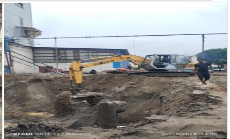
Old base breaking on 05-10-24