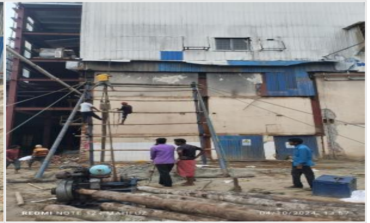
Pile Head breaking on 04-10-24