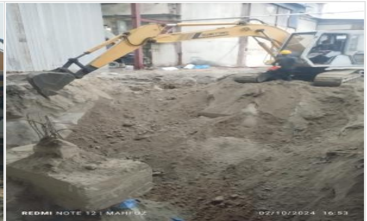
Earth excavation on 02-10-24