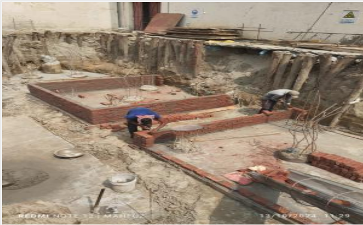
Pile cap side brick shuttering on 13-10-24