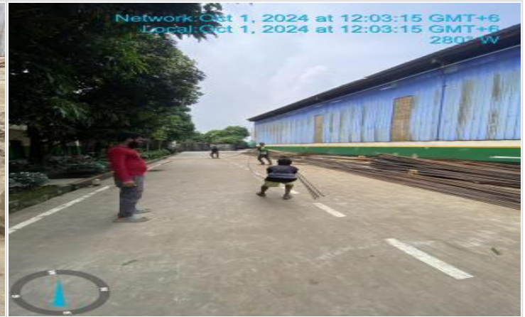
Earth excavation on 01-10-24