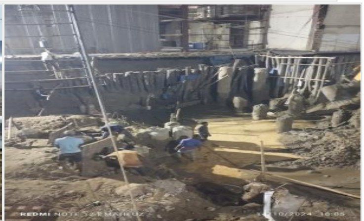
Shoring on 14-10-24