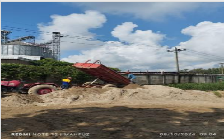
Excavated earth dumping on 08-10-24