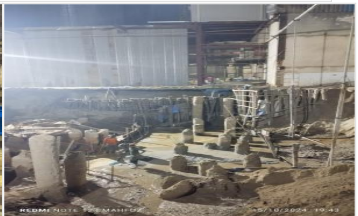
CC at level -5200 finished on 15-10-24