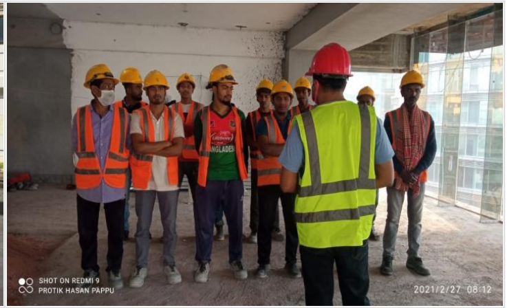
Rubish shifting to BTT, Purbachal on 28-02-21