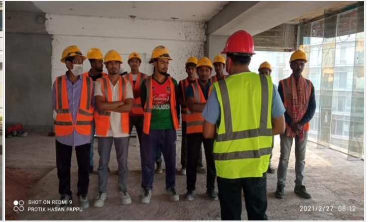
Rubish shifting to BTT, Purbachal on 28-02-21