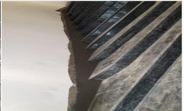
Round Stair Skirting Plaster finished fo on 05-02-21