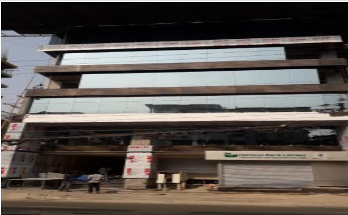
Front Side Opening Soon on 05-02-21