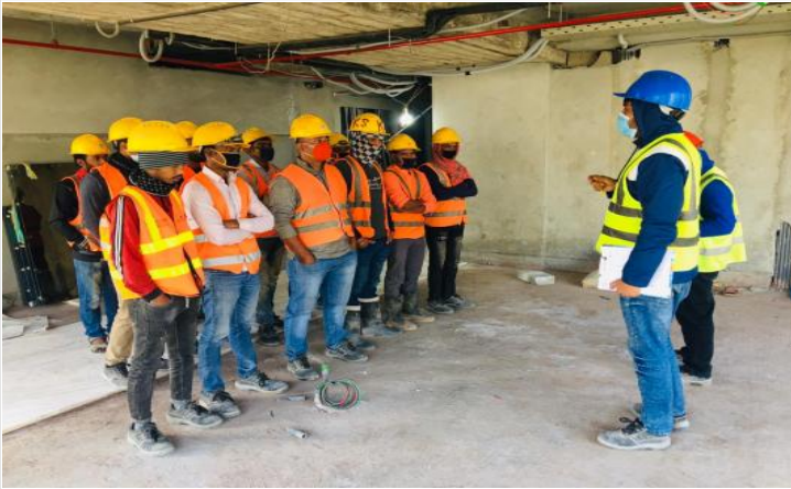
Toolbox Meeting-Work at Height on 01-02-21