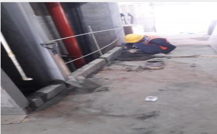
Duct upstand Blockwork on 10-02-21