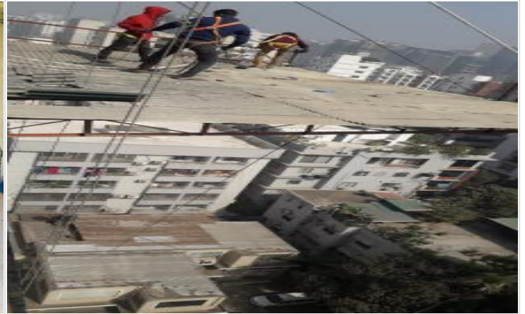
Toolbox Meeting-Work at Height on 01-02-21